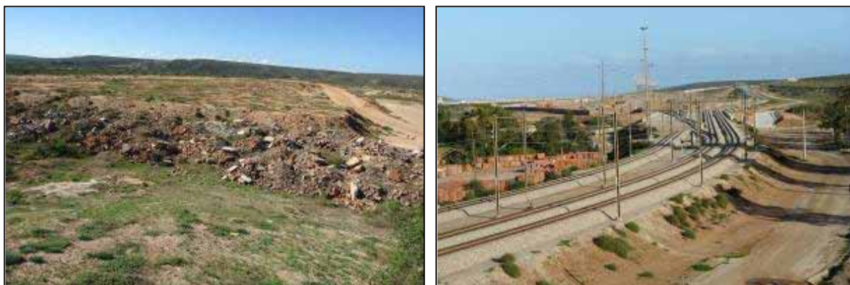
Figures 14A.10-14A.11: Views of the large piles of dump rubble material and the railway marshalling yard in Zone 9.