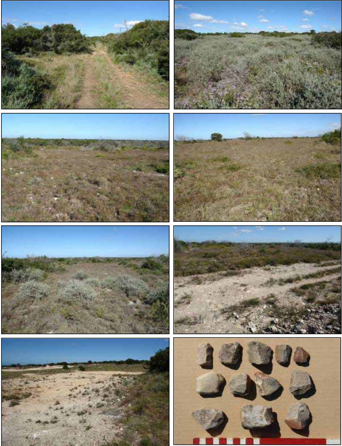
Figures 14A.12-14A.19: Views of the exposed calcrete and dense vegetation which cover the proposed compilation yard area in Zone 11 and Tankatara farm (top three rows) and the Middle Stone Age stone tools found at the borrow pit (bottom row).