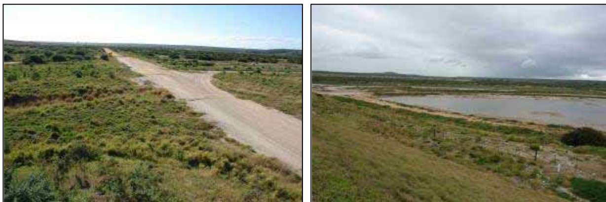
Figures 14A.8-14A.9: Views of the Coega River Valley and Zone 9.

The Coega River Valley comprises most of the zone. This vlei/wetland area along the river has been disturbed in the past by small scale farming activities, brick making and salt producing. Large areas are waterlogged and recently large scale dumping of building and other rubble took place in the area. The construction of the Coega rail marshalling yard, roads, bridges and power lines transformed the landscape permanently. Against this background it is highly unlikely that any significant archaeological sites/materials will be exposed during the development (Figures 14A.8 to 14A.11). SAHRA's Review Comments do not include any specific recommendations (Appendix 14A.c).