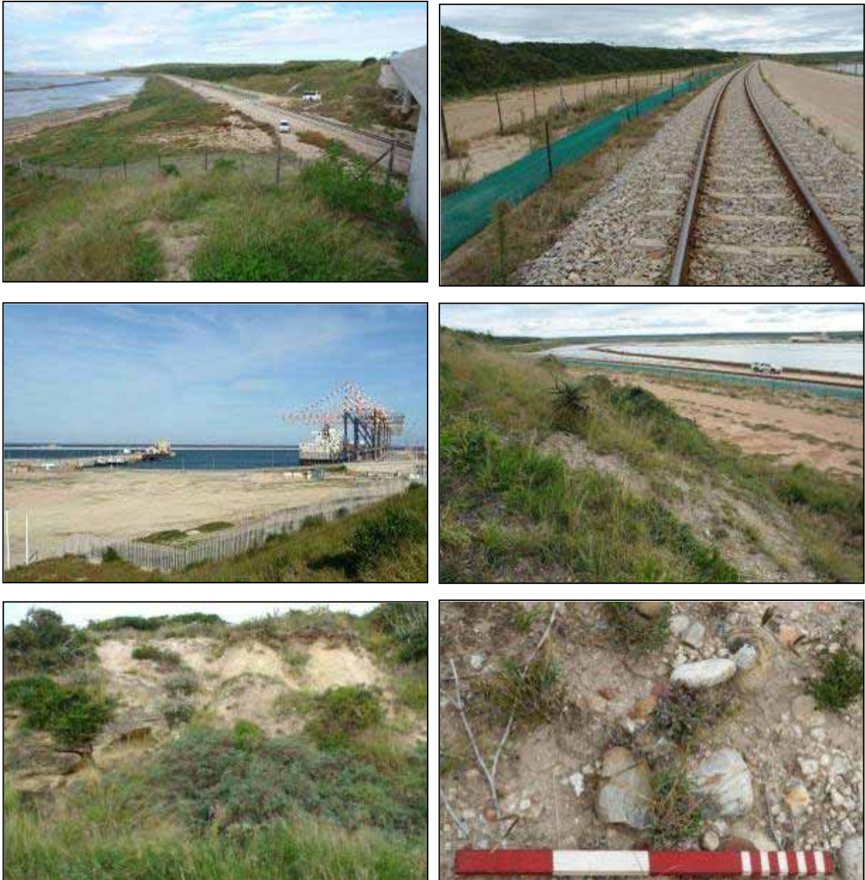
Figures 14A.1-14A.6: Views of the extensive transformation of the western side of the Coega River by the construction of the railway line and the harbour (top row, bottom left) and the exposed calcrete deposit along the western embankment with Earlier and Middle Stone Age stone tools (bottom right) within Zone 8 of the IDZ.