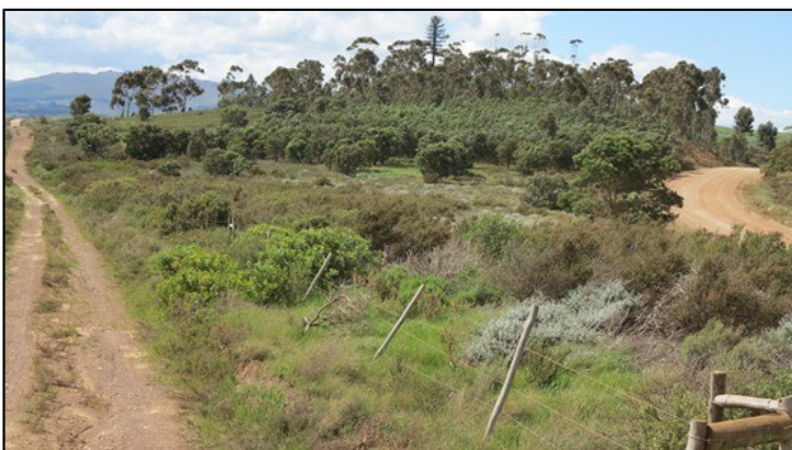
Figure 2: View towards east showing the affected area which starts at the line of trees and is located between the track on the left and trees (Tusenius 2012: 7)