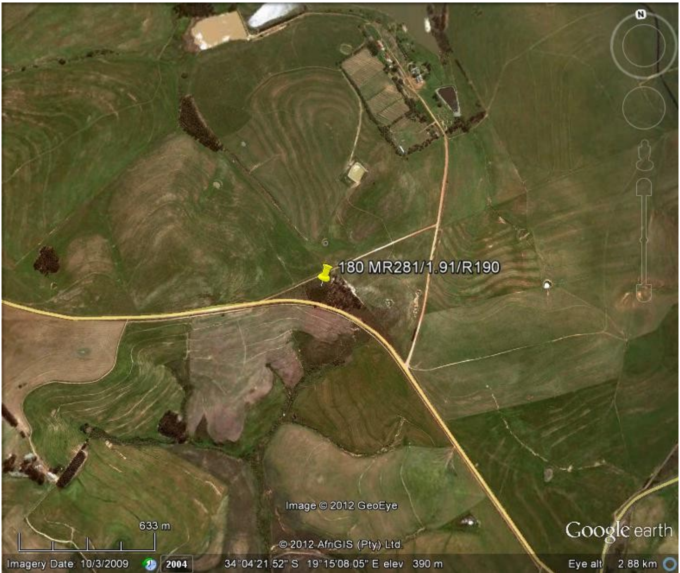
Figure 4: Aerial view of existing borrow pit locations