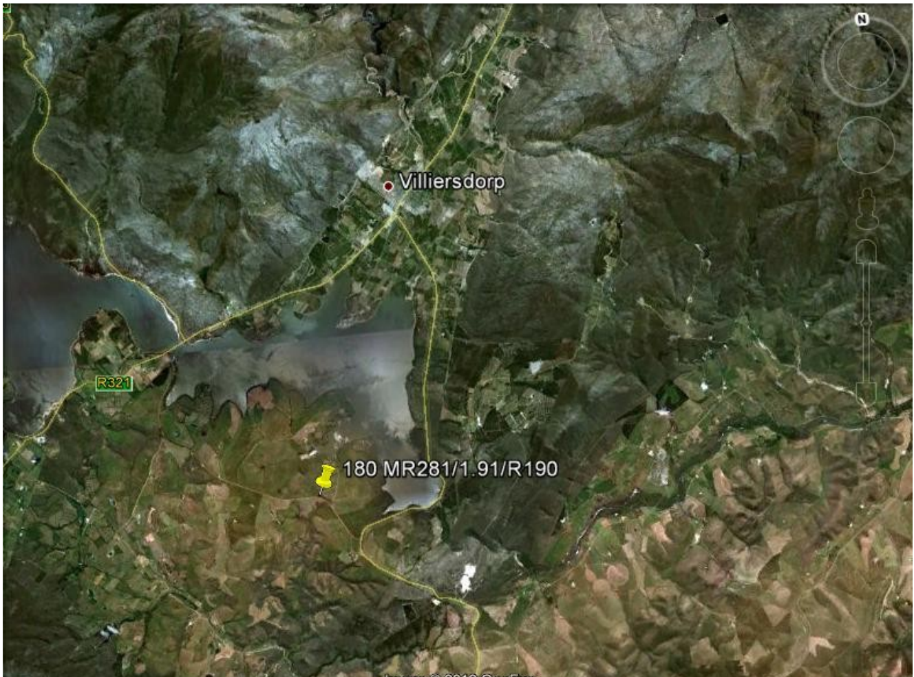
Figure 1: Locality plan of site (Google earth image, October 2012)

It is proposed to expand an existing borrow pit at MR281/1.91/R190 accessed from the R43 south of Villiersdorp in the Overberg District, Western Cape. The southern part of the area investigated is occupied by dense almost thicket-forming alien vegetation while the eastern part is covered by young and mature gum trees surrounding a rectangular blue gum plantation. The western and northern extent is covered by low scrub and grass with scattered small shrubs and trees. Although the site may have been used as a sheep or cattle kraal in the early days, it has evidently been lying fallow for some time. Surrounding context is characterized by cultivated land. The site lies on Portion 1 of Farm 112 in ownership of Municipality of Theewaterskloof. Borrow pits coordinates are 34° 4' 20.93"S 19° 15' 4.38" E