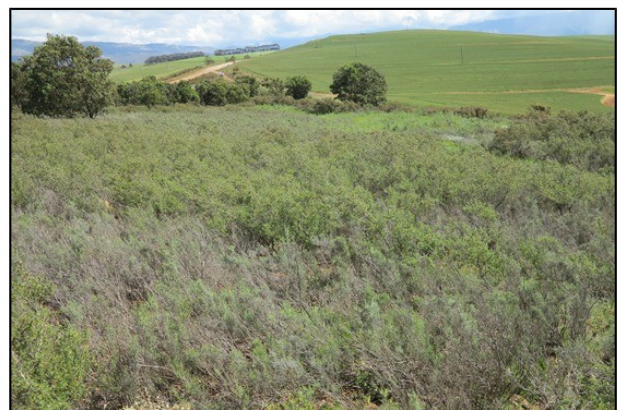
Figure 3: view towards the southwest of the renosterveld vegetation in the north-western half of the site (Tusenius 2012: 7)