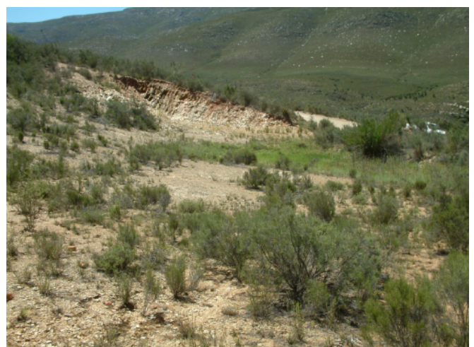
Figure 2: View towards existing borrow pit

Surrounding land use includes agriculture. Site is located within the Klein Langkloofberge with a gentle gradient to the south. The land on which the borrow pit is located is not being actively used and there are no buildings on site. Geology is dominated by shale of the Gydo Formation (Bokkeveld Group, Cape Supergroup) deemed suitable as gravel wearing course (Galliers Jan, 2011).