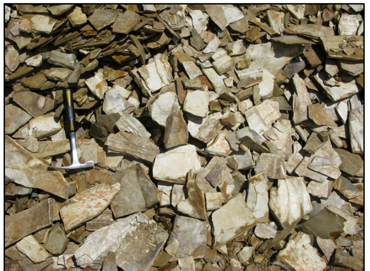
Figure 4: Heap of excavated Gydo Formation mudrocks in existing borrow pit (Almond, March 2012)