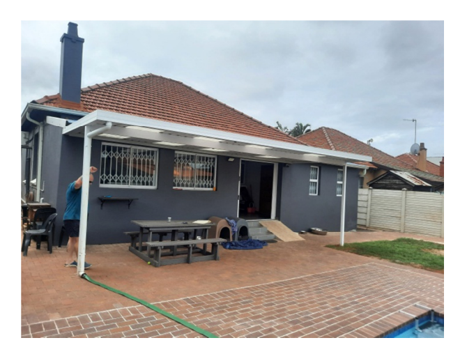
Rear of house showing completed awning and enclosed veranda