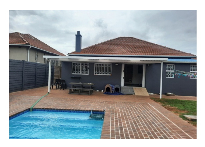
Completed showing awning and pool area towards enclosed veranda