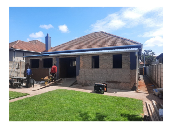
Enclosing veranda in.