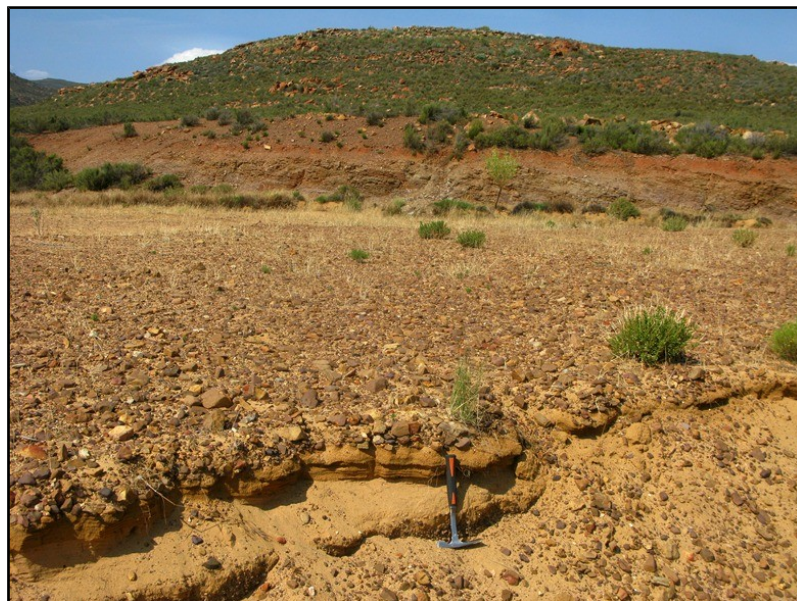
Figure 2: View northeastwards across borrow pit whose floor is largely mantled by sandy and gravelly alluvium (Almond 2013: 5)