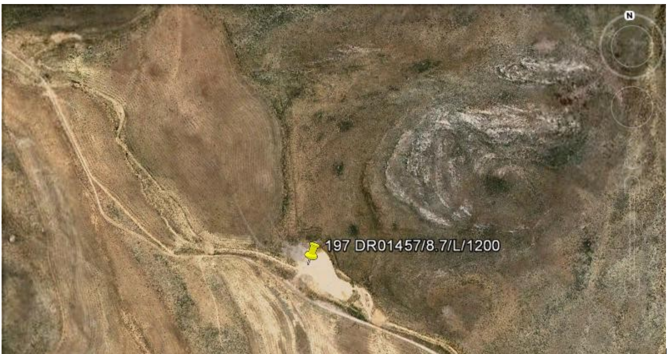
Figure 4: Aerial view of existing borrow pit (Google earth image, February 2013)