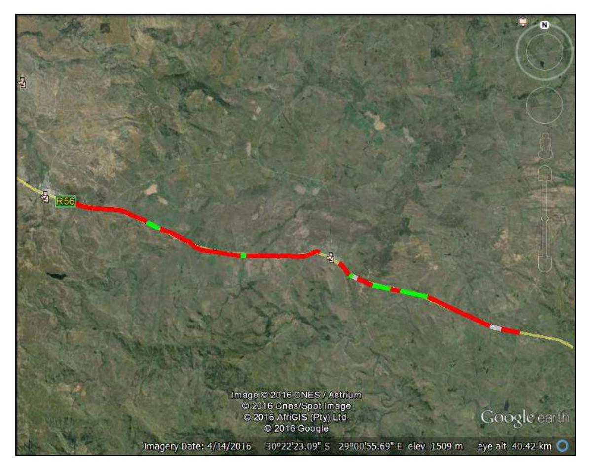
Figure 6.1 Palaeosensitivity of the road upgrading of the R56

The likely impact of the proposed development on local fossil heritage is determined on the basis of the palaeontological sensitivity of the rock units concerned and the nature and scale of the development itself, most notably the extent of fresh bedrock excavation envisaged (Figure 5.1). The different sensitivity classes used are explained in Table 1 above.