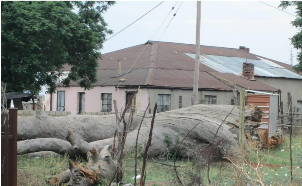
FIGURE 17: THE HOUSE MARKED AS SITE NO. 5.