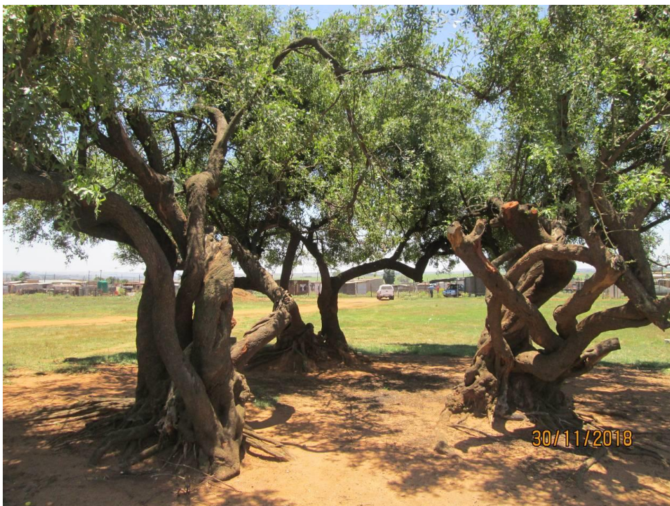
FIGURE 19: THE TREE AT SITE NO. 6.