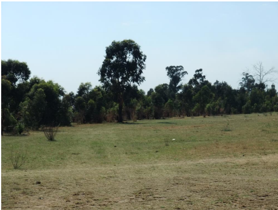
FIGURE 12: VIEW OF VEGETATION AND ALIEN TREES IN THE SURVEYED AREA.