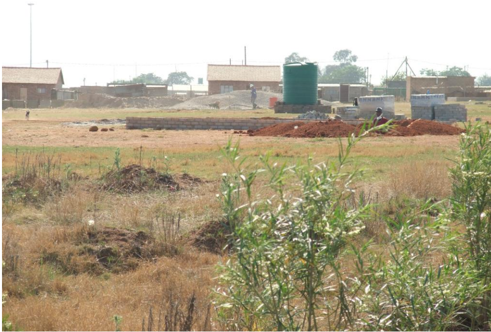
FIGURE 9: BUILDING ACTIVITIES IN THE SURVEYED AREA.