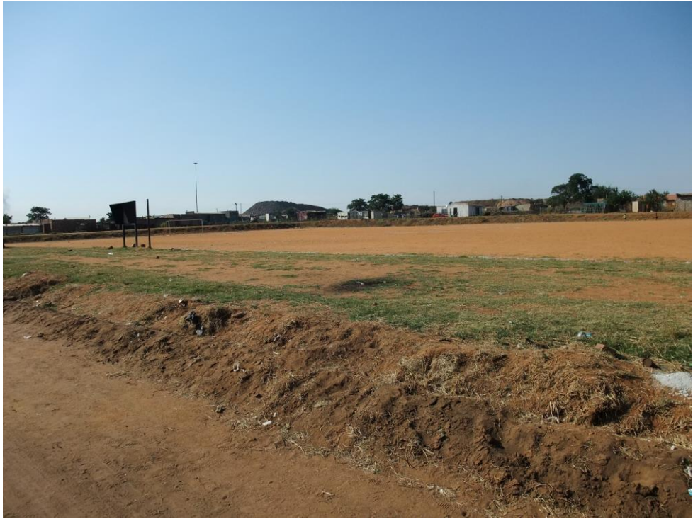
FIGURE 7: OPEN SECTION OF LAND IN THE SURVEYED AREA.