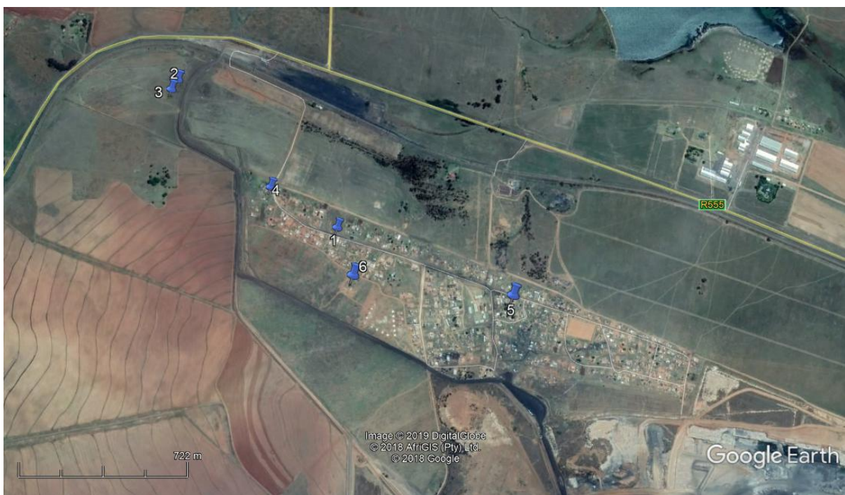
FIGURE 20: LOCATION OF SITES IDENTIFIED DURING THE SURVEY.

The survey of the indicated area was completed successfully. Six sites were identified (Figure 20).