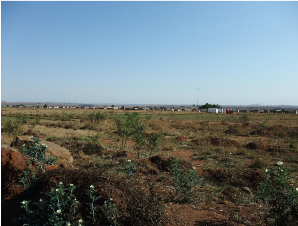
FIGURE 11: VIEW OF VEGETATION IN THE SURVEYED AREA.