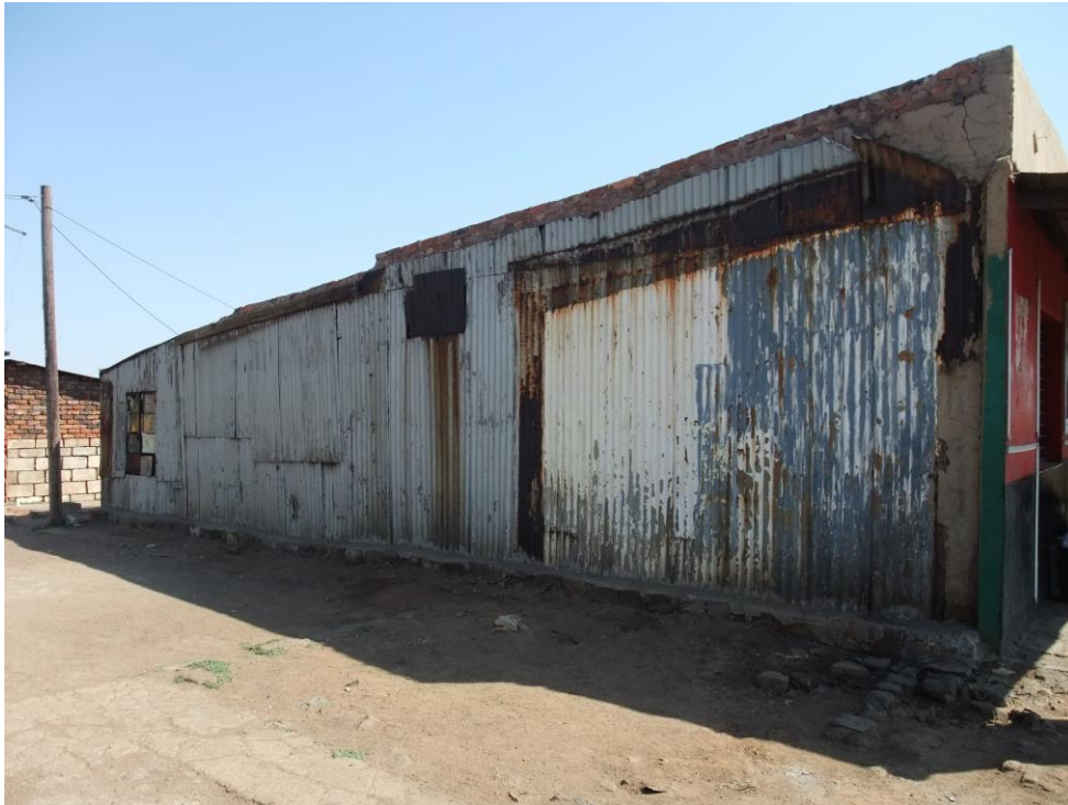
FIGURE 16: STONE AND CORRUGATED IRON HISTORICAL BUILDING.