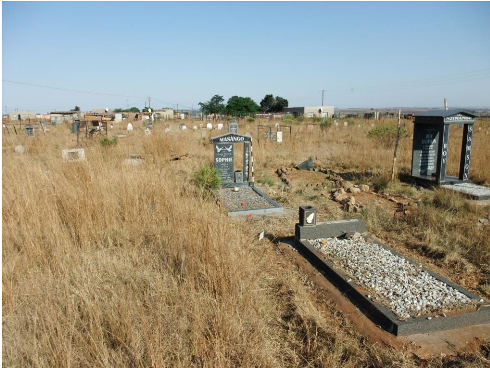
FIGURE 13: SOME OF THE GRAVES AT SITE NO. 1.