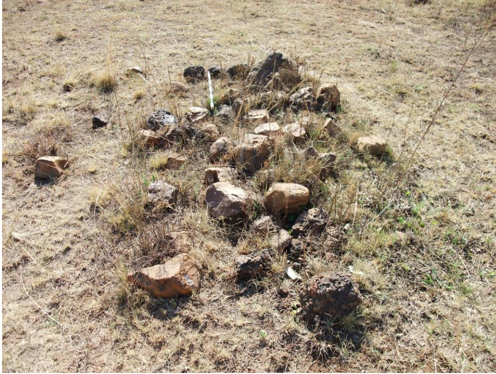
FIGURE 15: SINGLE GRAVES - SITE NO. 3.