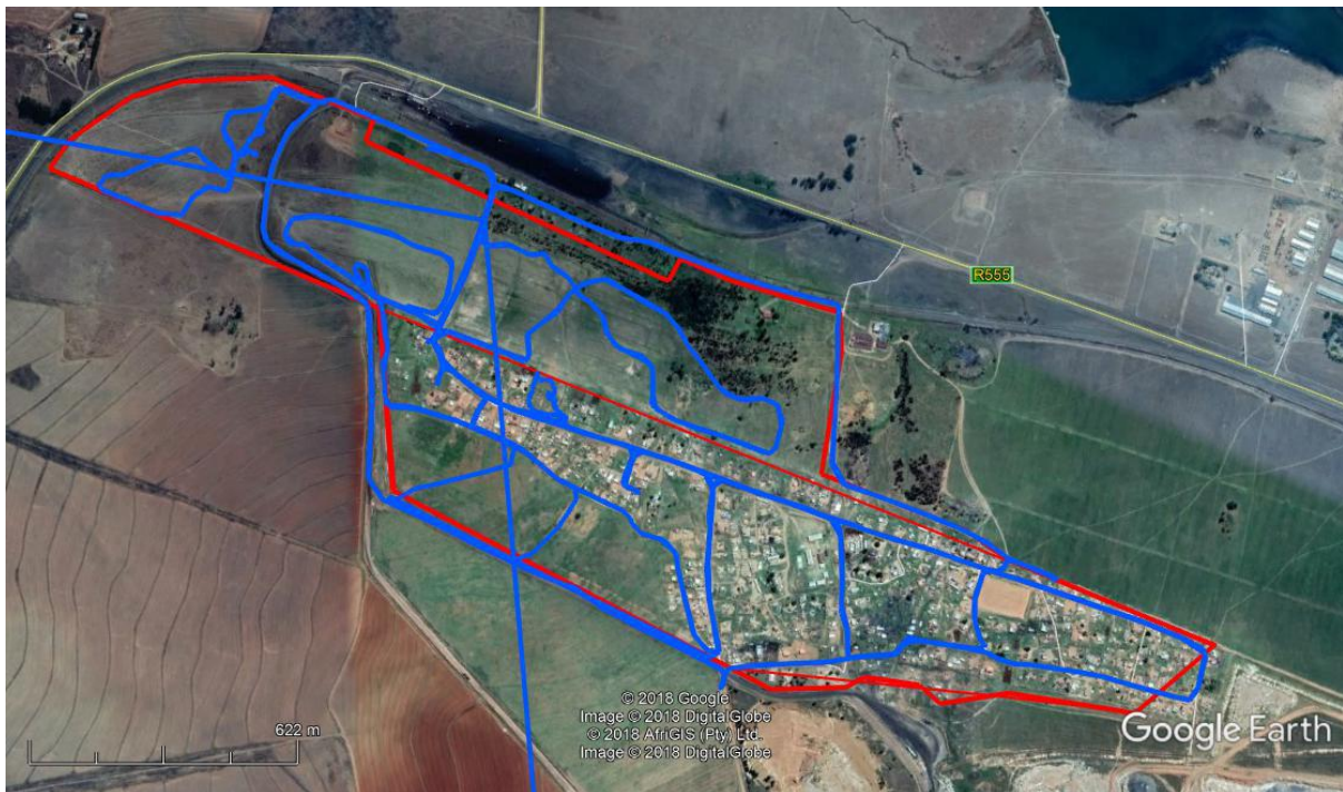
FIGURE 5: GPS TRACK OF THE SURVEY.

Certain factors, such as accessibility, density of vegetation, etc. may however influence the coverage. In this instance the area was found to be reasonably disturbed. The vegetation cover was mostly between low and medium in height and with dense under footing. The horizontal archaeological visibility was therefore good and the vertical archaeological visibility fair. The size of the surveyed area is approximately 138 Ha. The survey took 4 hours to complete.