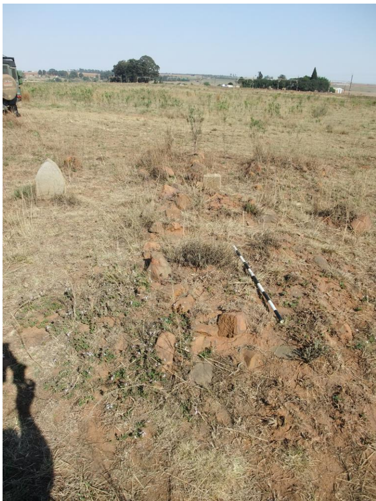
FIGURE 14: SOME OF THE GRAVES AT SITE NO. 2.