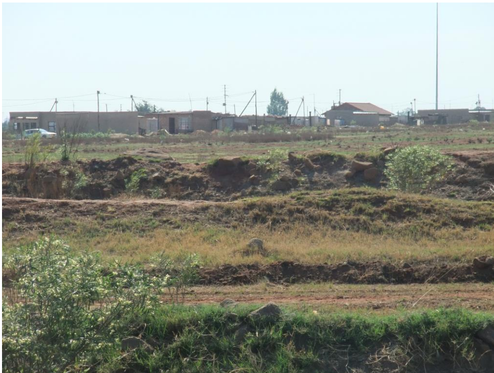
FIGURE 8: EARTHWORK ACTIVITIES AT THE SURVEYED AREA.