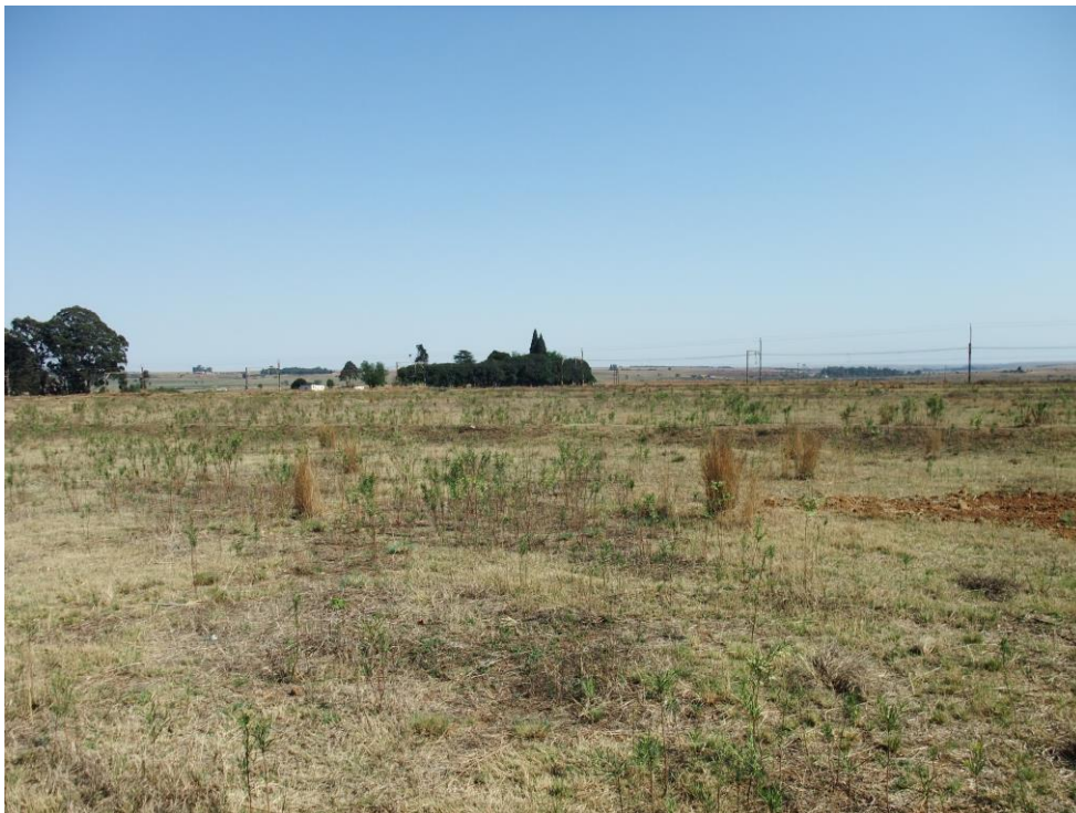
FIGURE 10: OLD FIELDS IN THE SURVEYED AREA.