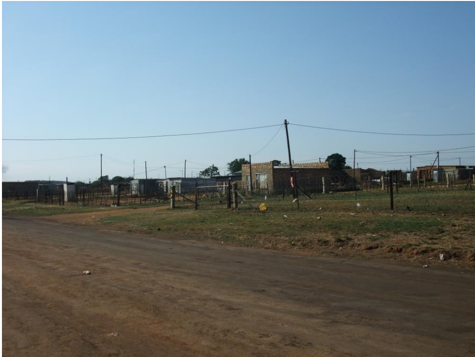
FIGURE 6: HOUSES IN THE SURVEYED AREA.

The topography of the area is reasonably flat. No rivers or outstanding natural features are present.