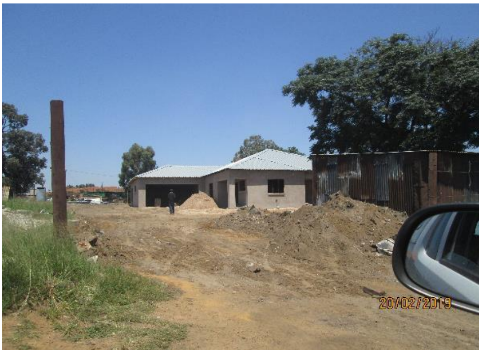
FIGURE 18: A RECENT PHOTOGRAPH OF THE HOUSE AT SITE NO. 5.