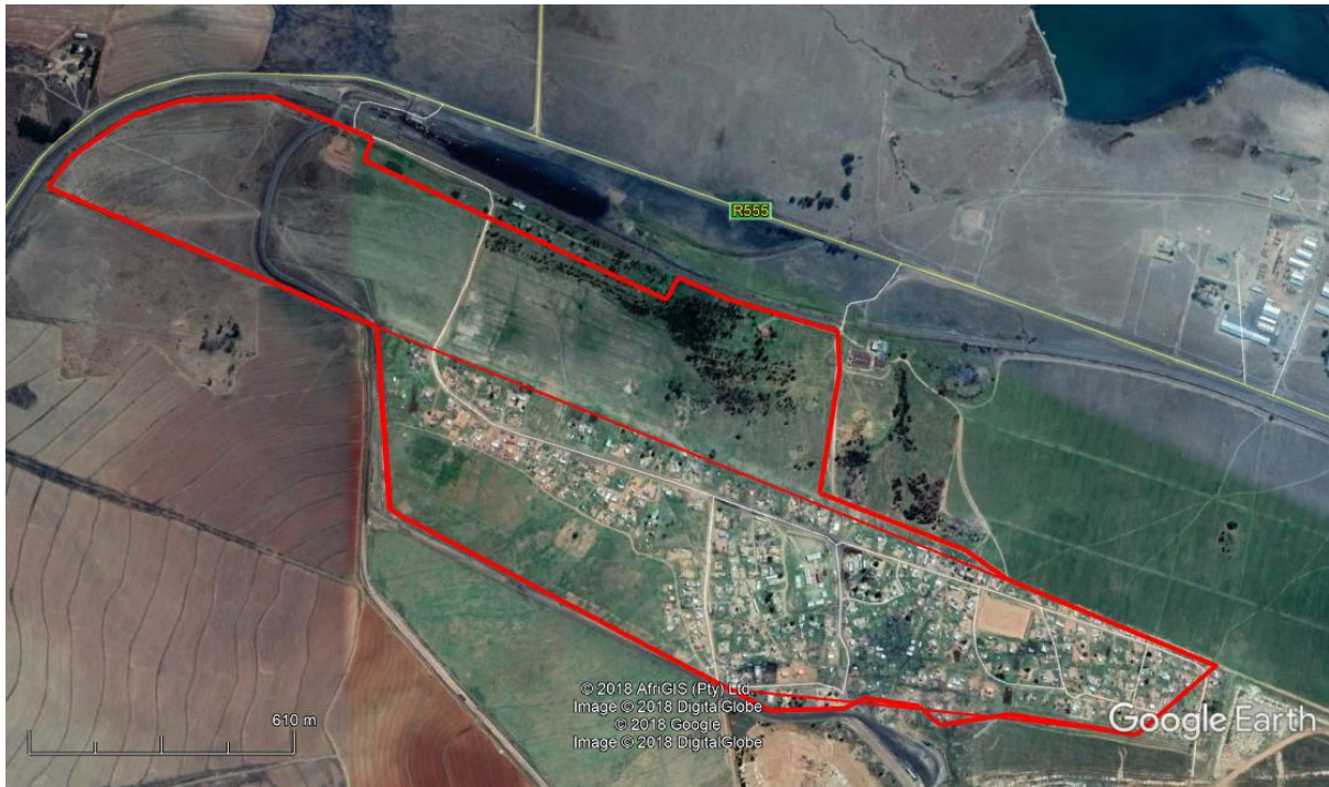
FIGURE 3: ZOOMED IN VIEW OF SURVEYED SITE.