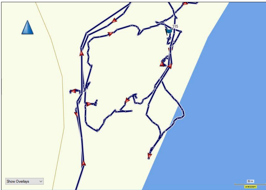
3. Higher resolution of the track log