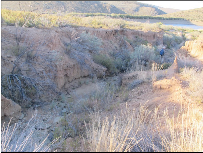
Figure 5: View northwards along the donga to the west of the affected area of pit 25. Slabs of weathered Bokkeveld shale are visible in the bottom of the donga.