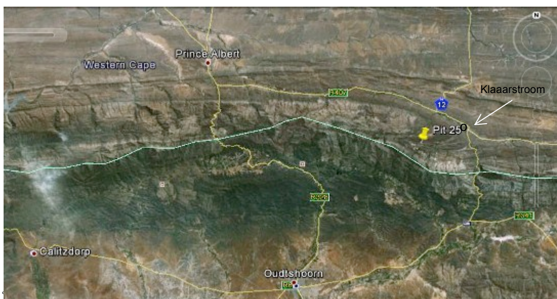
Figure 1: Google earth image showing the location of proposed borrow pit DR1721/8.4/0.02R (Vidamemoria pit 25), approximately 8.7 km to the southwest of Klaarstroom. The N12 cuts through the Swartberg at Meiringspoort, to the south of Klaarstroom. The relevant 1:50 000 topographical map is 3322AD Rosselserf.

Natura Viva cc was appointed by Vidamemoria Heritage Consultants on behalf of Aurecon South Africa (Pty) Ltd to undertake an Archaeological Impact Assessment (AIA) at the site of a proposed borrow pit DR1721/8.4/0.02R (Vidamemoria pit 25) on the farm Kleinvlei, approximately 8.7 km to the southwest of Klaarstroom (Figure 1). Klaarstroom lies in the Prince Albert Municipality of the Central Karoo District, to the north of the Swartberg mountain range. Material excavated from the borrow pit will be used for the re-gravelling of portions of road DR01721. The proposed borrow pit is located up-slope of a dam, a converted former quarry, which stores water used for irrigation (Figure 2). Pit 25 will be incorporated into the existing dam after development. No new roads will have to be constructed as access to the pit under consideration will be from existing roads and tracks.