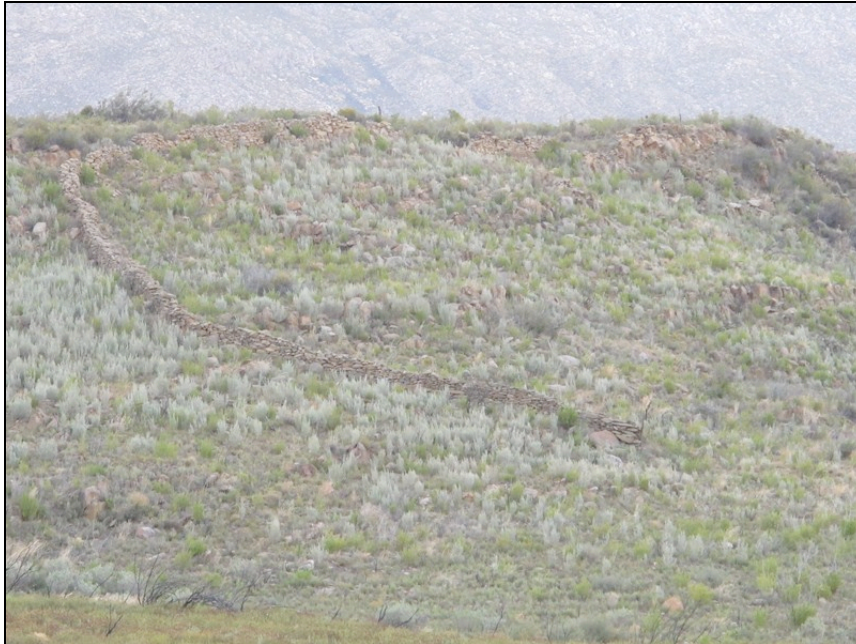
Figure 9: Close up of the dry stone wall viewed from the northeast.