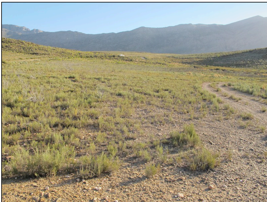
Figure 4: View of the affected area looking towards the Swartberg in the south. Low, fairly sparse vegetation covers the colluvial gravelly, silty sand on the surface here.