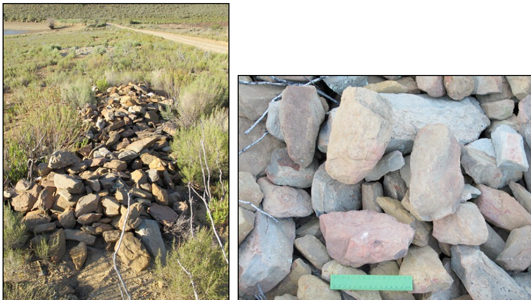
Figures 6 and 7: Heaps of stone from past ploughing in the foreground and from a geotechnical pit in the background; detail of some of the heaped rocks. The ruler is 15 cm in length.

Results of survey: The affected area and some land to the east of the road were surveyed (Figure 2). No archaeological remains were observed on the ground or in the heaps of rock. This was somewhat surprising given that Stone Age tools have been found in the general area (see section 5.1) and the fact that the quartzitic boulders, deriving from the old land surfaces, would provide a good source of raw material. Several quartzite exfoliation flakes, which could be confused with artefacts, were noted.