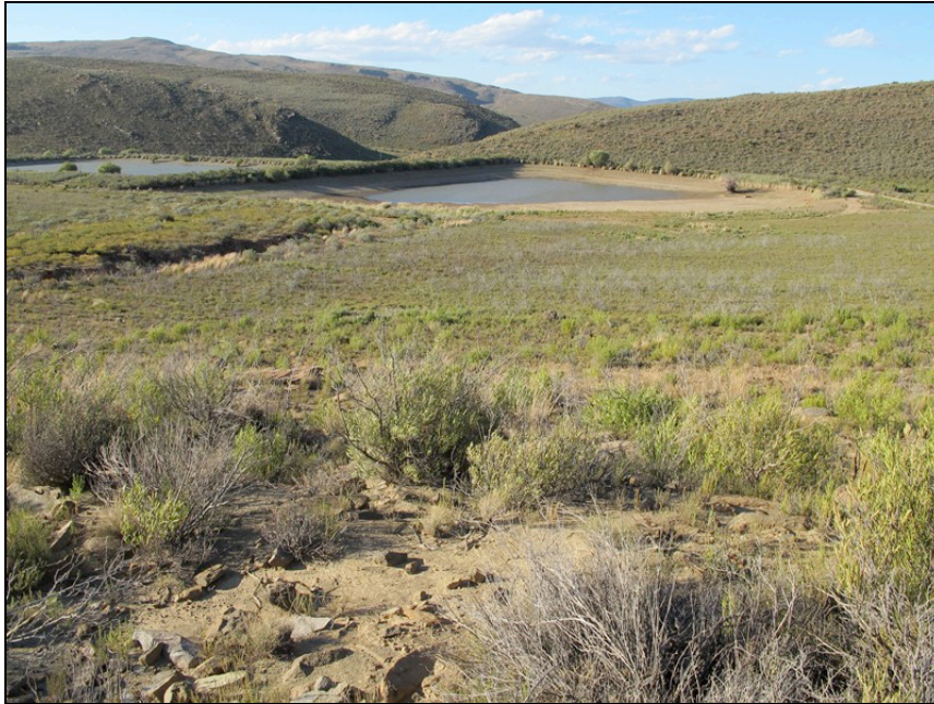
Figure 3: View across the affected area towards the dam in the north. The donga is visible on the left of the photo.