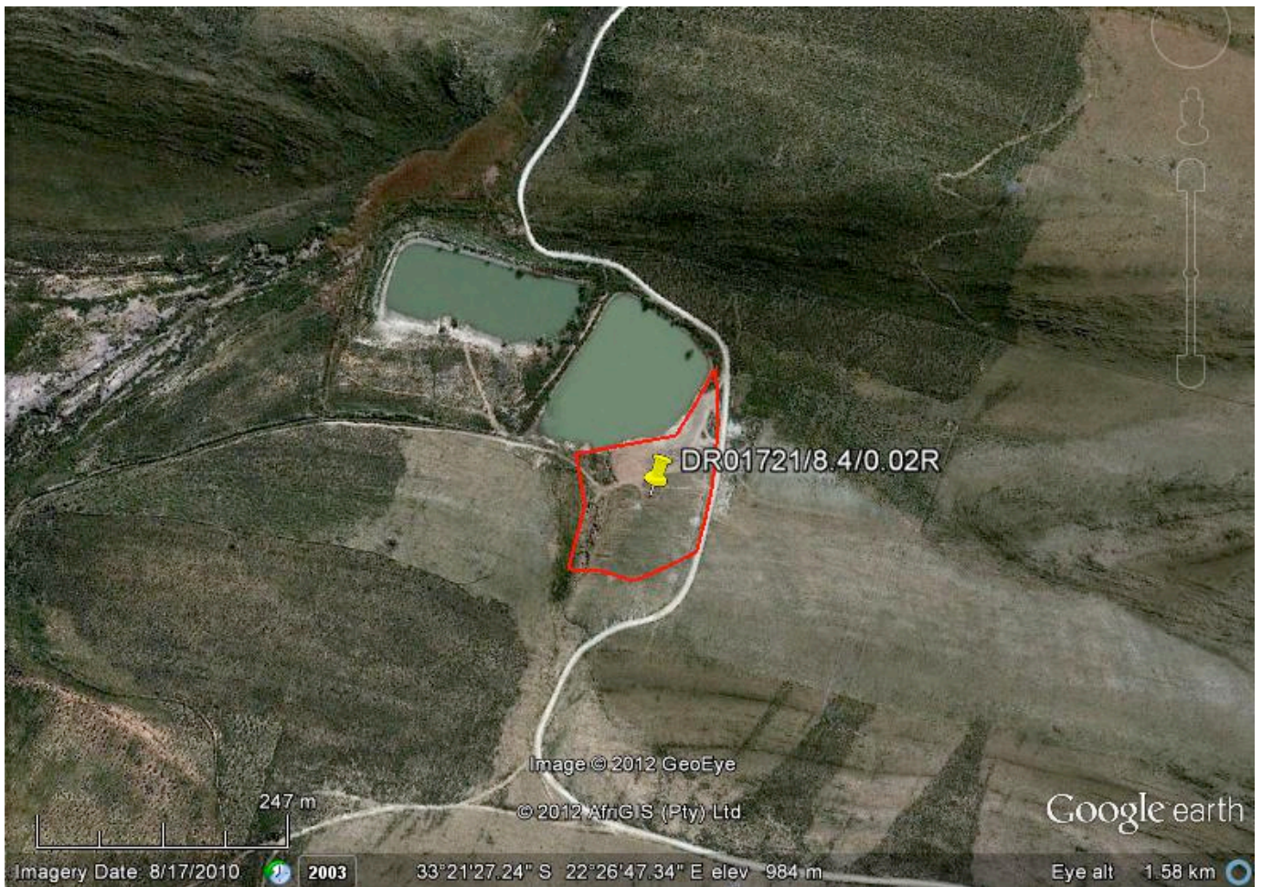
Figure 5: Aerial view of proposed borrow pit location (Google earth image, April 2012)