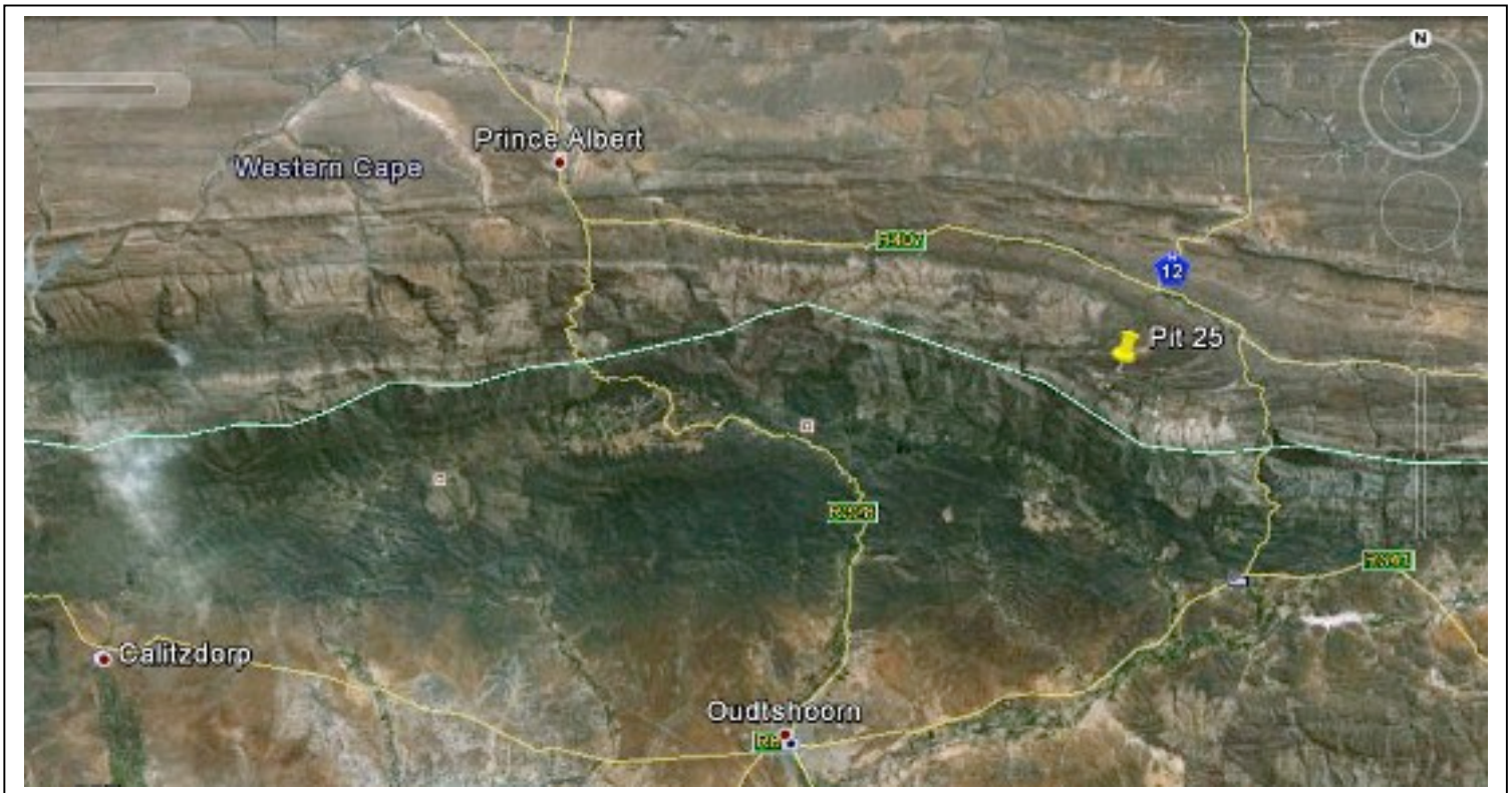
Figure 4: Aerial view of proposed borrow pit location (Tusenius, March 2012)