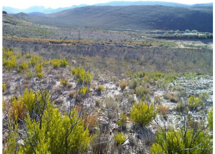
Figure 3: Looking west across site of proposed expansion located to the south and east of existing farm dam (April 2011)