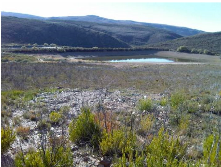
Figure 2: Looking northwest across the site of proposed expansion located between road DR01721 and existing dam (April 2011)