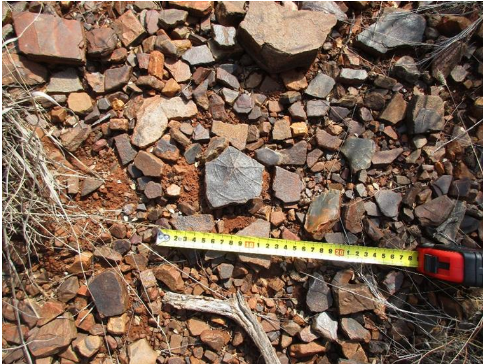
Fig 3. Photo showing a possible fossil imprint.

The Tsineng Formation at the top of the Campbell Rand carbonate succession has yielded both stromatolites which were previously assigned to the Tsineng Member of the Gamohaam Formation, as well as filamentous microfossils named Siphonophycus (Altermann & Schopf, 1995).