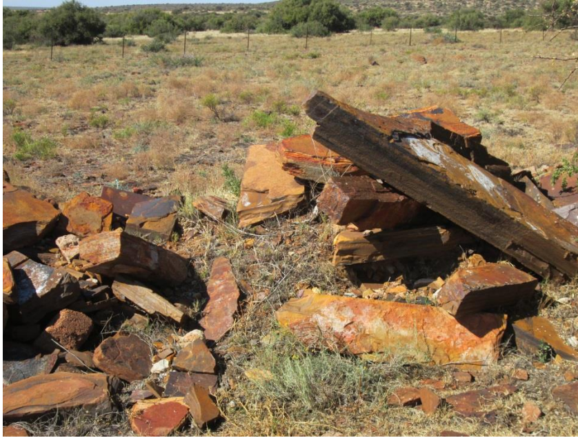
Fig 2. Photo showing some banded ironstone in the area.