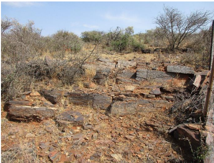
Fig 3. Photo showing sedimentary layers on the slope of the ridge on Werda.