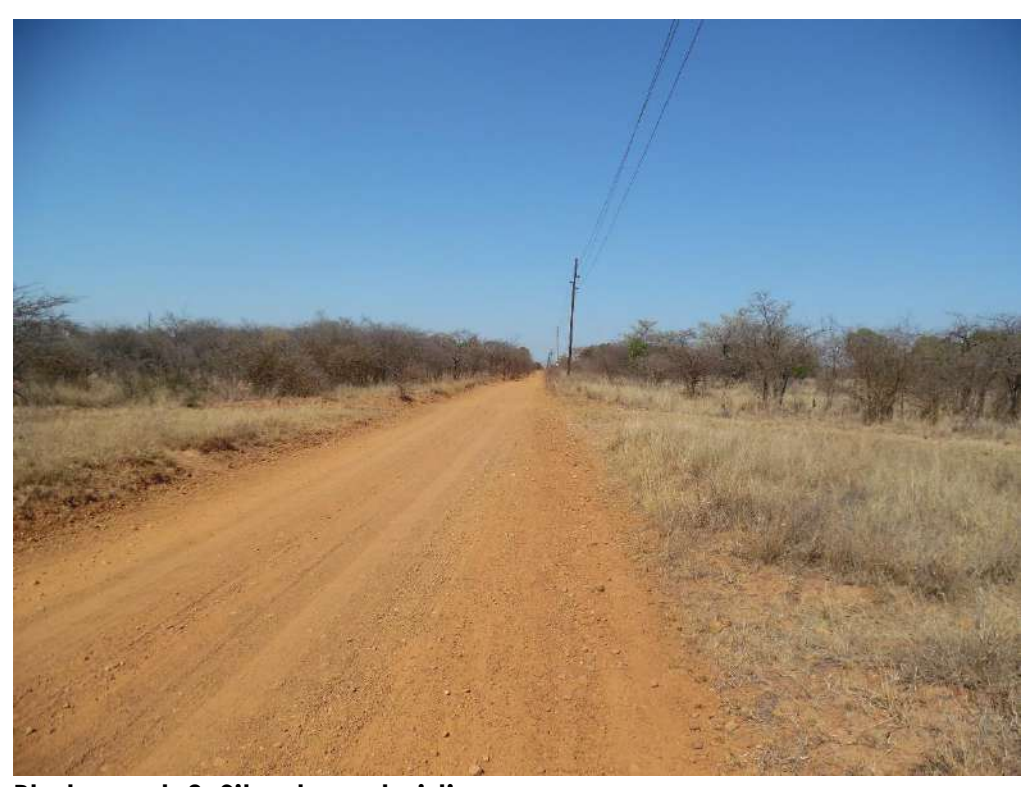
Photograph 8: Site characteristics