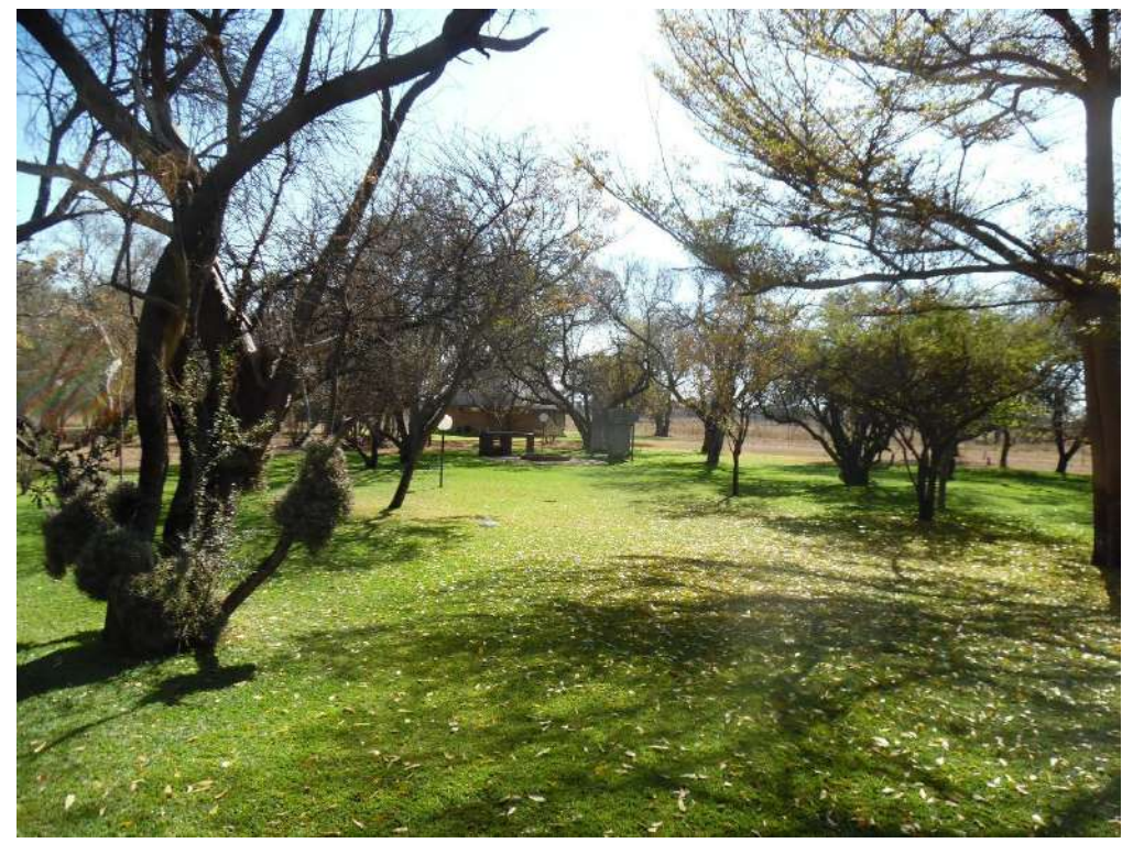
Photograph 13: Site characteristics