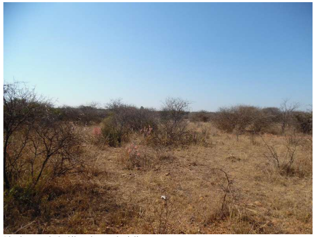
Photograph 9: Site characteristics