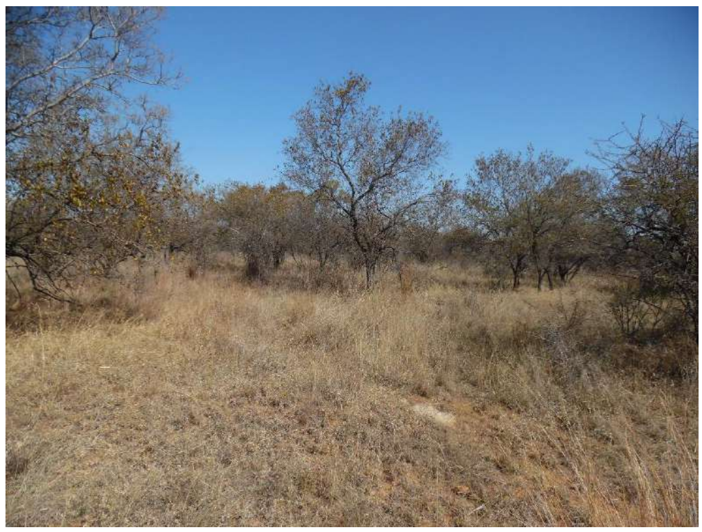
Photograph 6: Site characteristics