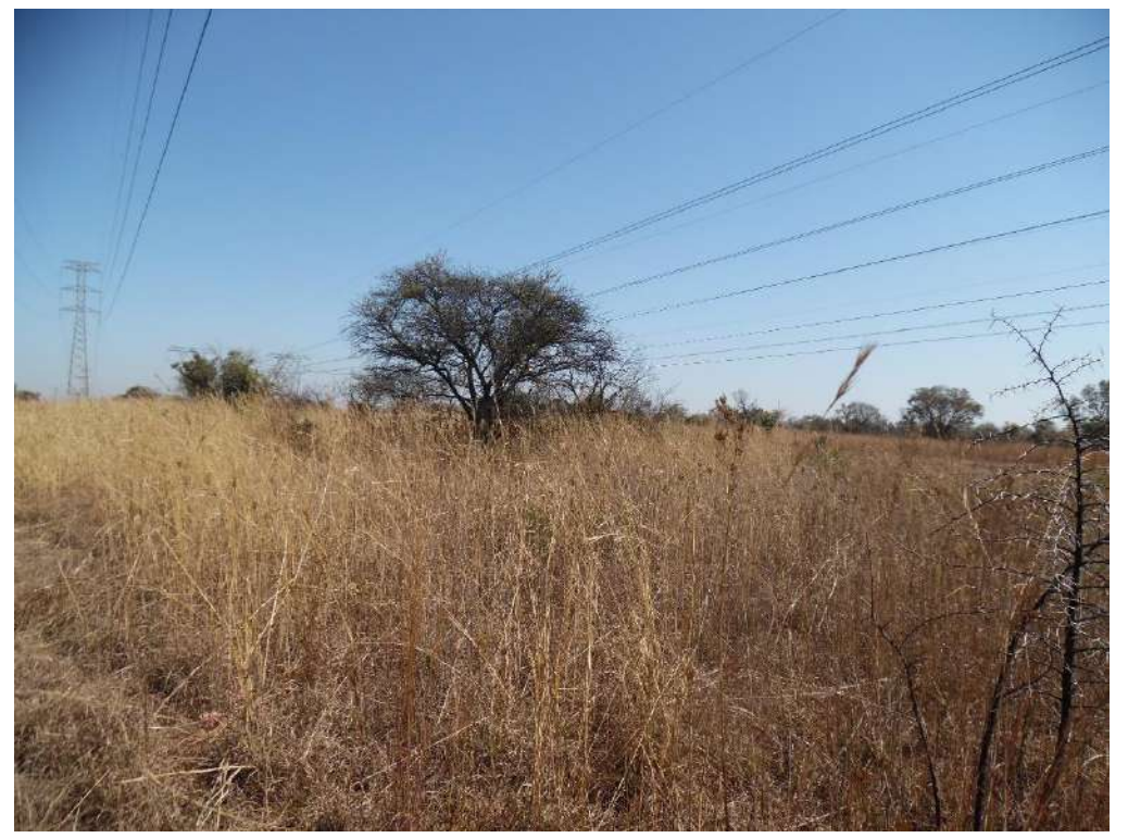
Photograph 4: Site characteristics