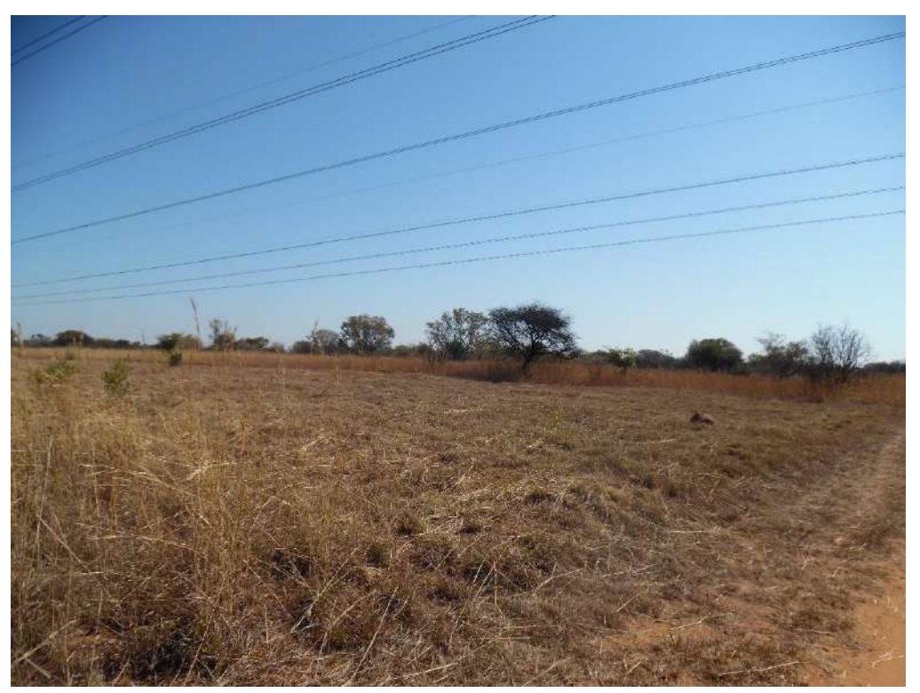
Photograph 5: Site characteristics