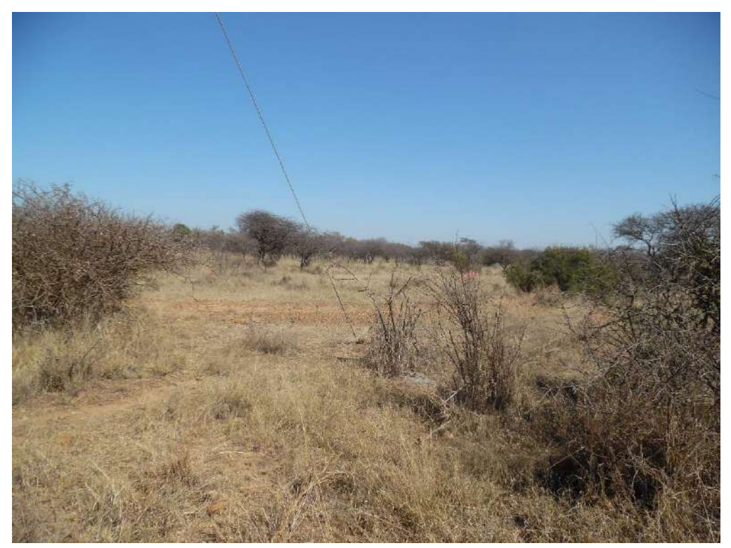
Photograph 7: Site characteristics