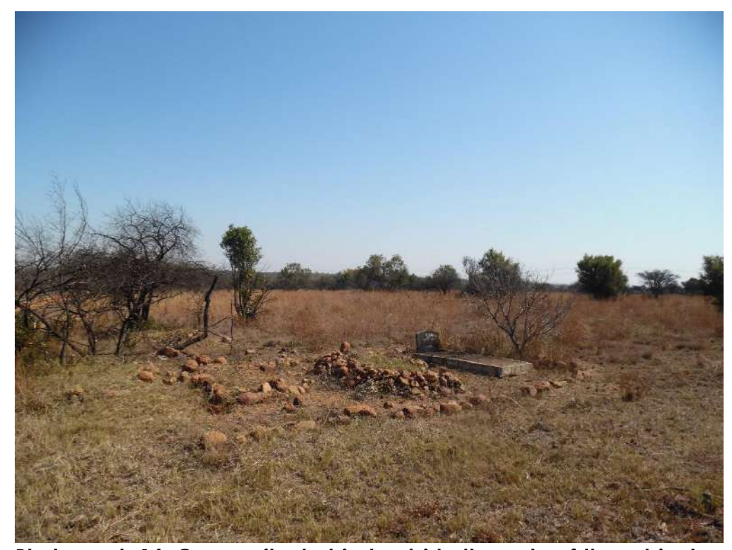
Photograph 14: Graves situated just outside the gate of the subject area. These graves will not be impacted on by the proposed development

The site does not contain marked graves or burial grounds. A couple of graves is situated just outside the gate of the subject area, but will not be impacted on by the proposed development.