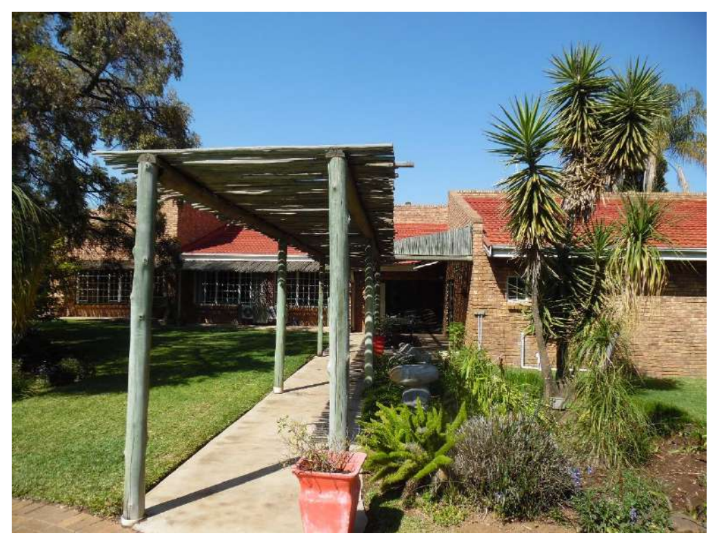
Photograph 11: Site characteristics