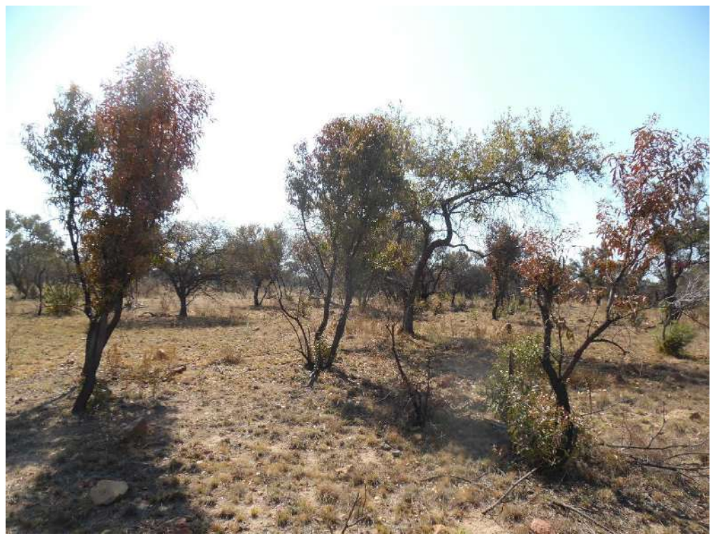
Photograph 10: Site characteristics