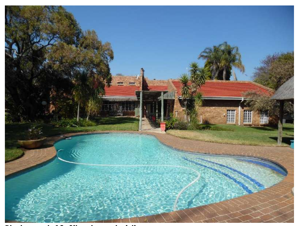
Photograph 12: Site characteristics