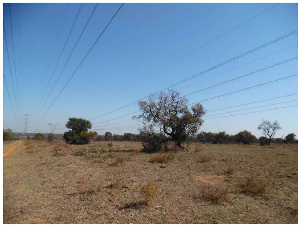
Photograph 1: Site characteristics