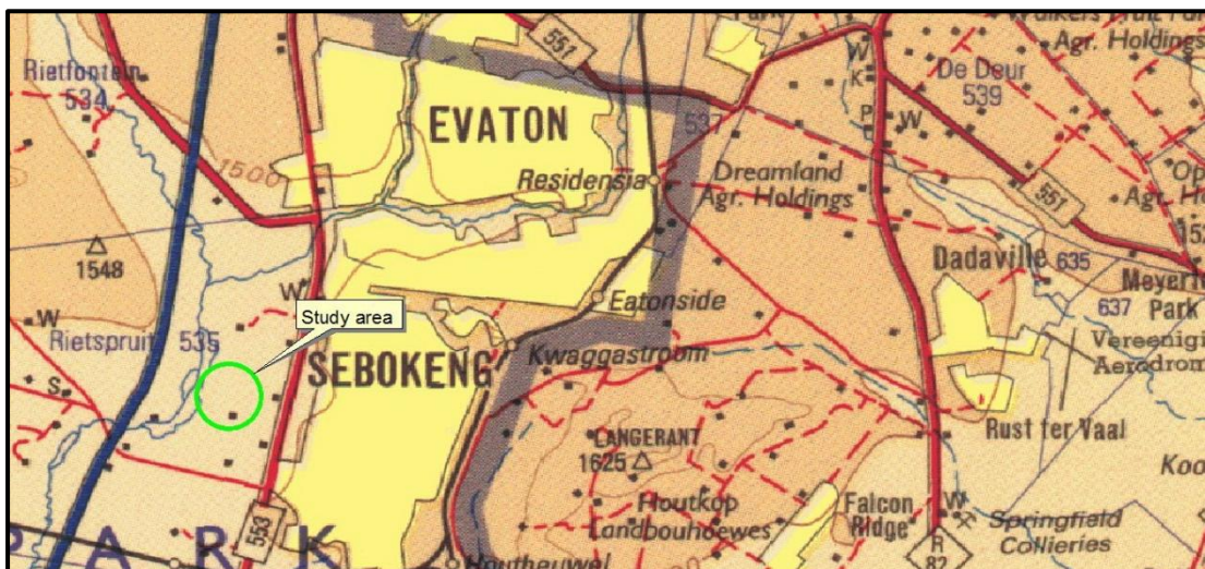
Fig. 1. Location of the study area in regional context. (Map 2626: Chief Surveyor-General)

The site is located west of Sebokeng township and northwest of Vereeniging in the Sedibeng municipal district of Gauteng (Fig. 1).