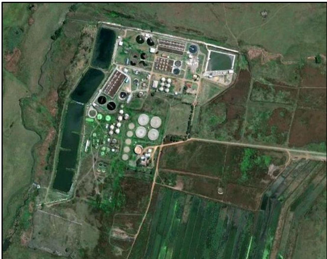
Fig. 3. Aerial view of the study area.