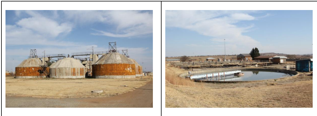
Fig. 2. Views over the study area.

Based on the 1957 version of the 1:50 000 topocadstral map (Fig. 4) shows that the site did not exist by then. The implication is that it was established at a later date and it is therefore not older than 60 years. In any case, it was extensively upgraded in 1999 at a cost of R 70 million.