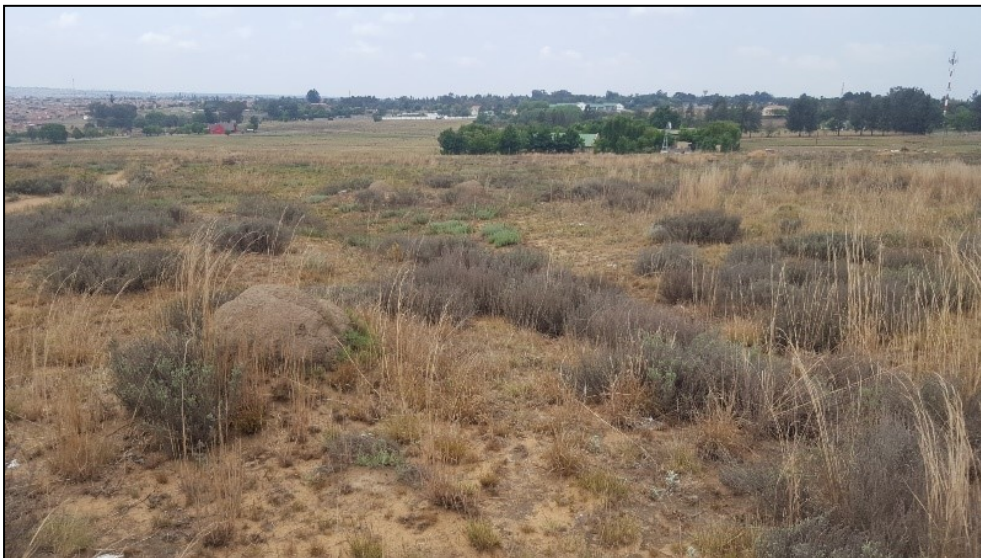
Figure 3-4: View of vegetation and ant hills in the project area.