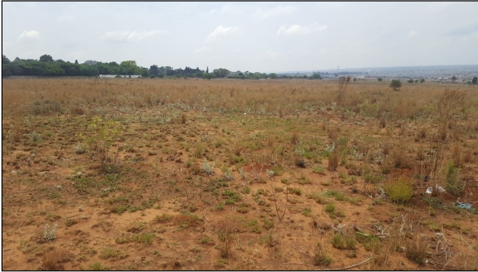
Figure 3-3: A general view of the project area, looking north .