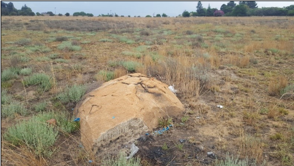
Figure 3-7: A sandstone boulder in the project area.