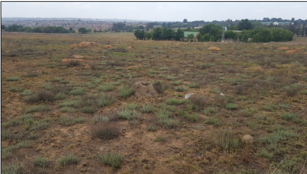
Figure 3-8: General surroundings in the project area, looking south.