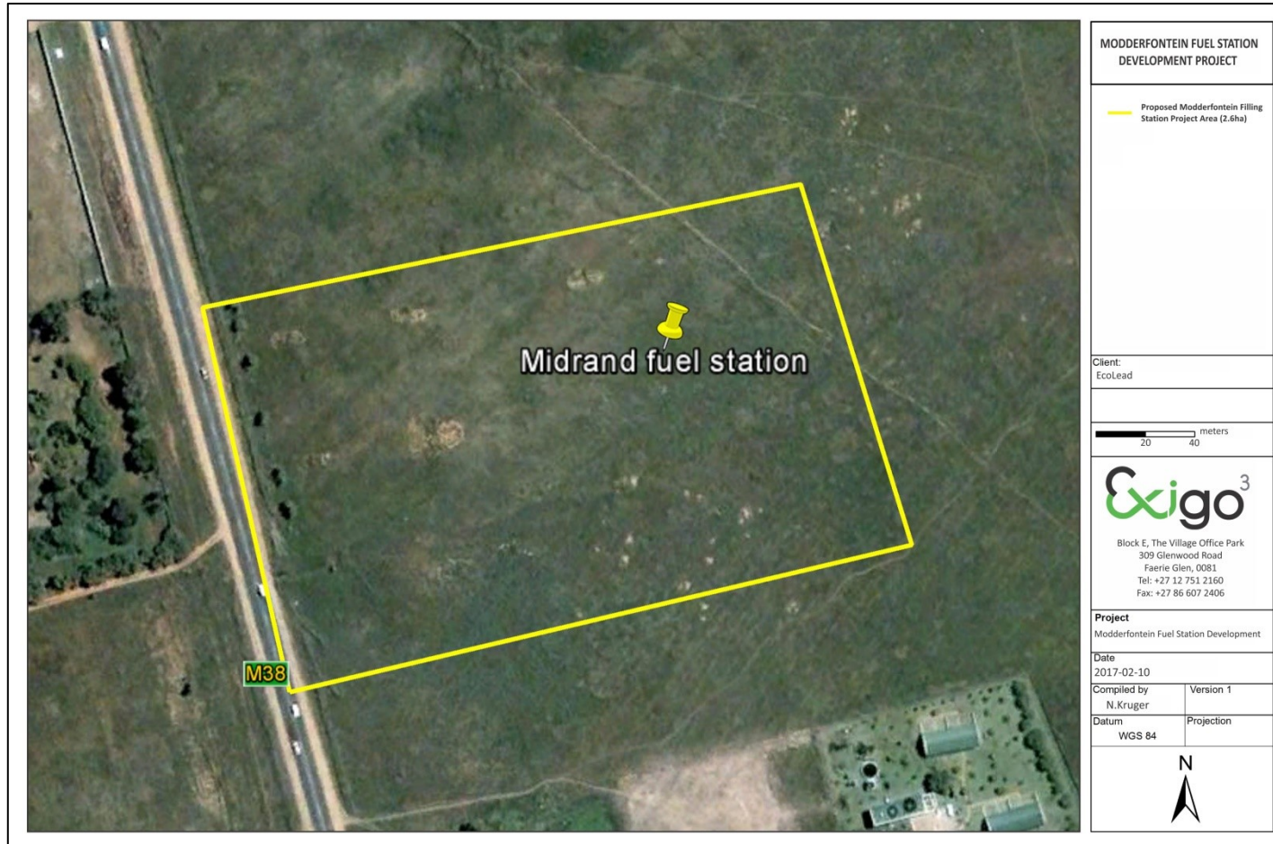
Figure 1-1: Aerial representation of the Modderfontein Fuel Station Development location and proposed surface portion.