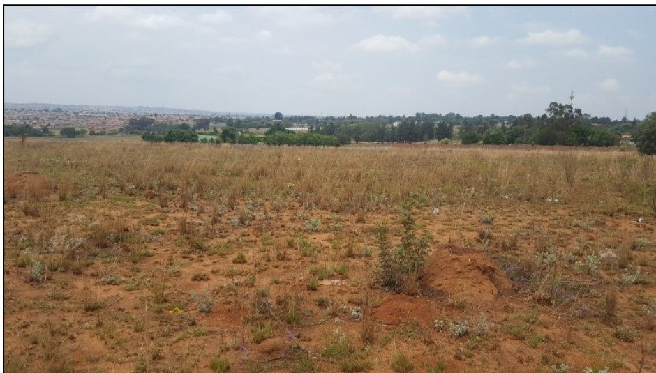
Figure 3-2: General surroundings of the project area, looking east.

The surrounding vegetation around Midrand is mostly comprised out of mixed grasslands and some tree cover. However, the landscape around the project area has been transformed by urbanization and visibility at the time of the AIA site inspection (October 2016) was moderate to high (see Figures 3-2 to 3-5). In single cases during the survey sub-surface inspection was possible. Where applied, this revealed no archaeological deposits.