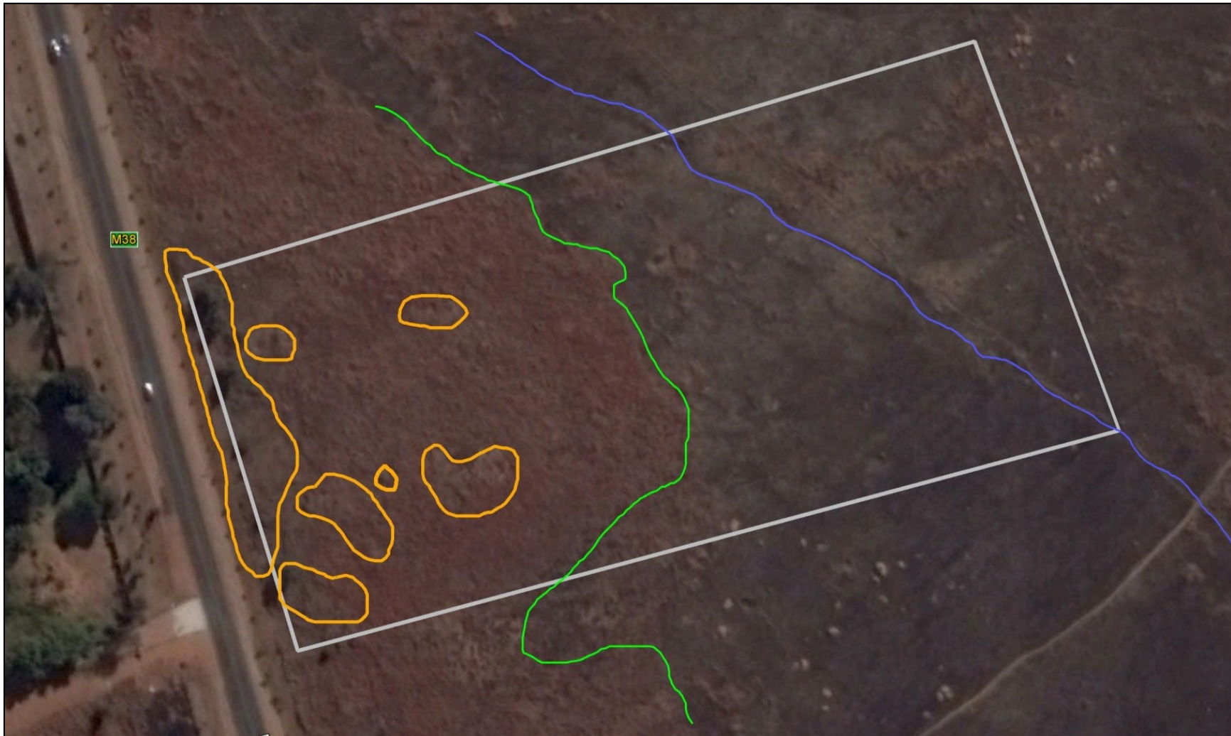
Figure 3-1: Google Earth imagery of the proposed project area (white outline) with possible signs of surface changes or disturbance; ant hills or refuse heaps (?) are marked in orange, vegetation change possibly a sign of water seepage is marked in green and a drainage line is indicated in blue line.