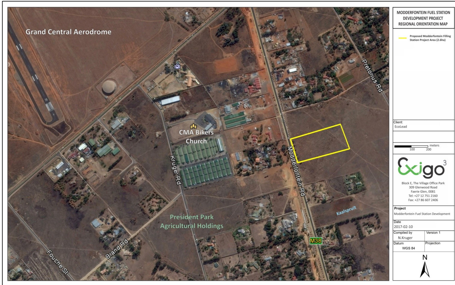
Figure 2-2: Aerial map providing a regional setting for the proposed Modderfontein Fuel Station Development location.