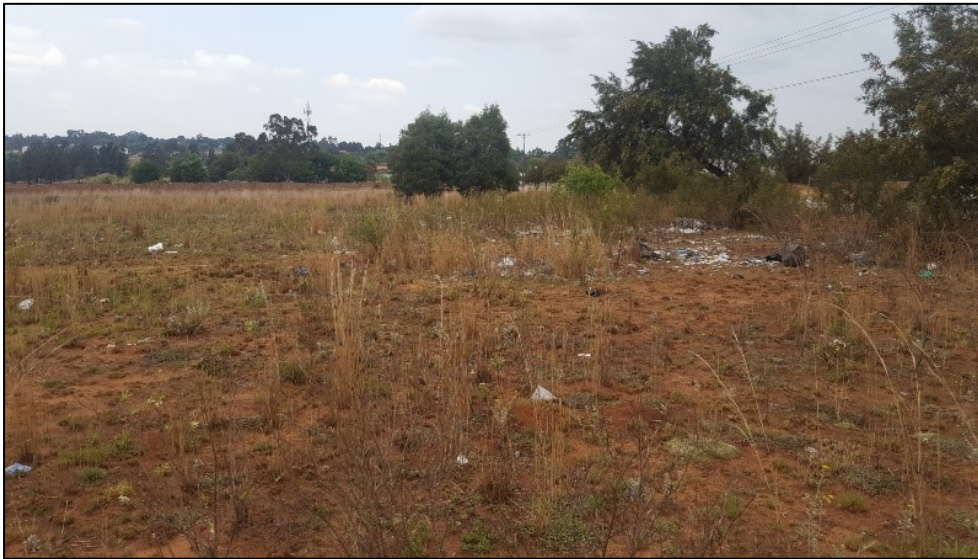
Figure 3-9: View of refuse dumps along the western periphery of the project area at Modderfontein Road.