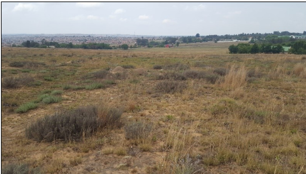
Figure 3-5: A clear change in vegetation (left and right) in a ventral portion of the project area – possibly a sign of water seepage.