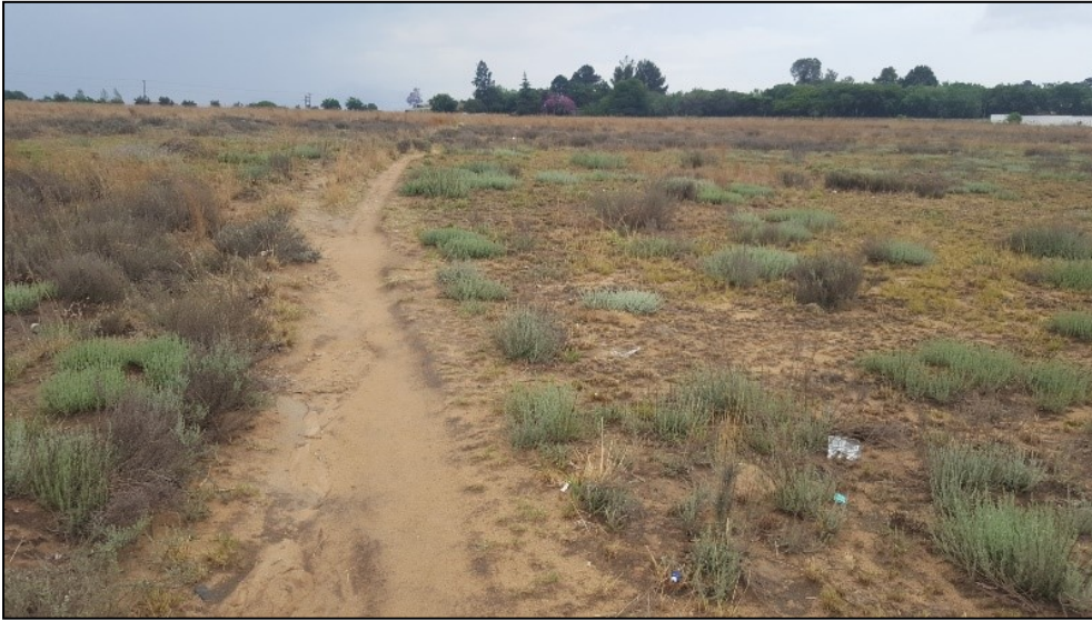
Figure 3-6: View of one of many footpaths traversing the project area.