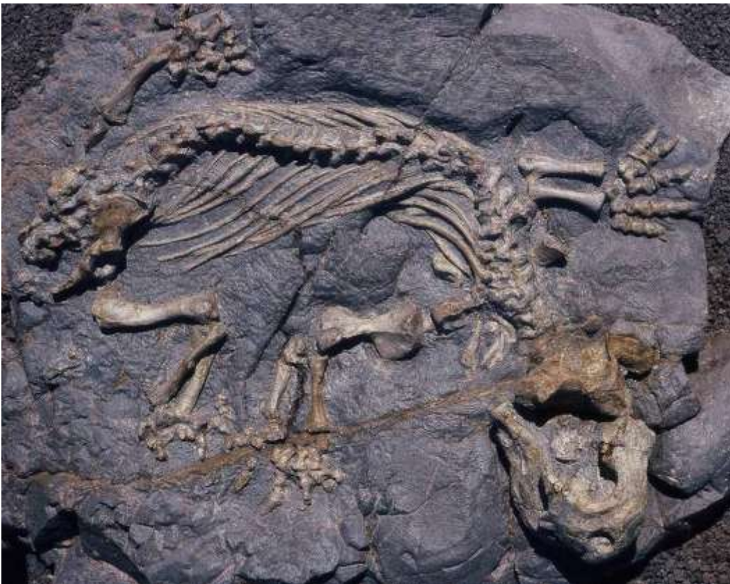
Figure 3: Fossil skeleton of Diictodon

The Cistecephalus Assemblage Zone is characterised by herbivorous synapsid fossils such as Diictodon which is the most common vertebrate fossil of this assemblage zone and which comprises approximately 50% of the vertebrate fossils of this zone (see Fig.3), Oudenodon which forms approximately 20% of the fossil yield from this zone, Cistecephalus which forms 10% of the fossil yield and from which the name of this biozone was derived (see Fig.4) and Aulacephalodon , and carnivorous synapsids such as gorgonopsians and therocephalians. Fish fossils ( Atherstonia ) and amphibian fossils ( Rhinesuchus ) have been found in this zone as well. Plant fossils from this zone include Glossopteris leaves (see Fig. 5) and fossilised wood (Rubidge, 1995).