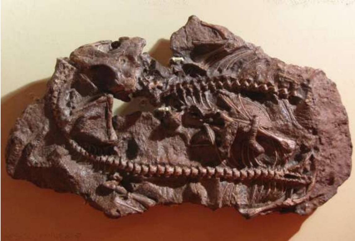
Figure 8: Fossilised skeletons of Owenetta

Fish fossils such as Atherstonia and Namaichthys and amphibian fossils such as Rhinesuchus and fossil reptiles (other than synapsids) such as Milleretta , Owenetta (see Fig.8) and Pareiasaurus are known from this zone. Plant fossils include Glossopteris leaves and fossilised wood (Rubidge, 1995).