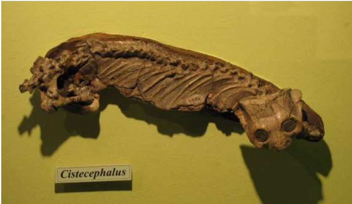
Figure 4: Fossil skeleton of Cistecephalus