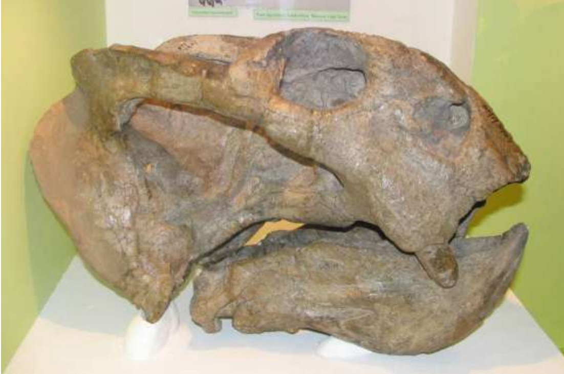
Figure 6: Fossil skull of Dicynodon

The Dicynodon Assemblage Zone is characterised by the presence of herbivorous synapsid fossils such as Dicynodon from which the name of this assemblage zone was derived (see Fig. 6) and Oudenodon . Carnivorous synapsid fossils include gorgonopsians (see Fig.7), therocephalians and cynodonts.