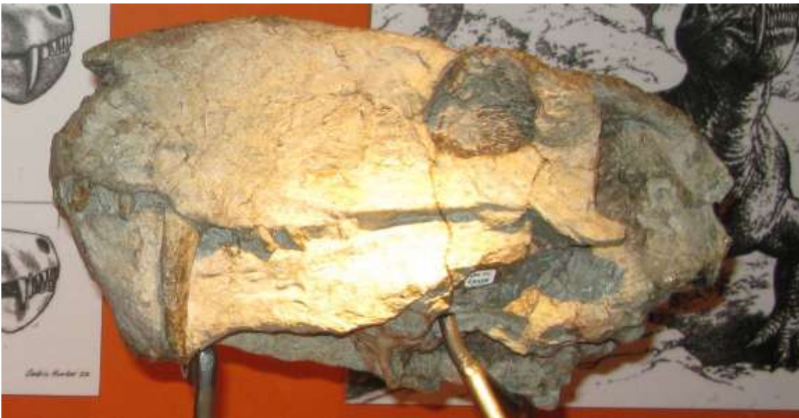
Figure 7: Fossil skull of a gorgonopsian