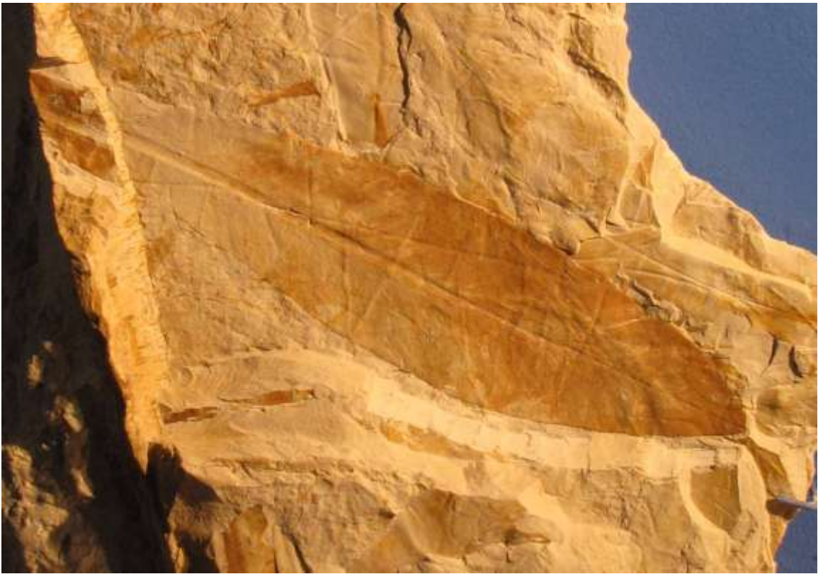
Figure 5: Glossopteris leaf imprint