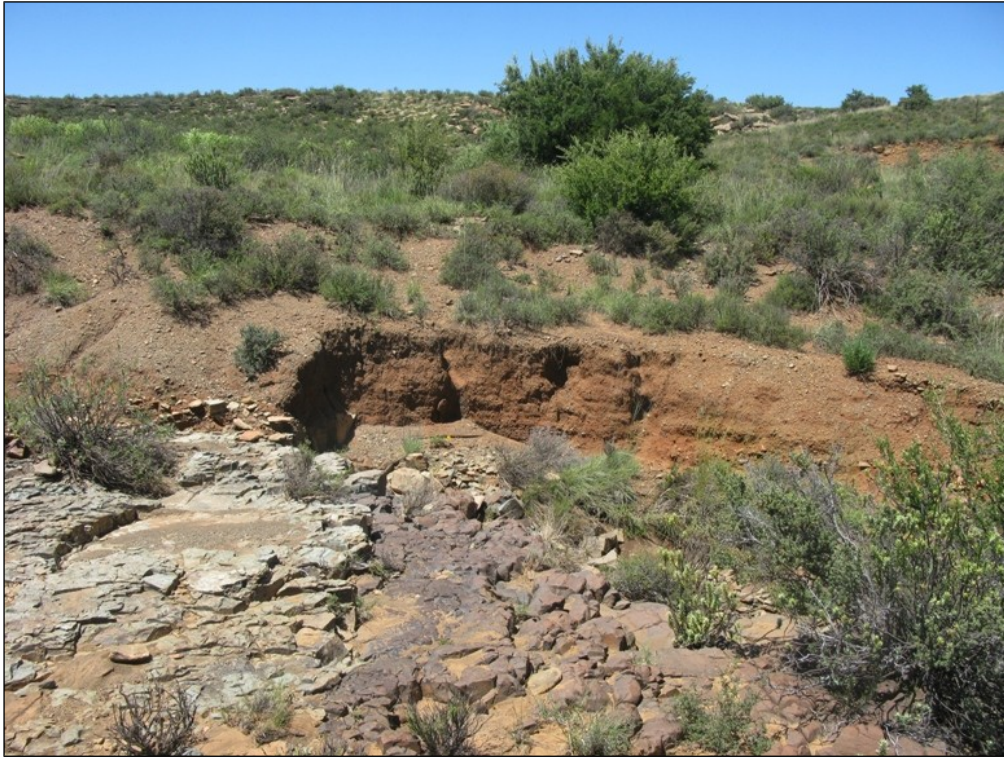
Fig. 6. Contact between a dolerite intrusion (rusty brown) and adjacent baked Beaufort Group sediments (grey-green) in the south-western portion of the original study area, west of the DR2404. The bedrocks are mantled with well-bedded, fine gravelly alluvium here.