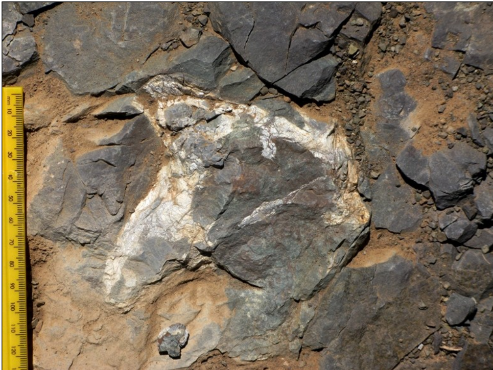
Fig. 15. Unidentified fossil bone exposed on the floor of the original borrow pit site DR02404/8.5/0LR.