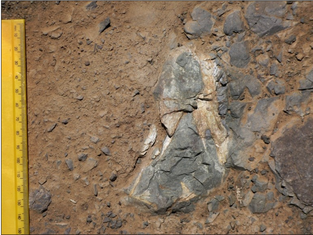
Fig. 14. Lower jaw (mandible) of a medium-sized dicynodont therapsid exposed on the floor of the original borrow pit site DR02404/8.5/0LR.