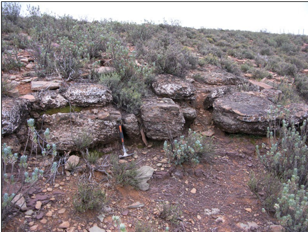
Fig. 8. Well-developed calccrete conglomerates towards the base of the channel sandstone package (Hammer = 30 cm). Some of these conglomerates contain rolled fossil bone (Figs. 19, 20).