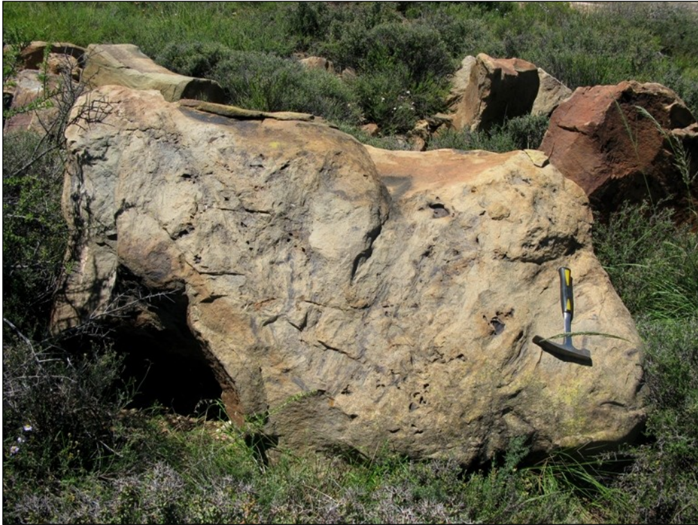
Fig. 18. Large displaced slab of channel sandstone on the western side of the DR2404 showing current-orientated plant material associated with mudflakes and reworked bone fragments on the sole surface (Hammer = 32 cm).