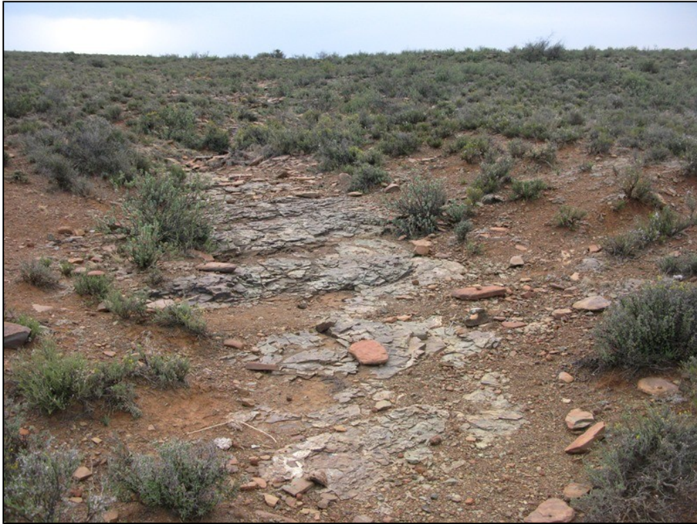
Fig. 11. Streambed exposure of baked Beaufort Group bedrocks just south of the revised study area. Note the thickness of the overlying gravelly colluvial deposits here.