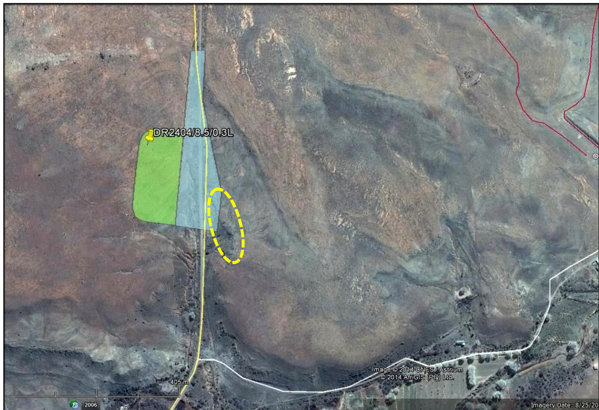
Fig. 2. Google earth© satellite image of the revised DR2404/8.5/0.3L borrow pit study area (green area) which lies to just to the west of the original site proposed within the DR2404 road reserve (blue area), Farm Dreifontein 26 near Murraysburg. Several fossil vertebrates are exposed within the yellow ellipse.