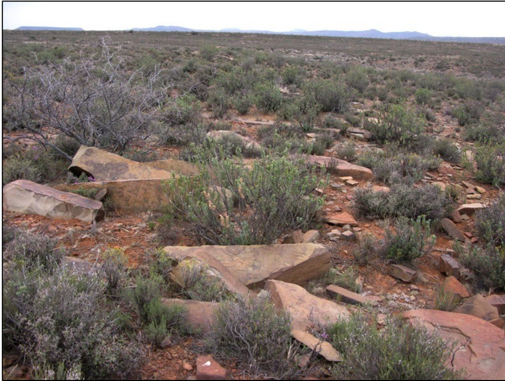
Fig. 7. Flaggy, well-jointed channel sandstones of the Balfour Formation, revised DR02404/8.5/0.3L borrow pit study area.