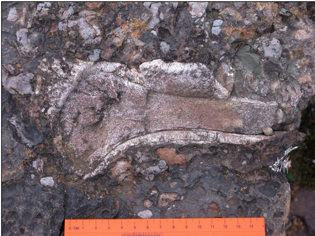
Fig. 20. Close-up of sizeable fragment of reworked, weathered bone arrowed in the previous figure (Scale in cm). The ferruginised conglomeratic matrix consists largely of grey calcrete glaebules.