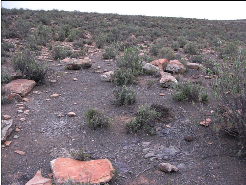
Fig. 9. Limited exposure of hackly-weathering grey overbank mudrocks with horizons of greyish pedocrete nodules, revised borrow pit study area.