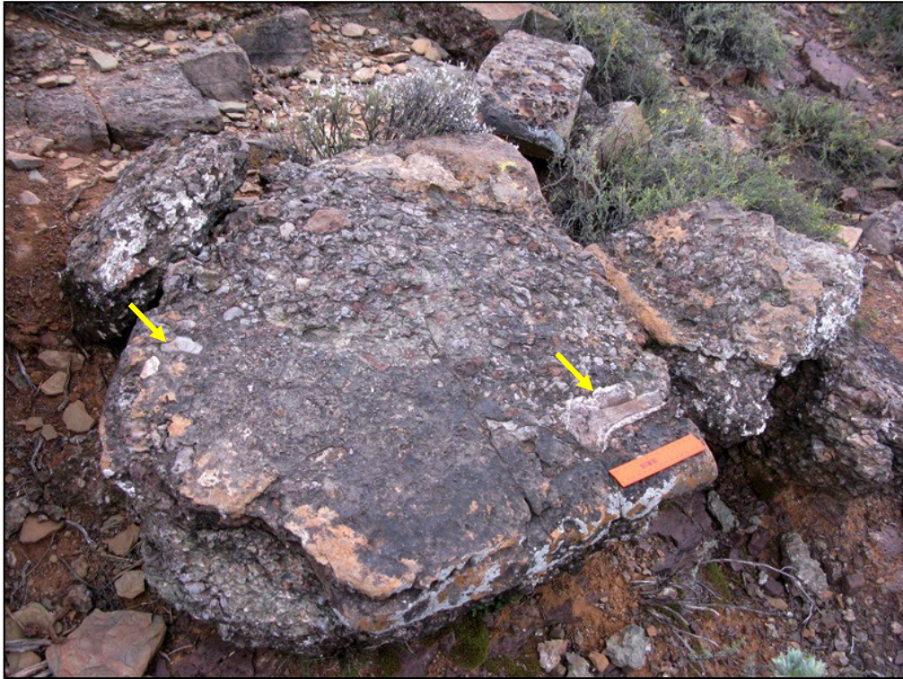
Fig. 19. Portion of the lenticular channel conglomerate seen in Figure 8 showing two reworked bone fragments (arrowed) (Scale = c. 15 cm).