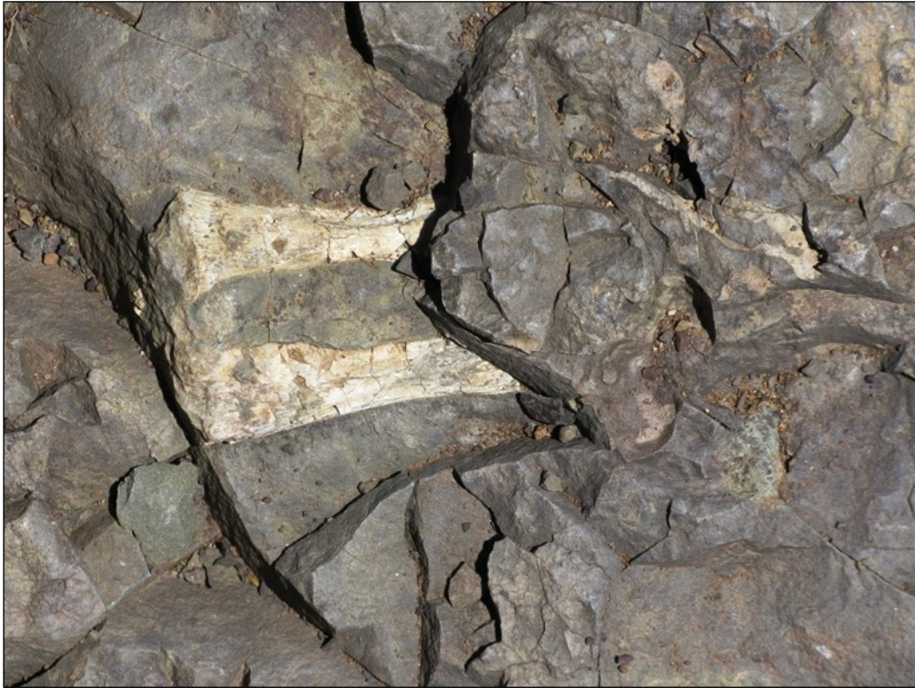
Fig. 16. Articulated lower limb bones of a medium-sized therapsid exposed on the floor of the original borrow pit site DR02404/8.5/0LR.