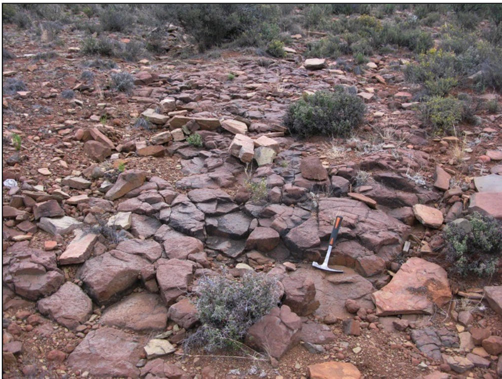
Fig. 10. Columnar-jointed dolerite intrusion exposed in stream bed near the southern edge of the revised study area (Hammer = 30 cm).