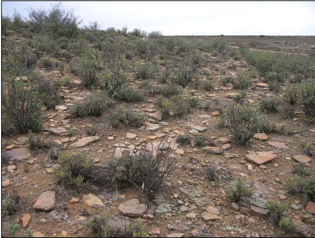
Fig. 13. Poorly-sorted colluvial deposits and downwasted surface gravels, dominated by slabby Beaufort Group sandstones, that mantle the Permian bedrocks over much of the revised study area.