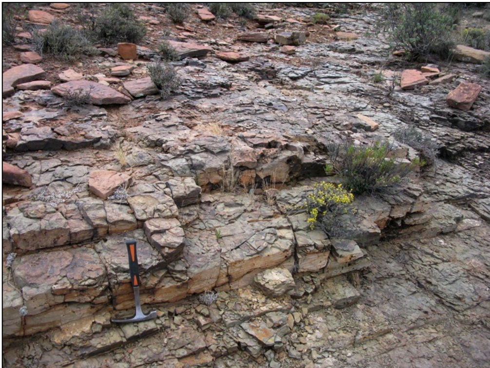
Fig. 12. Detail of baked hornfels exposed in the stream bed shown in the previous figure (Hammer = 30 cm).