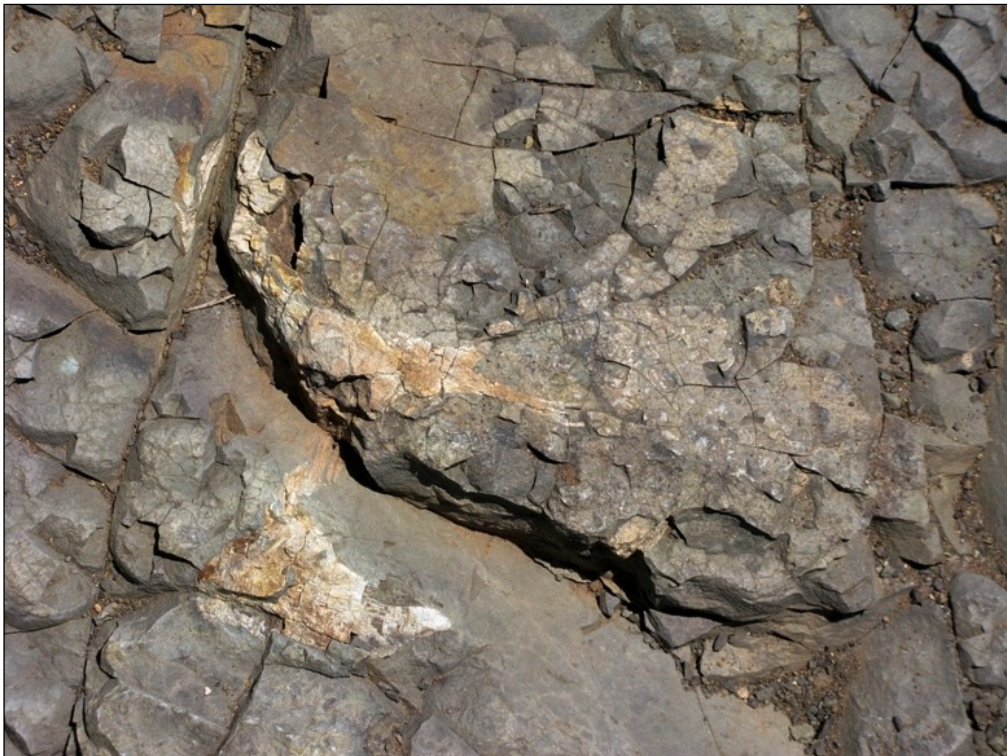
Fig. 17. Palatal (ventral) view of the skull of a medium-sized dicynodont, possibly Aulacephalodon , exposed on the floor of the original borrow pit site DR02404/8.5/0LR.