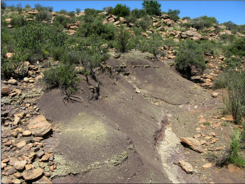
Fig. 4. Purplish-brown mudrocks and overlying channel sandstones (on the horizon) exposed on the south-eastern side of the original borrow pit site DR02404/8.5/0LR.