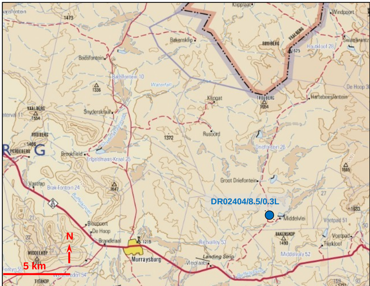
Fig. 1. Extract from topographical sheet 3122 Victoria West showing the location of the revised borrow pit DR02404/8.5/0.3L near Middelvlei to the northeast of Murraysburg, Central Karoo District Municipality, Western Cape (blue dot).