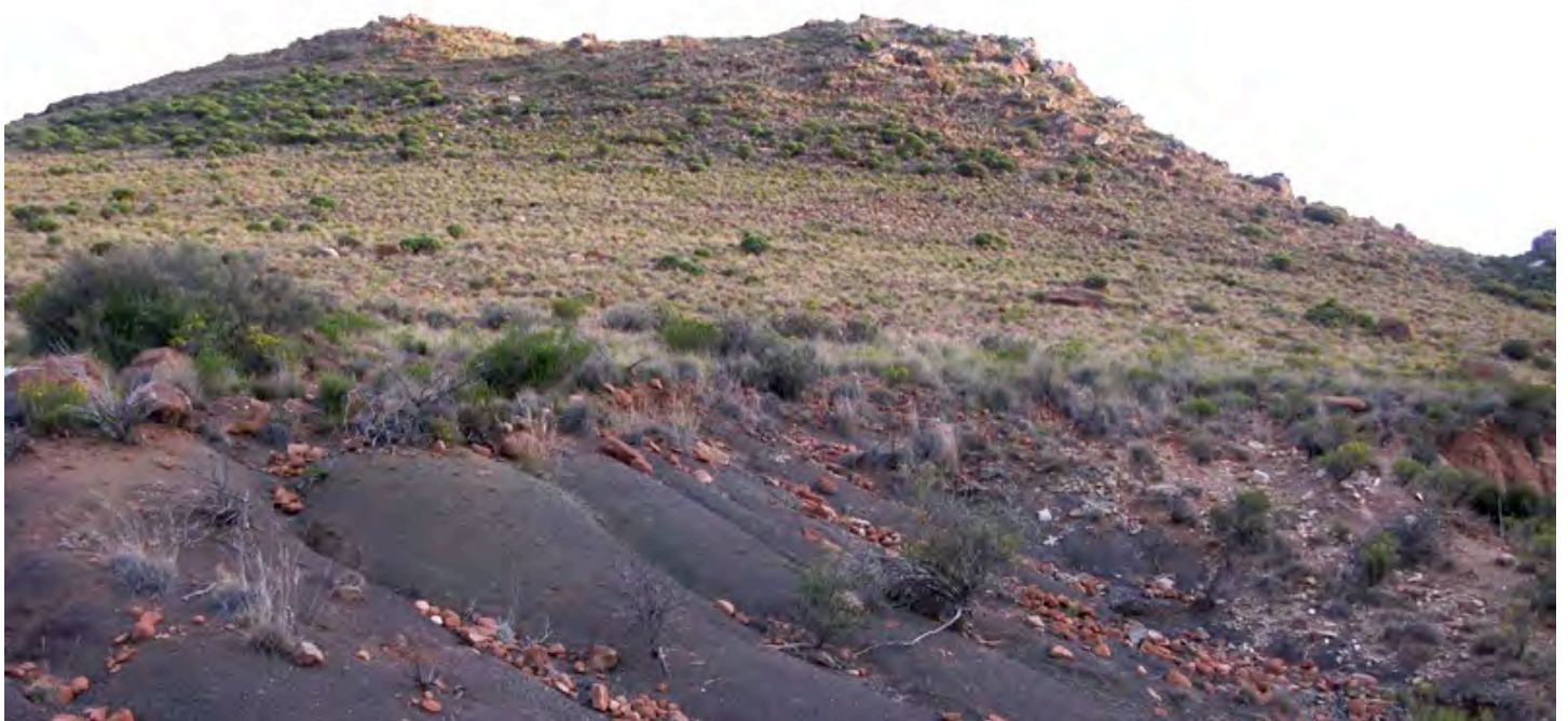
Figure 2: View south-westwards across the DR02403/44.5/0.02R study area (Almond 2015: 4)