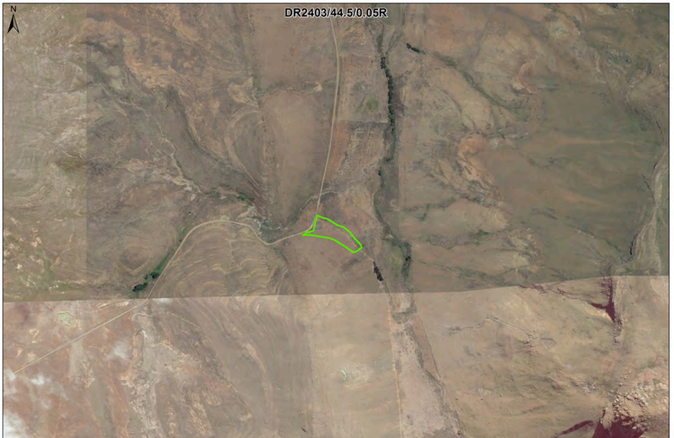
Figure 3: Site context and borrow pit location