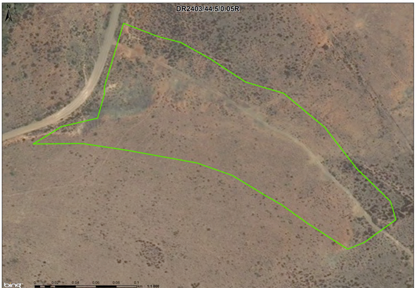
Figure 4: Aerial view of borrow pit and preliminary pit area