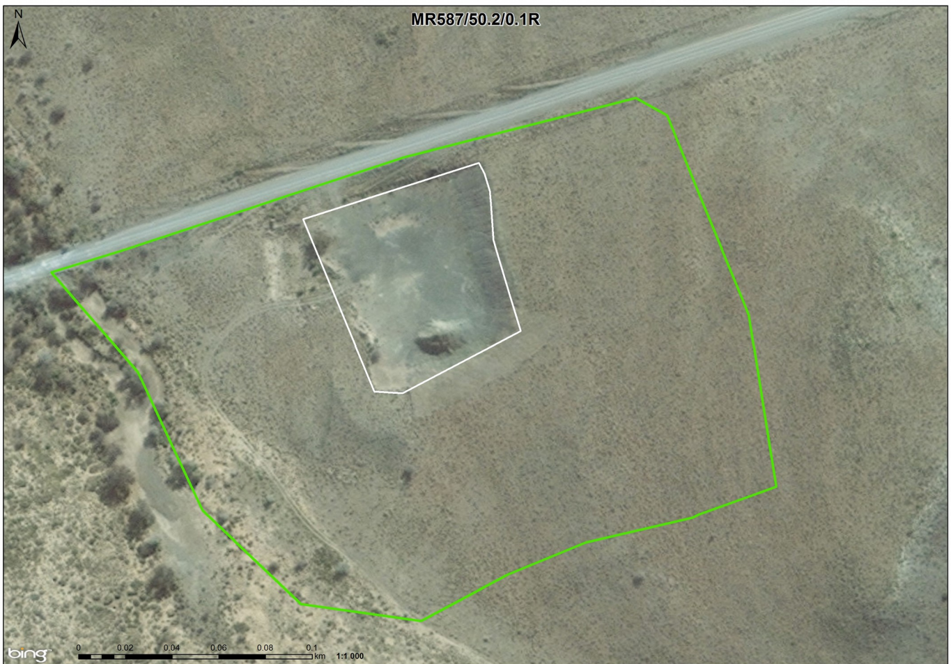
Figure 4: Aerial view of borrow pit and preliminary pit area (Google earth, April 2015)