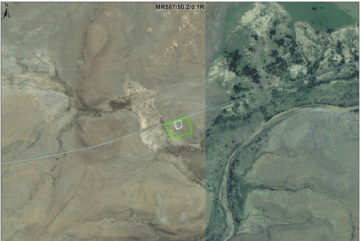
Figure 3: Site context and borrow pit location (Google earth, April 2015)