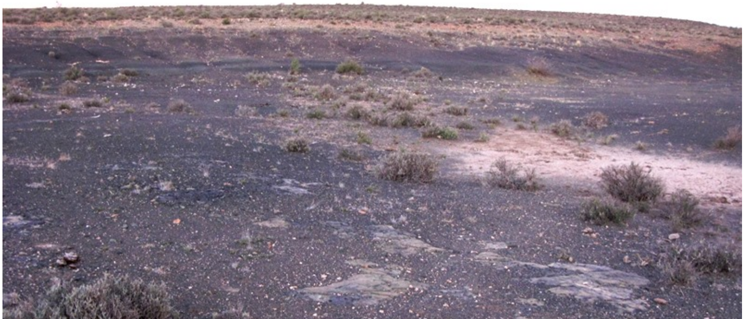
Figure 2: view towards the southeast across the MR00587/50.2/0.1R (Almond 2015: 4)