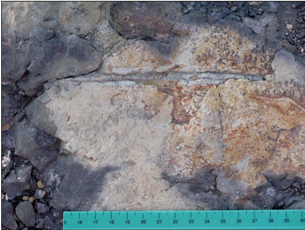
Fig. 7. Possible invertebrate horizontal burrow preserved within overbank siltstones on the borrow pit floor (Scale in cm).