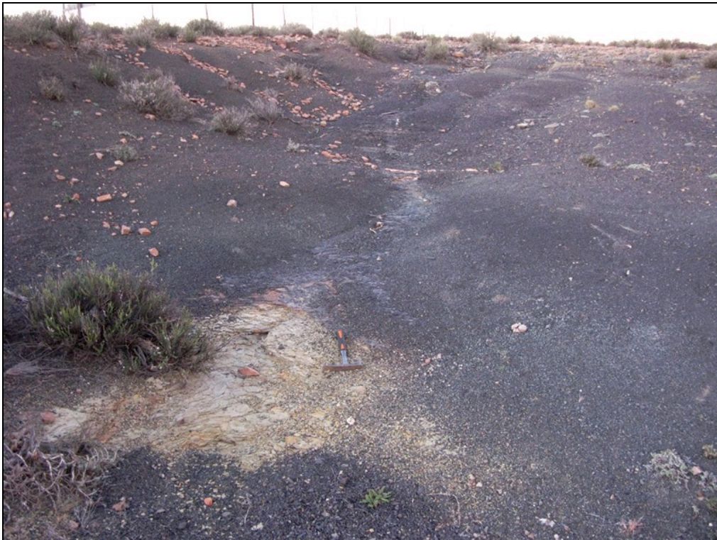
Fig. 4. Hackly-weathering, purple-brown mudrocks with pale yellowish secondarily mineralised patches and thin mantle of alluvial gravels (Hammer = 30 cm).