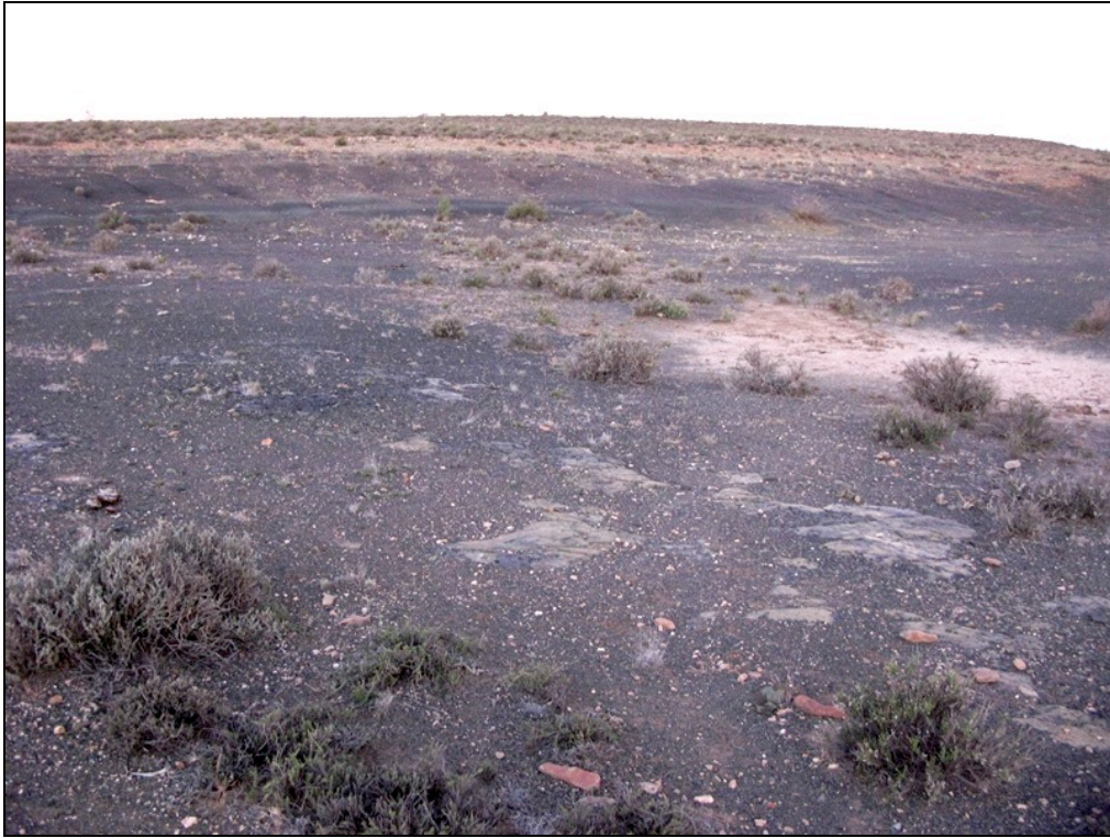
Fig. 3. General view towards the southeast across the MR00587/50,2/0,1R borrow pit showing extensive exposure of Teekloof Formation mudrocks capped by alluvial gravels in the background.