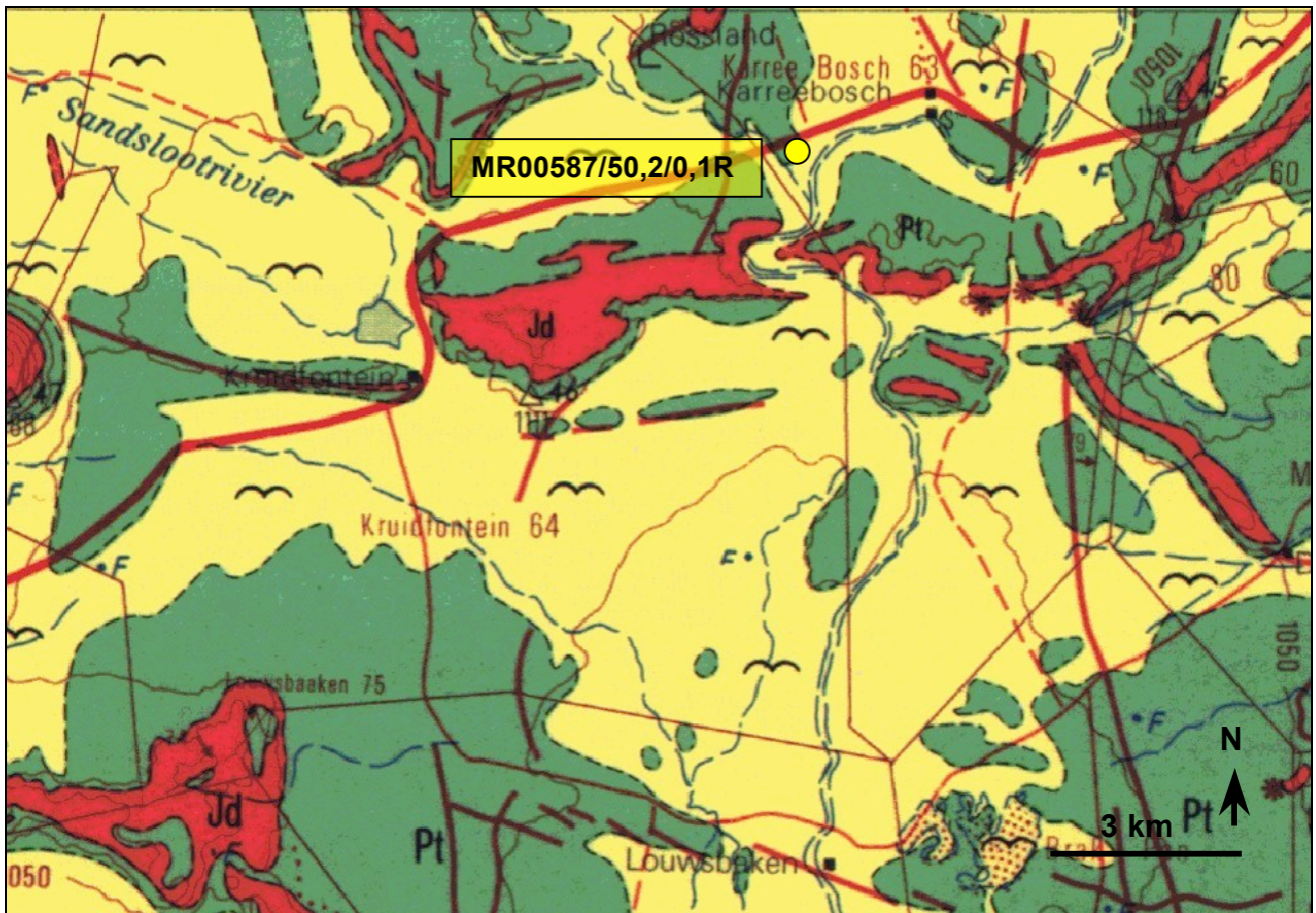
Fig. 2. Extract from 1: 250 000 geology sheet 3222 Beaufort West (Council for Geoscience, Pretoria) showing the location of the MR00587/50,2/0,1R borrow pit c. 35 km to the ENE of Nelspoort, Central Karoo District Municipality, Western Cape (yellow dot). The pit site is excavated into mudrocks within the lower part of the Teekloof Formation (Adelaide Subgroup, Lower Beaufort Group) (Pt, green) that are mantled here by Late Caenozoic alluvium and colluvium alluvium (pale yellow with flying bird symbol). The Beaufort Group rocks in this area are extensively intruded and baked by Early Jurassic dolerites of the Karoo Dolerite Suite (Jd, red), such as the west-east trending dolerite intrusion just to the south of the borrow pit site.

Extensive exposures of purple-brown or grey-blue overbank mudrocks of the Teekloof Formation with thin, well-jointed crevasse-splay sandstones are exposed on the floor and sloping walls of the existing MR00587/50,2/0,1R borrow pit (Figs. 3 & 4). The mudrocks are variously well-indurated, prominently colour-mottled siltstones and hackly-weathering, massive claystones (Fig. 5). No pedogenic palaeocalcrete nodules were observed here. Yellowish-stained zones within the mudrocks as well as ferruginisation of the sandstones may reflect secondary mineralisation due to dolerite intrusion in the region (Fig. 4). Thin, pale crevasse-splay sandstones on the pit margin are mantled with poorly-sorted downwasted gravels of pale brownish quartzite / sandstone and dolerite (Fig. 6). Soils in the area are locally calcretised and veins of creamy Quaternary to Recent calcrete extend down into the Lower Beaufort Group bedrocks.