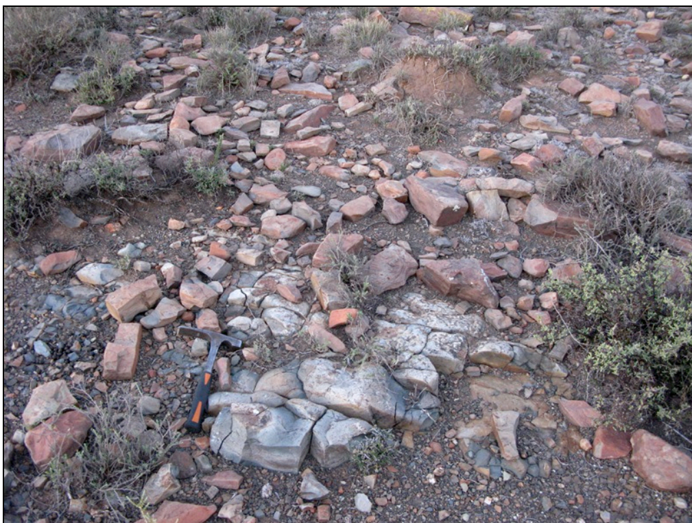
Fig. 6. Well-jointed crevasse-splay sandstone on the pit margin mantled by downwasted angular surface gravels (Hammer = 30 cm).