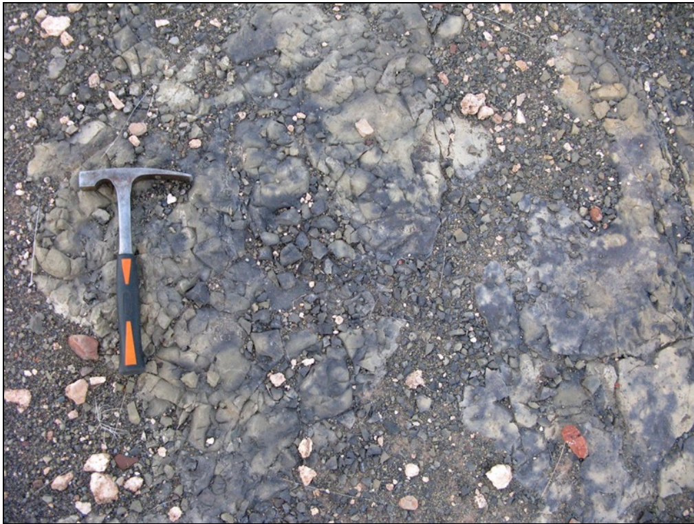
Fig. 5. Mottled overbank siltstones exposed on the borrow pit floor (Hammer = 30 cm).