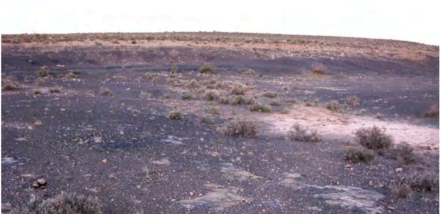
Figure 2: view towards the southeast across the MR00587/50.2/0.1R (Almond 2015: 4)