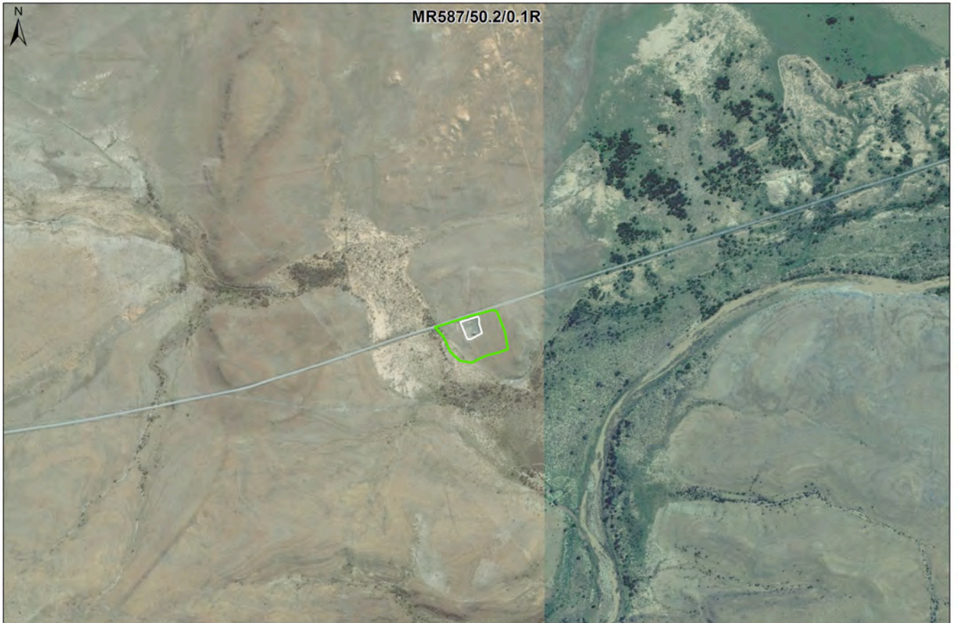
Figure 3: Site context and borrow pit location (Google earth, April 2015)