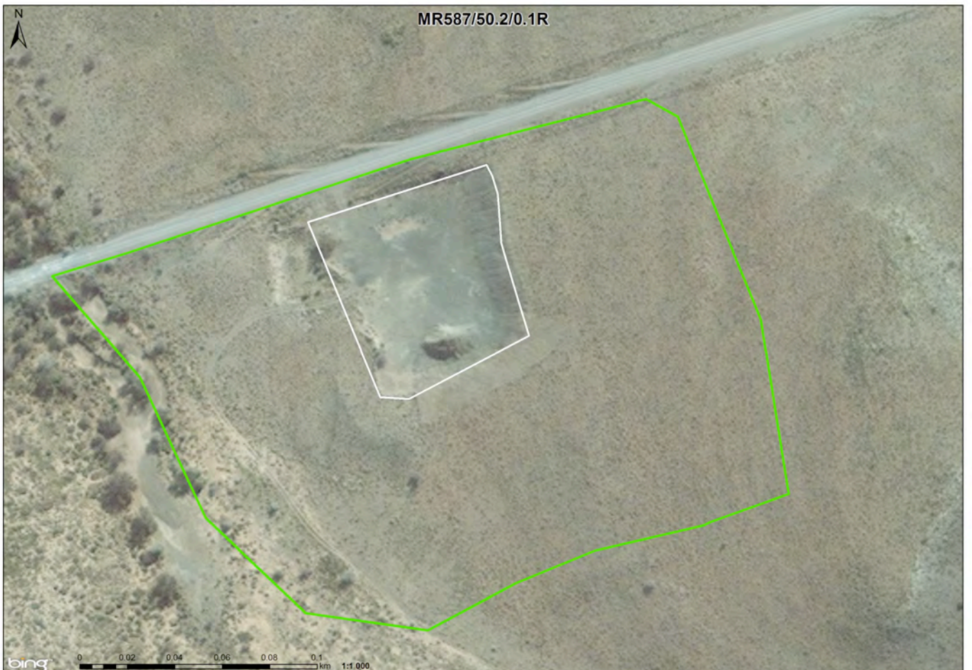
Figure 4: Aerial view of borrow pit and preliminary pit area (April 2015)