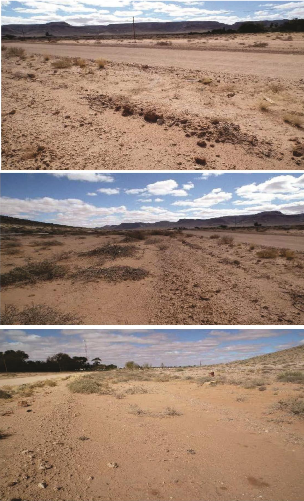
Figure 2. Proposed pipeline footprint between reservoir and Aggeneys.