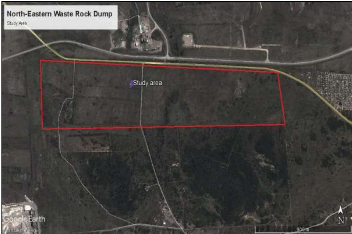
Fig.9: The study area in 2013. Some mining related activities & the development of settlements close to the Mine and the study area is visible.