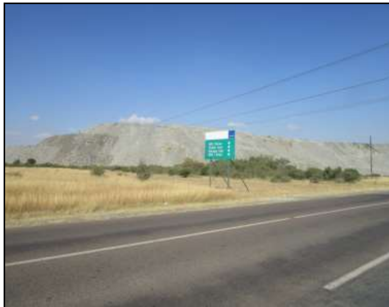
Fig.12: A view of the old Waste Rock Dump.