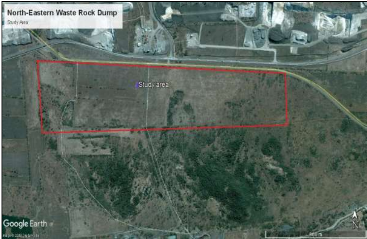
Fig.7: The study area in 2004 (Google Earth 2018).