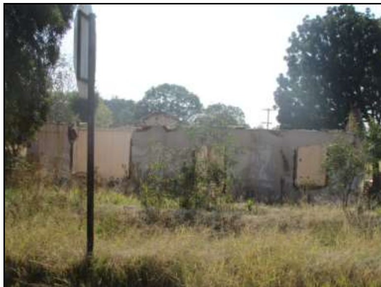
Fig.18: More structures in the area.