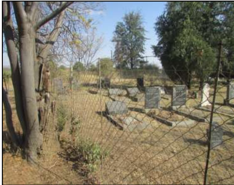
Fig.22: View of Site 1 cemetery.

exhumation and relocation exists. This needs to be done through proper and detailed Social Consultation to get consent for the work to be undertaken.