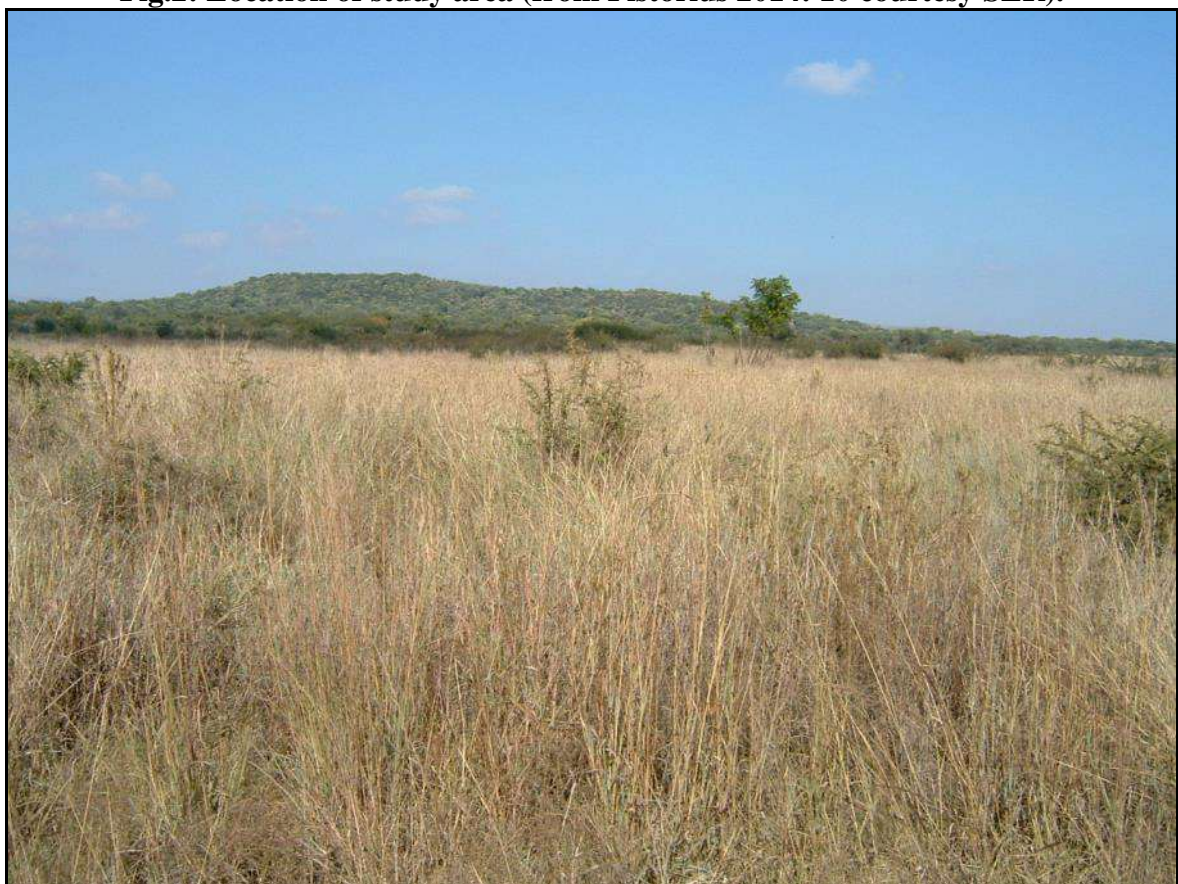
Fig.3: A view of a section of the study area in 2014.