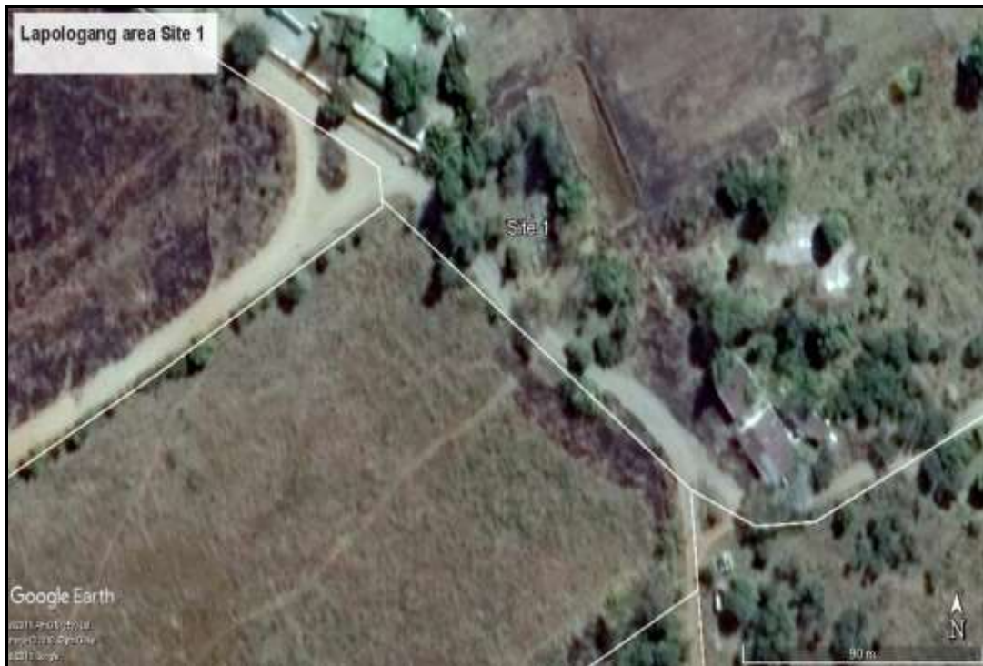
Fig.27: Closer view of Site 1 cemetery location (Google Earth 2018).