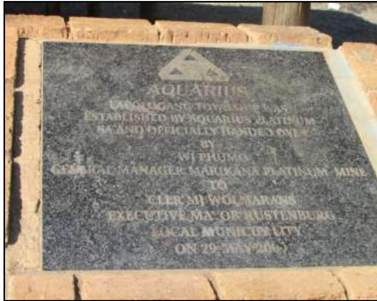
Fig.21: The granite plaque in the Village.