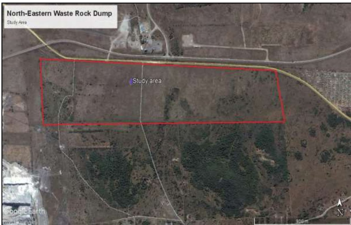
Fig.10: The study area in 2014 as it looked like during the Phase 1 HIA (Google Earth 2018).