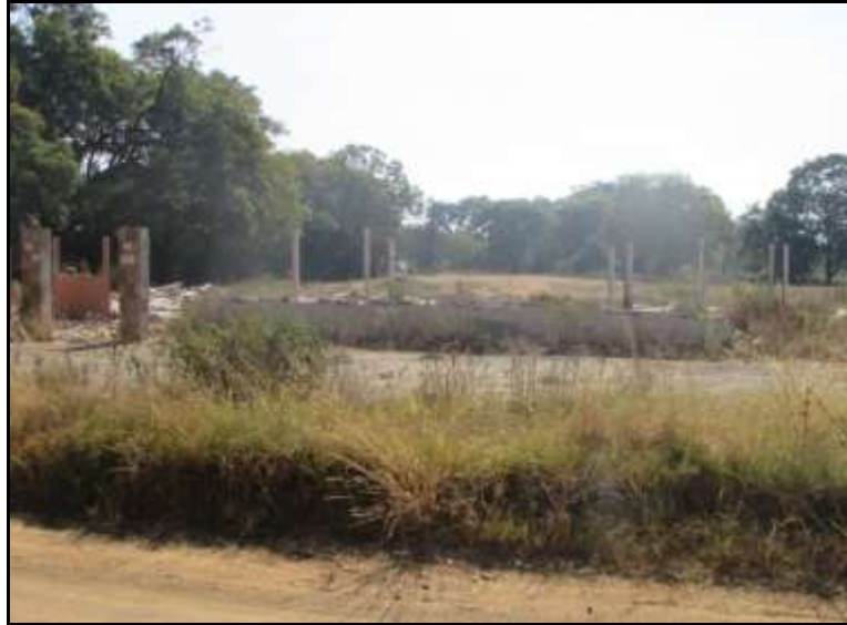
Fig.19: The foundations of another recent structure.