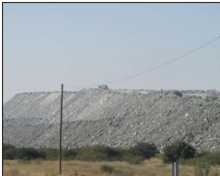
Fig.16: Another view of the Waste Rock Dump with ongoing mining-related activities clearly visible.