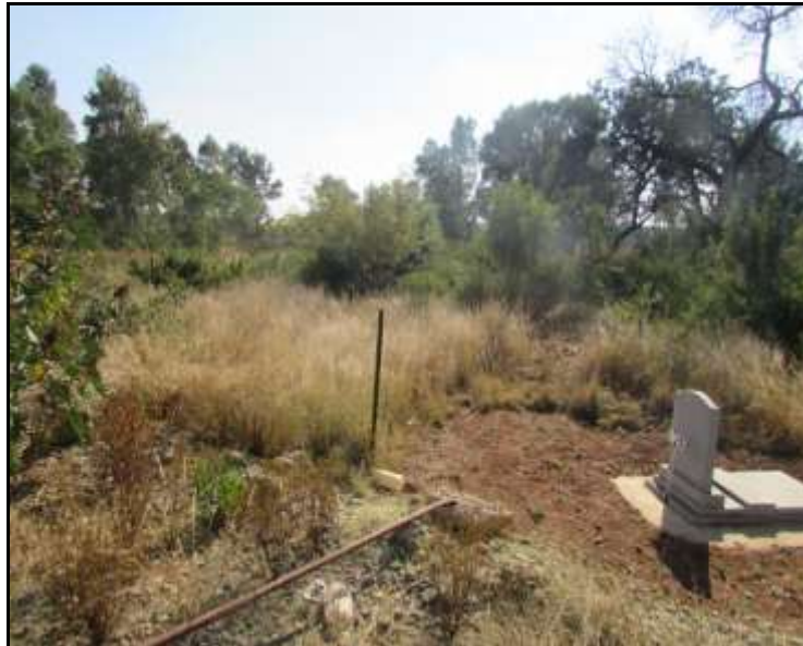
Fig.24: View of Site 2 cemetery.