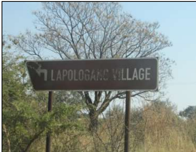
Fig.20: The Lapologang Village entrance sign.