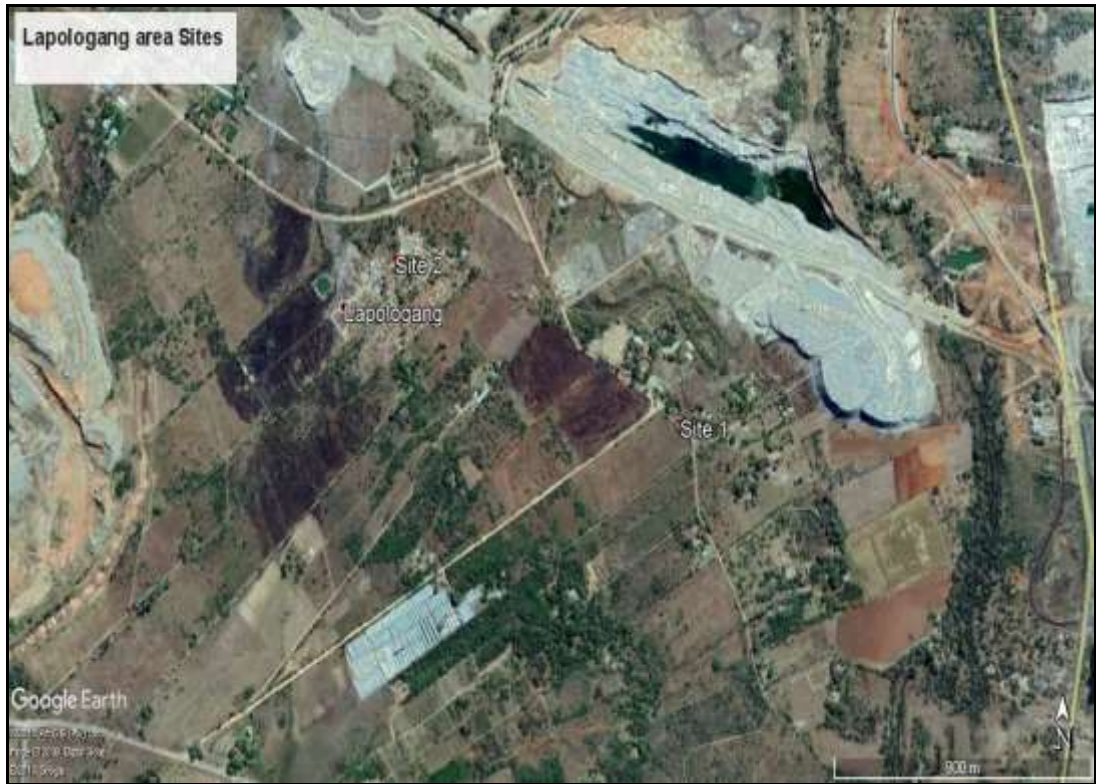
Fig.26: General location of Site 1 & 2 cemeteries (Google Earth 2018).