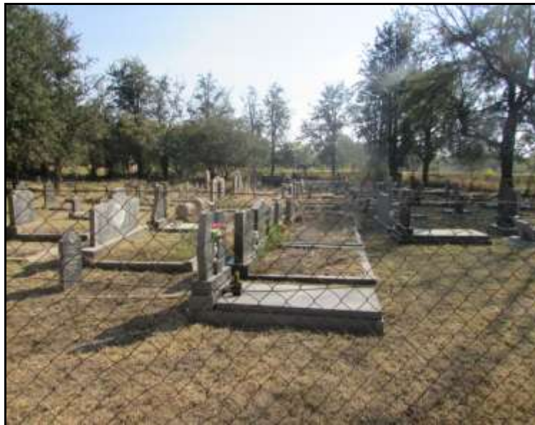
Fig.23: Closer view of Site 1 cemetery.