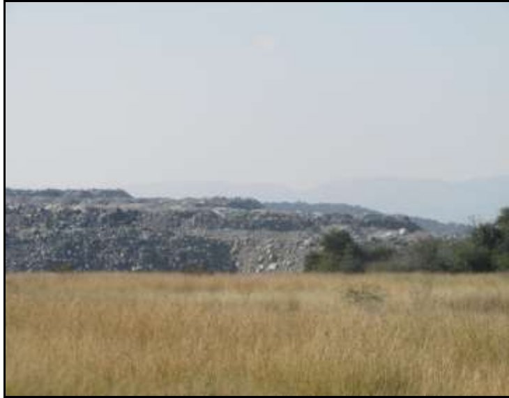
Fig.13: A section of the North-Eastern Waste Rock Dump.