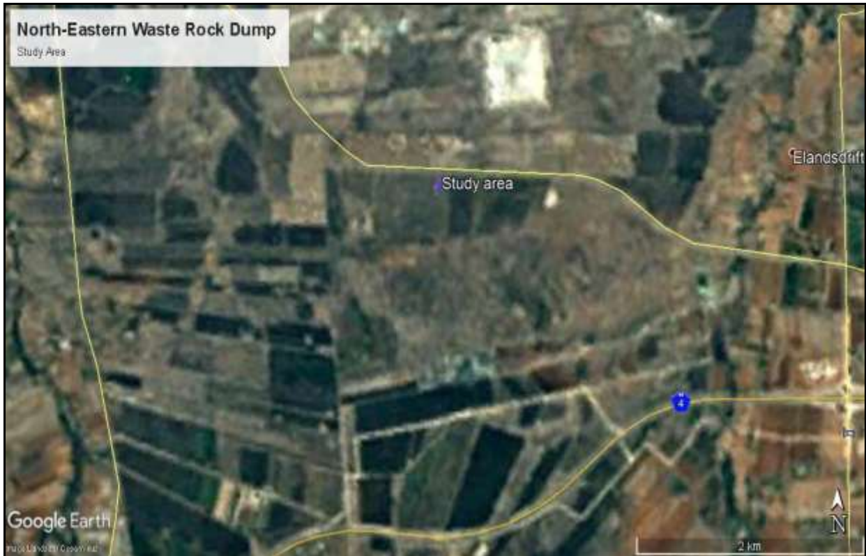
Fig.6: The study area in approximately 1984. Note the overwhelming agricultural nature (Google Earth 2018).

It was recommended that the Phase 2 fieldwork will concentrate on sections of the study area (the North-Eastern Waste Rock Dump area) that has not been disturbed, while other already disturbed sections will be visited to screen for the possibility of the exposure and disturbance of previously unknown cultural heritage resources such as unmarked burials and grave sites, stone-walled Iron Age remains and historical features and cultural material. However, the visit to the study area in June 2018 made it clear that such an assessment will not be required, as the whole area has been completely transformed and that the only open, vegetated sections are located along the boundaries of the North-Eastern Waste Rock Dump.