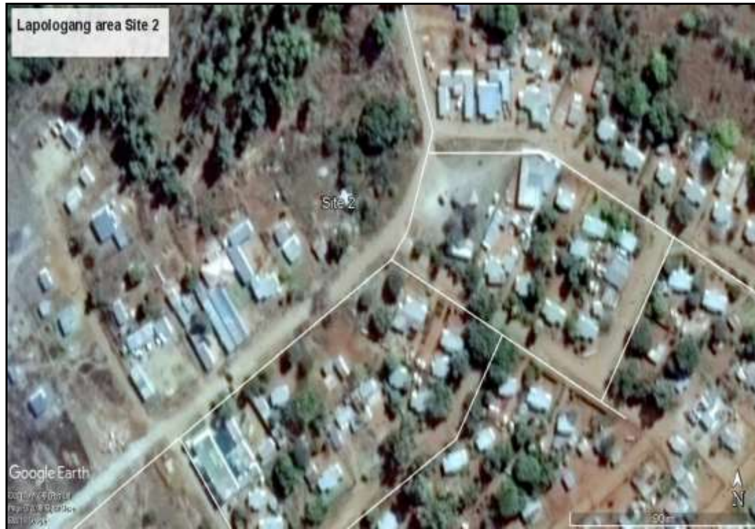
Fig.28: Closer view of Site 2 cemetery.