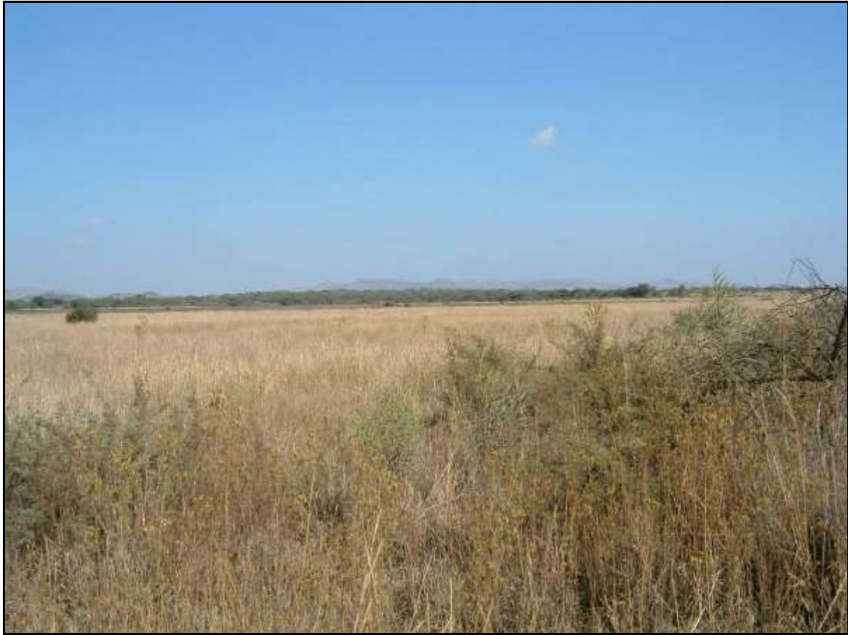
Fig.4: Another view of the area in 2014.