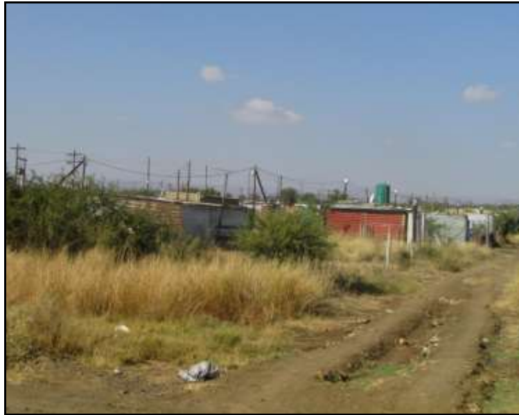
Fig.15: A view of a section of the settlement located to the east of the Waste Rock Dump.