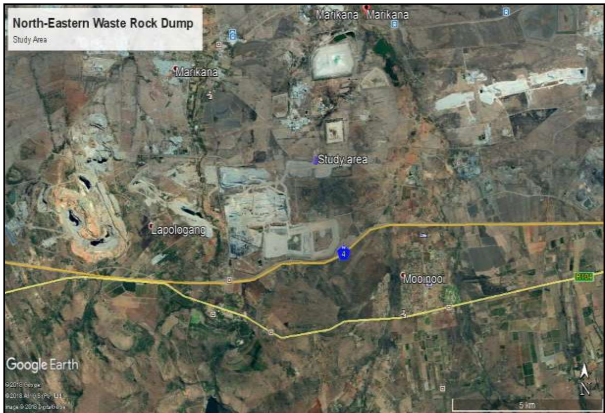
Fig.1: General location of study area (Google Earth 2018).

Lapologang Village is located slightly south-west of the Marikana Mining area.