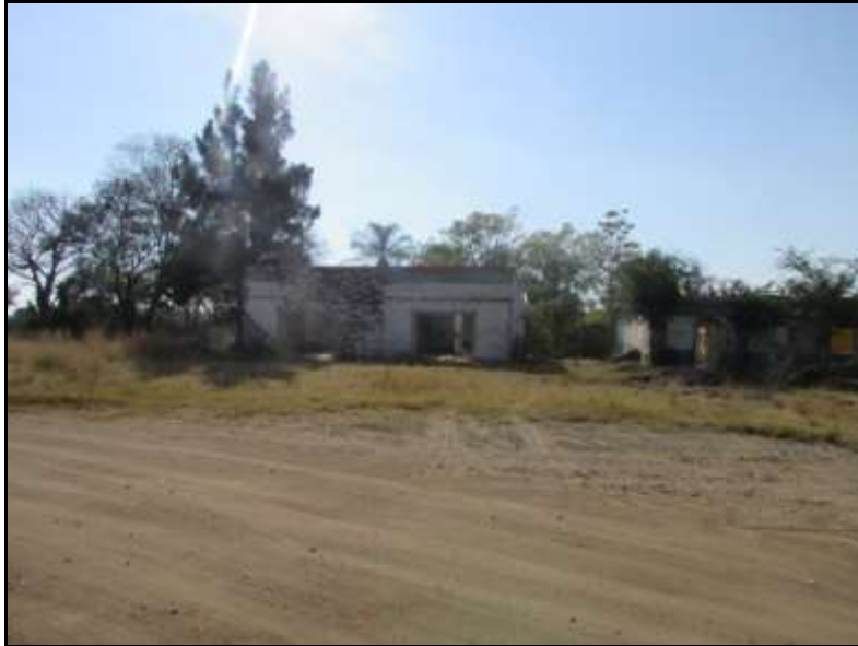
Fig.17: The remains of some recent structures in the area.

A number of sites and structures were identified during this assessment, with only 2 (cemeteries) of any significance recorded. The others were the remains/ruins of fairly recent buildings and not deemed of any significance.