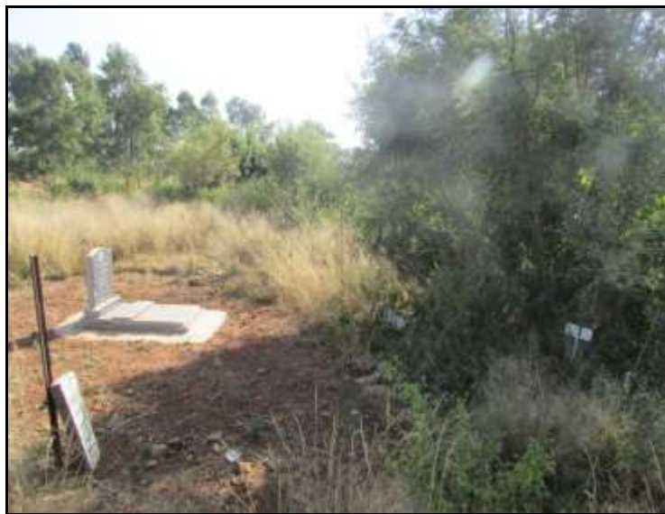
Fig.25: Another view of Site 2 cemetery.