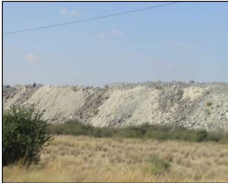
Fig.14: Another section. The vegetated area is on the boundary of the dump and not part of Tharisa property.