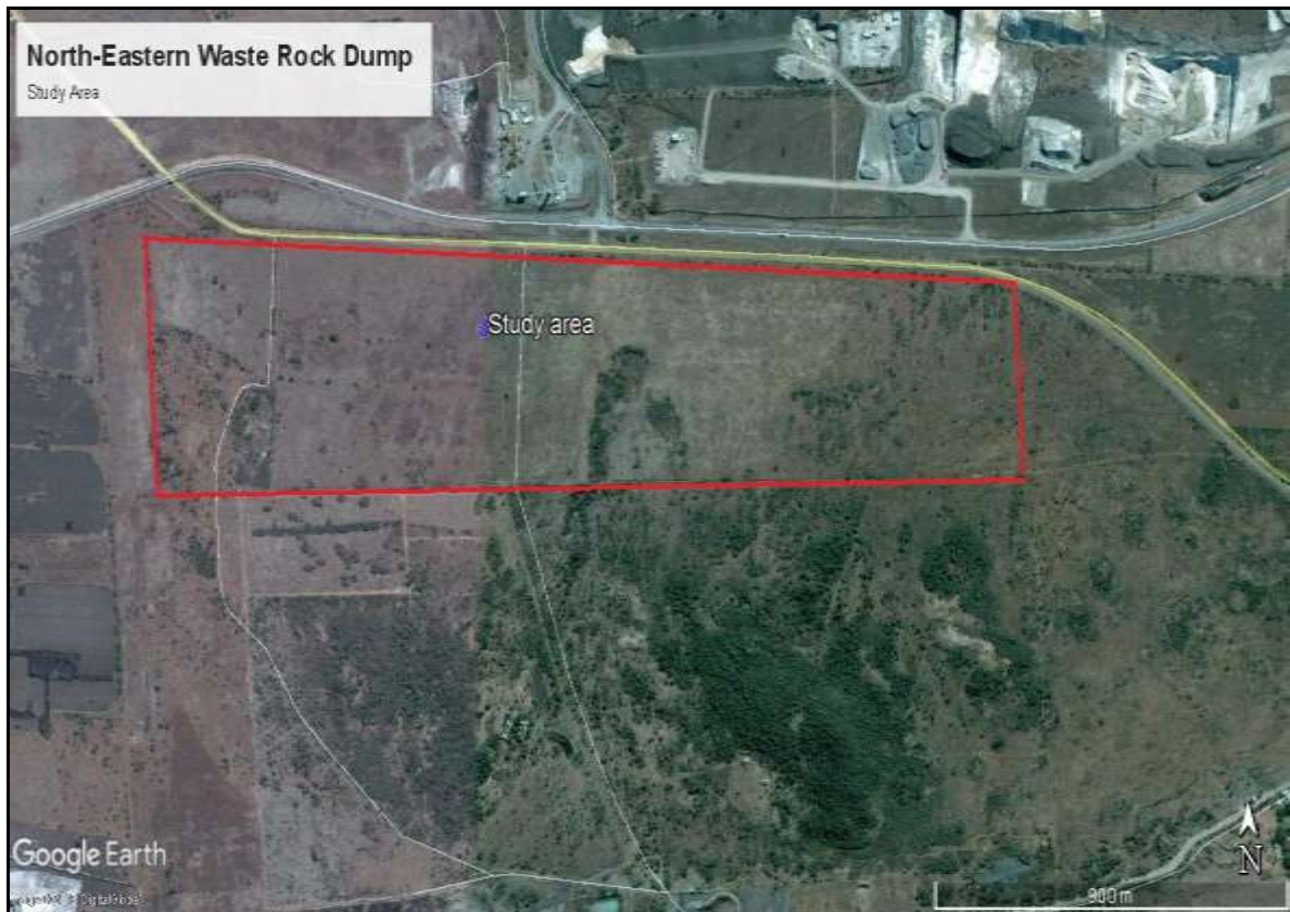
Fig.8: The study area in 2009. Very little had changed between 2004 and 2009 (Google Earth 2018).