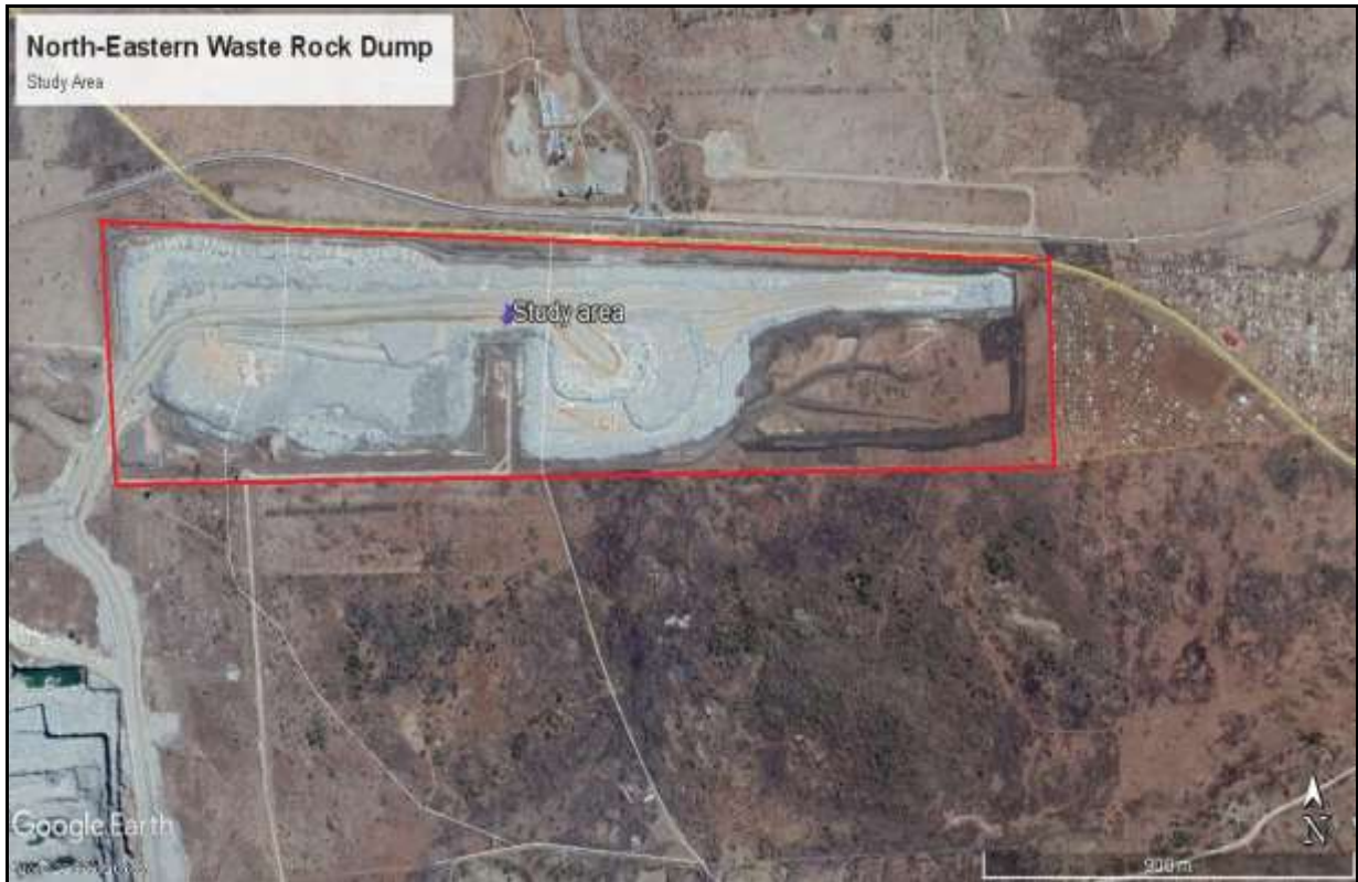
Fig.11: The study area early 2018. It has been nearly completely transformed & very little of the area's original vegetation & natural environment exists (Google Earth 2018).