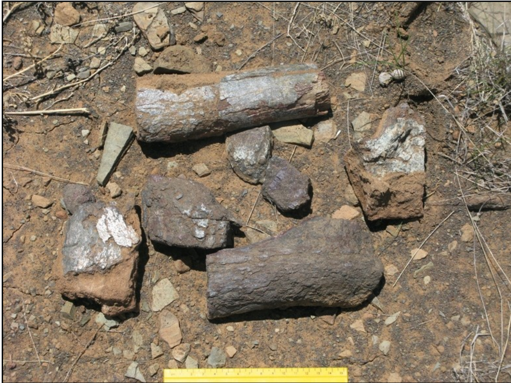
Fig. 5. Close-up of collection of fragmentary fossil bones made at the locality illustrated above. Note poor preservation suggests that these specimens have been exposed for a considerable length of time and also reworked by sheetwash or stream processes.