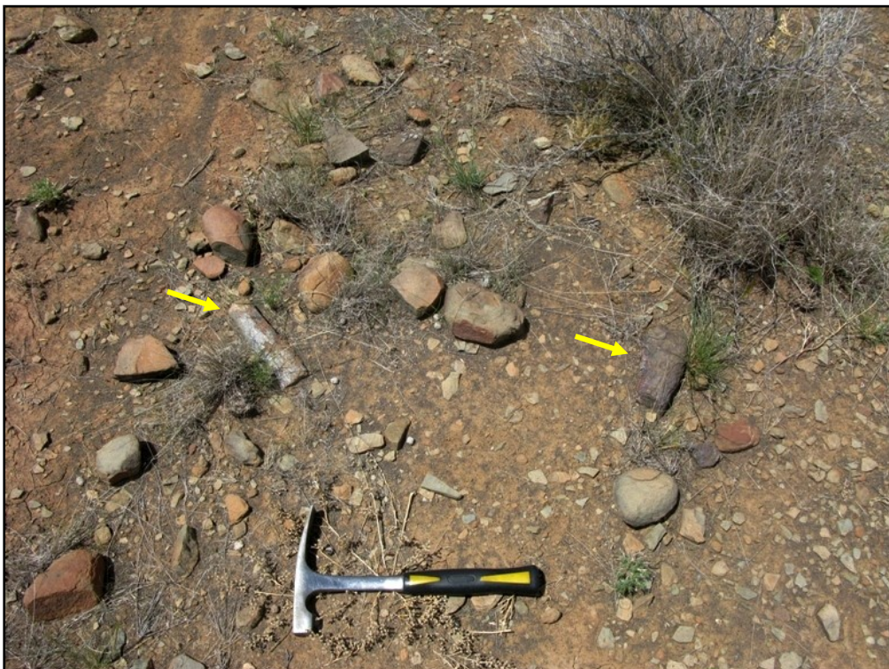
Fig. 4. Detail of poorly-sorted, coarse colluvial gravels seen in previous photo with two reworked fossil limb bone fragments arrowed (Hammer = 32 cm).