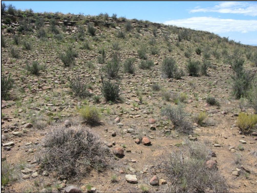
Fig. 3. View north-westwards towards the sandstone ridge bordering the pit study area. Scattered, reworked fossil bones occur among the coarse surface gravels in this region.