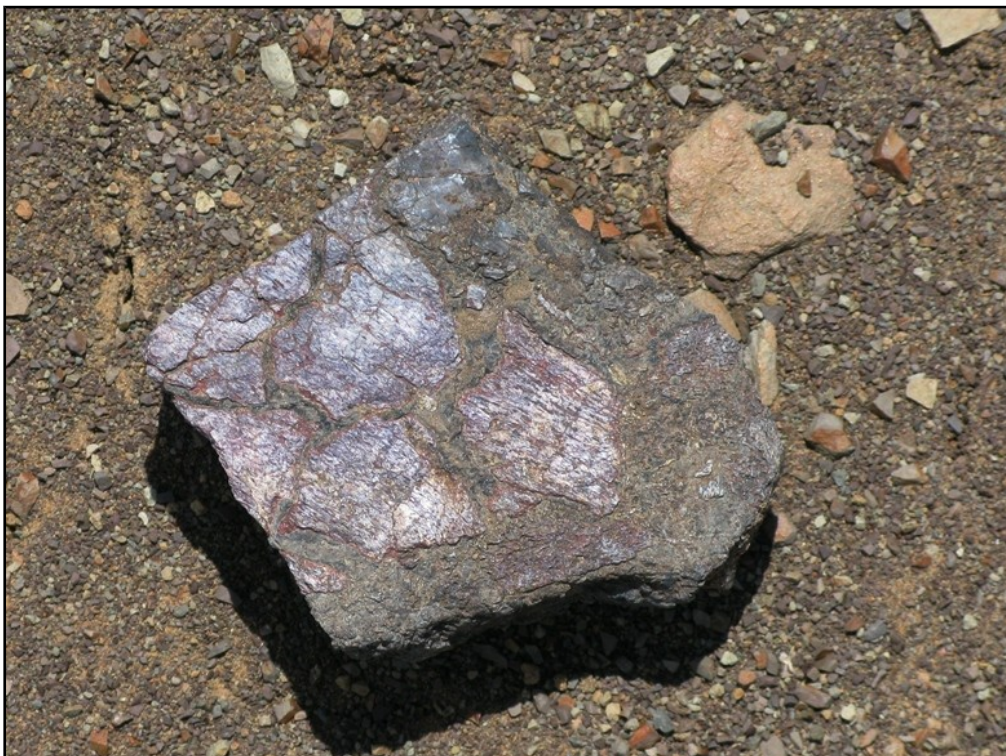
Fig. 6. Close-up of large fossil bone fragment (8 cm long) showing distinctive lilac hue and extensive surface cracking. The latter probably reflects protracted exposure of the bone on a semi-arid flood plain before original burial in Middle Permian times, as well as recent weathering.