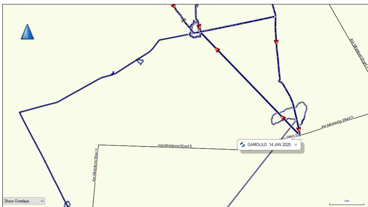
Figure 4: Gamoiililo track log, southern part of the farm