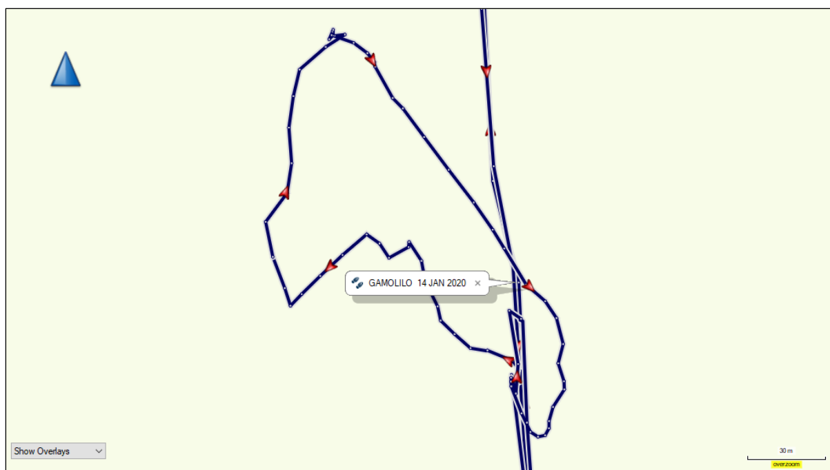
Figure 3: Gamolilo track log, central area of the farm