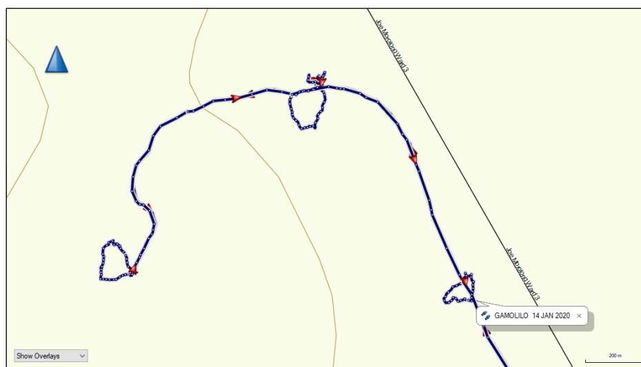
Figure 2: Gamolilo track log northern part of the farm