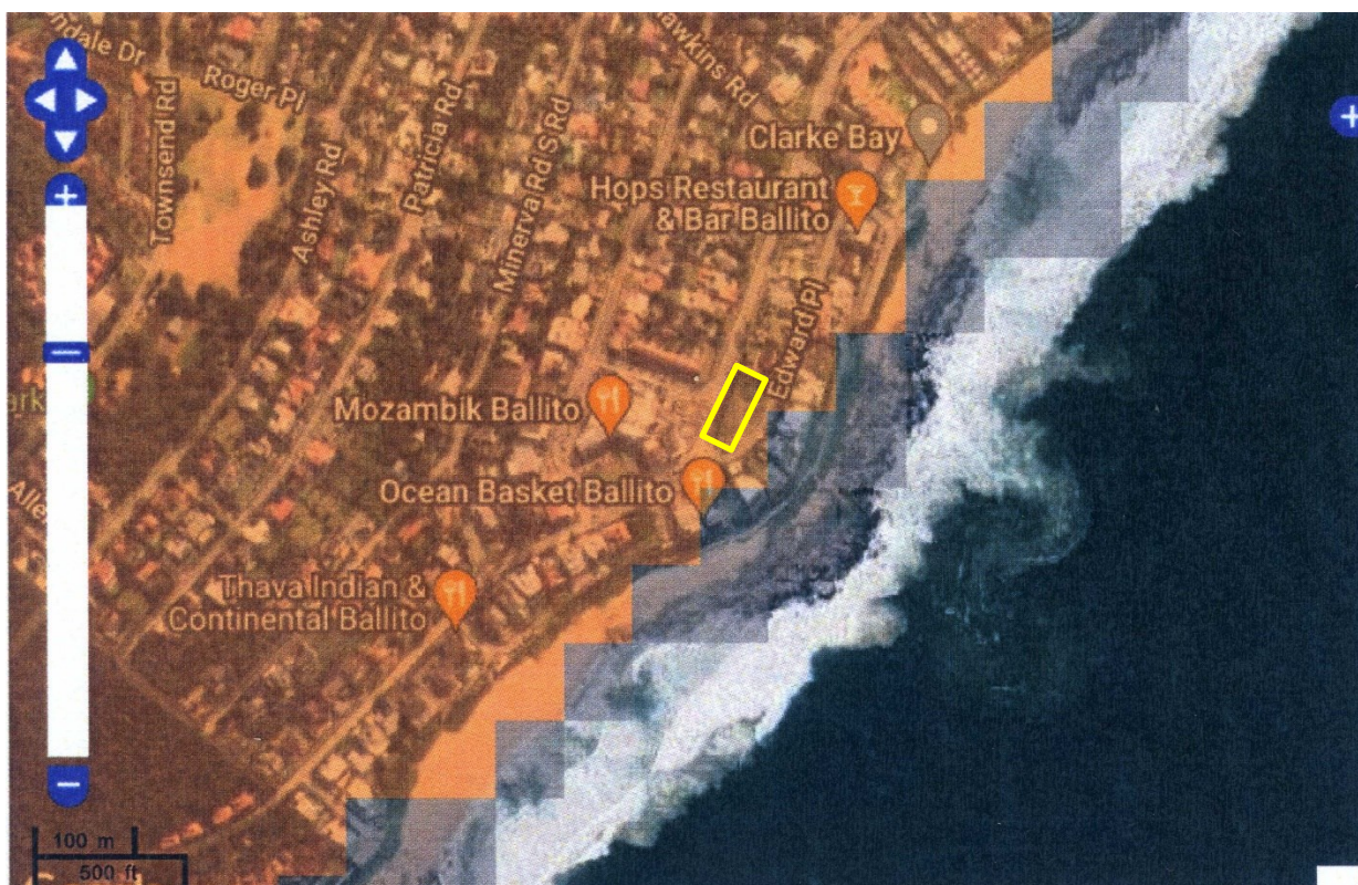
Figure 4: SAHRIS palaeosensitivity map for the site for the proposed Edward Place Units project shown within the yellow rectangle. Background colours indicate the following degrees of sensitivity: red = very highly sensitive; orange/yellow = high; green = moderate; blue = low; grey = insignificant/zero.