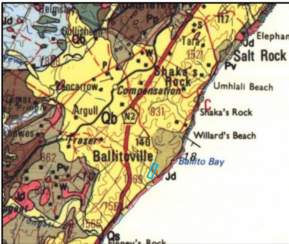
Figure 3: Geological map of the area around Ballito and the Edward Place project (blue lines). Abbreviations of the rock types are explained in Table 2. Map enlarged from the Geological Survey 1: 250 000 map 2930 Durban.

Table 2: Explanation of symbols for the geological map and approximate ages (Botha, 2018; Eriksson et al., 2006. Johnson et al., 2006; Roberts et al., 2006). SG = Supergroup; Fm = Formation; Ma = million years; grey shading = formations impacted by the project.