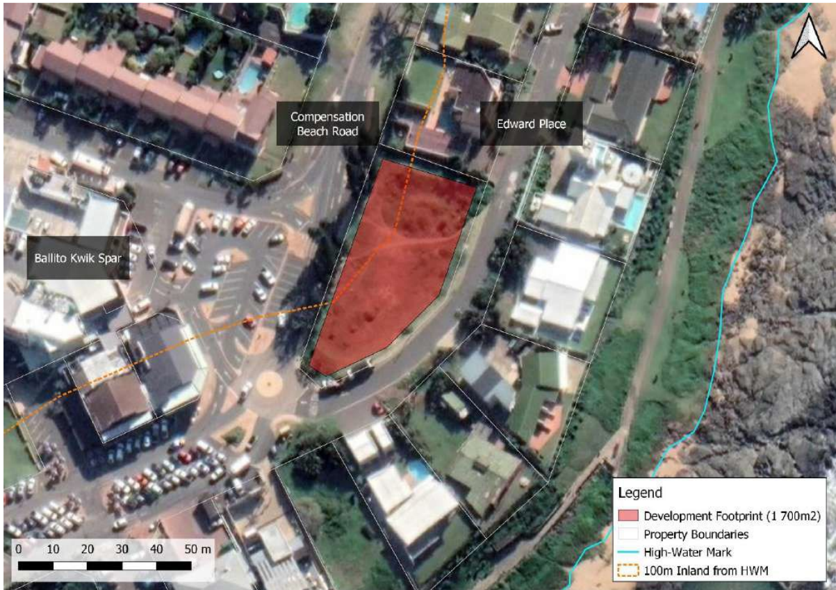
Figure 2: Google Earth Map of the proposed Edward Place Units project in Ballito indicated by the red polygon. Map provided by Confluence.