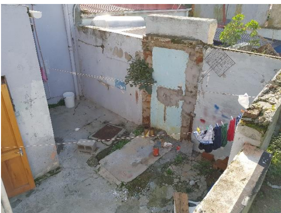
Courtyard lower part