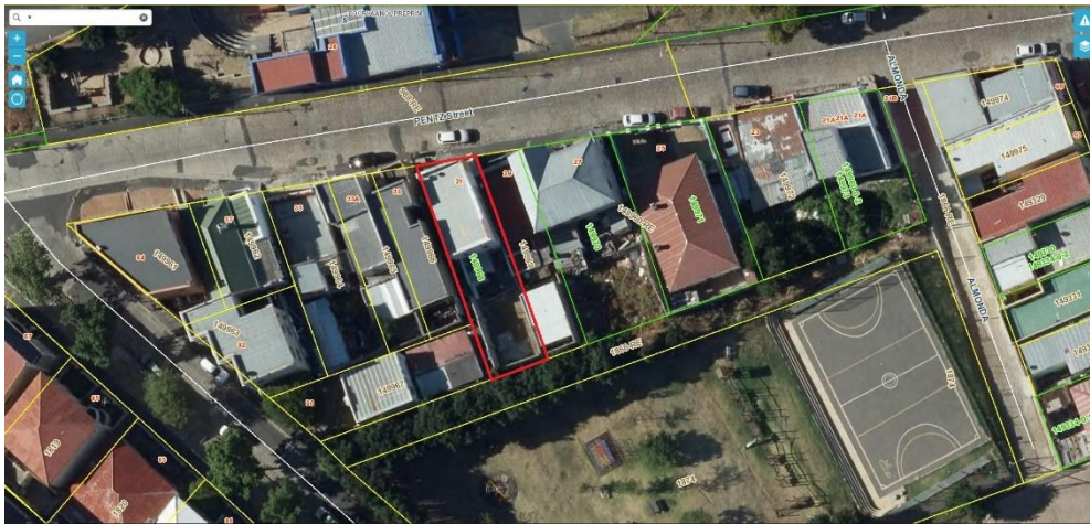
City Map Viewer