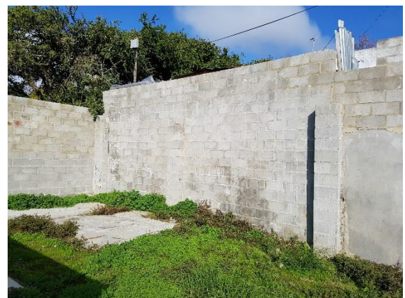
Court yard upper part