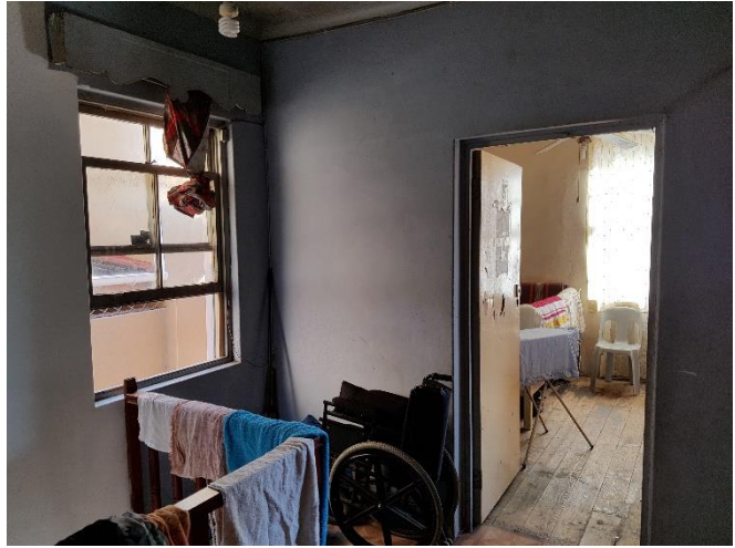
First floor landing