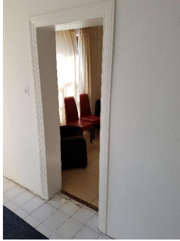
Door into living room