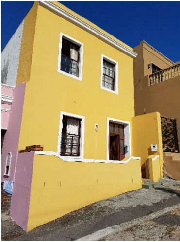
Pentz Street façade