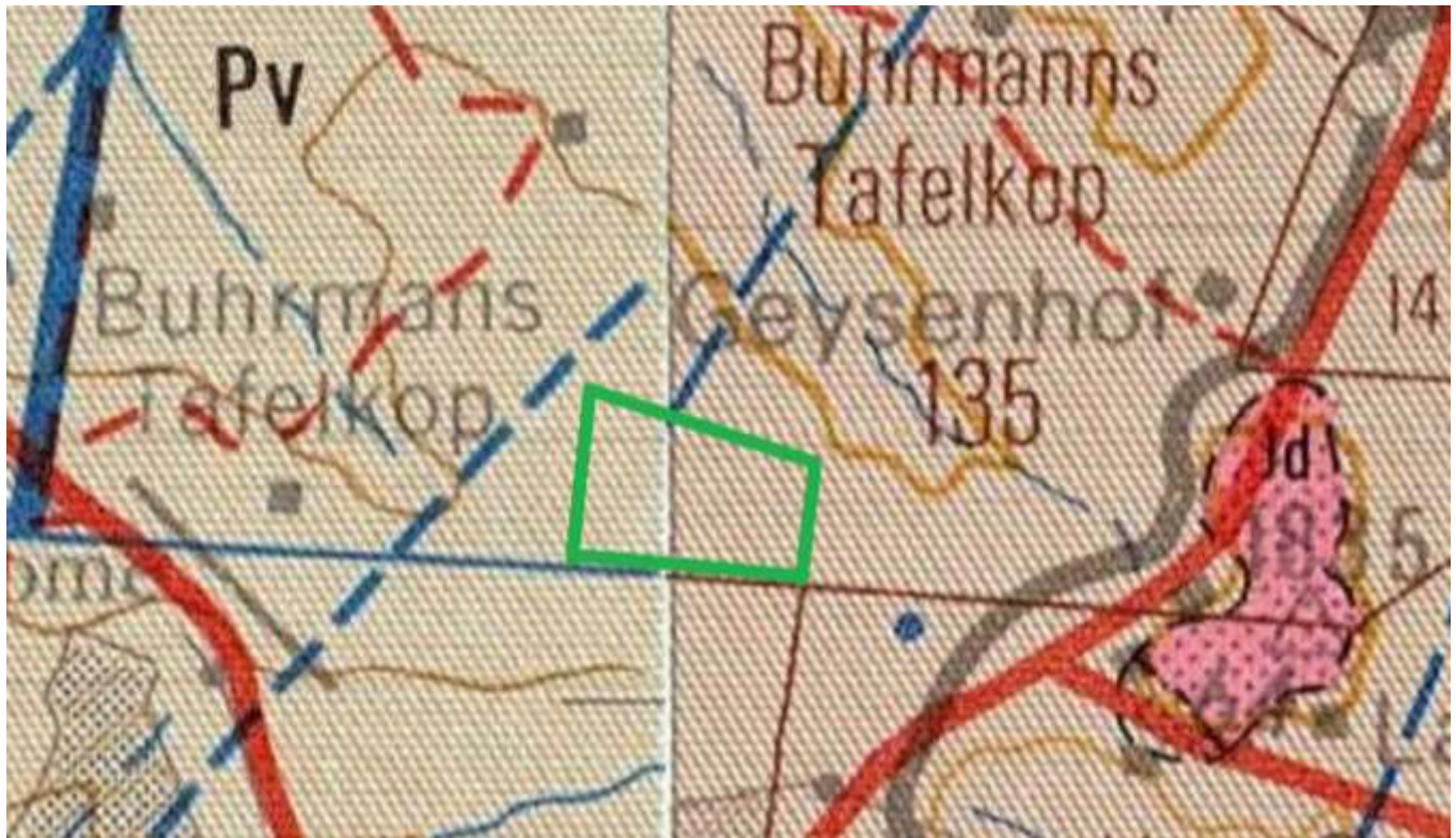
Figure 2: The study area is indicated by the green rectangle (Geology Map of the study area adapted from the 2628 EAST RAND and the 2630 MBABANE 1:250 000 Geology Maps, Geological Survey, 1986)