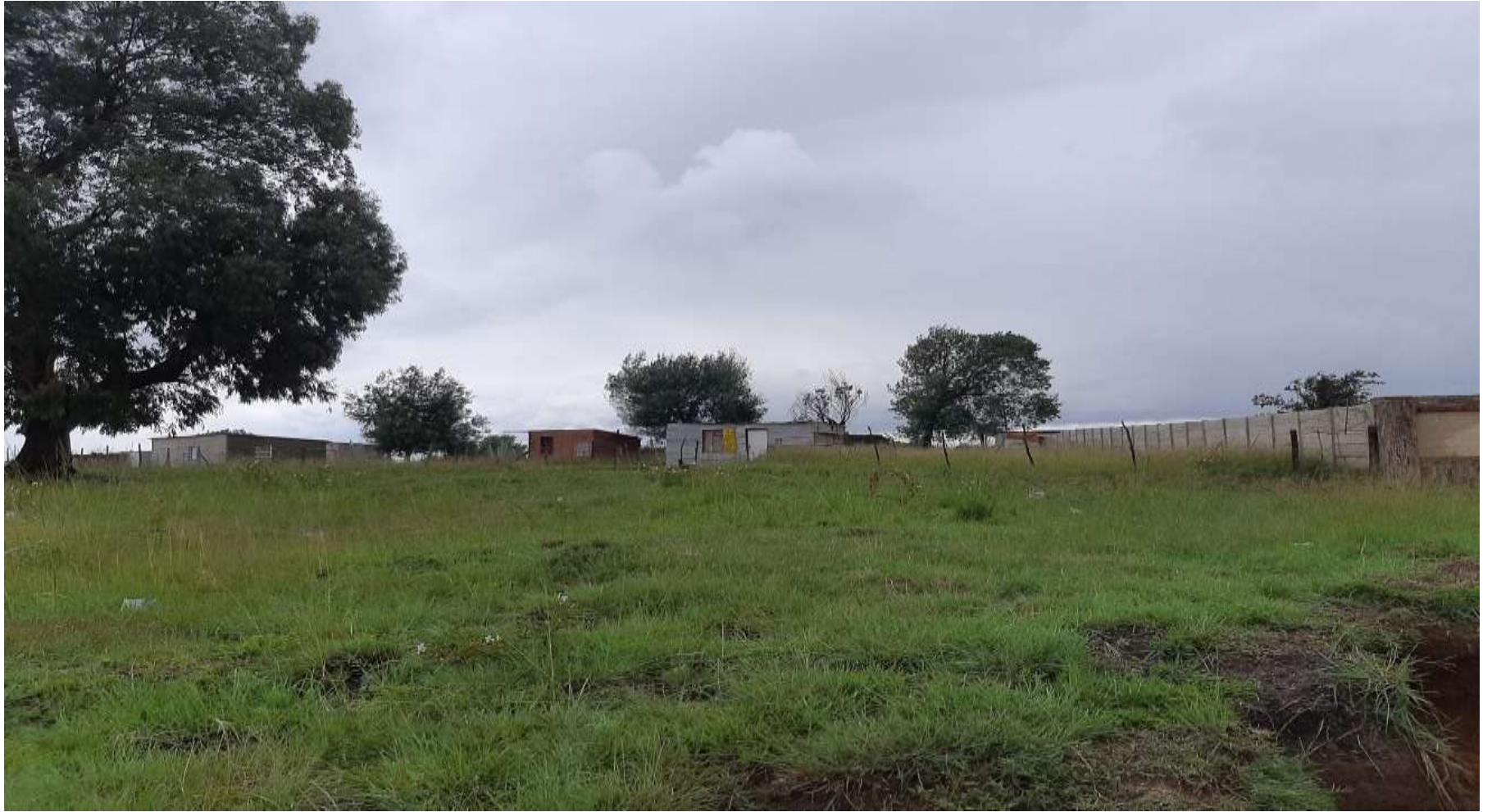
Figure 3 View of the study site (SE corner, facing N): 26°29'46.86"S 30°00'28.27"E.