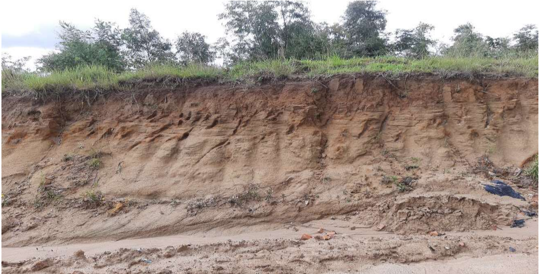
Figure 4 View of the geology exposed in a road cutting to the south of the study site (26°29'53.38"S 30°00'27.59" E)