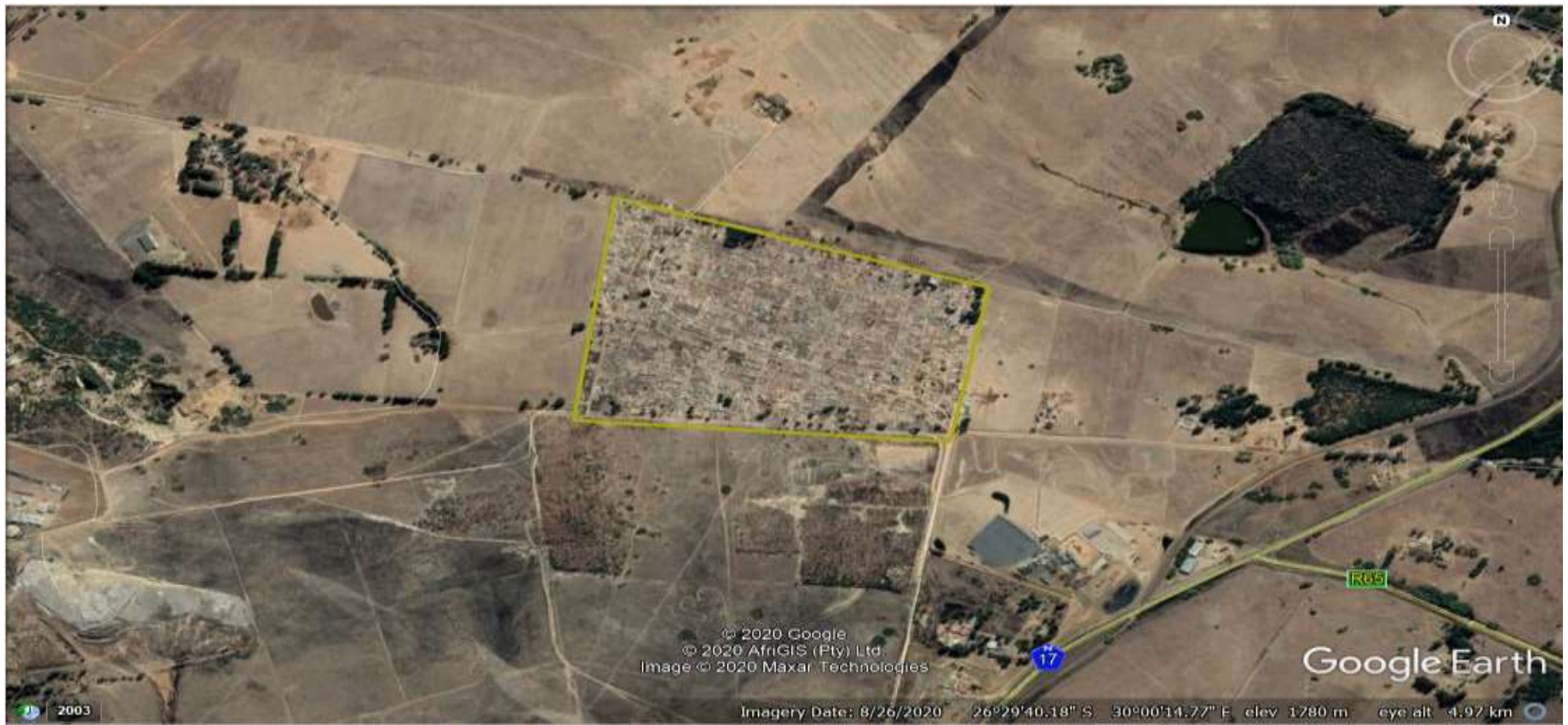
Figure 1: Google Earth photo of the study site (yellow rectangle)