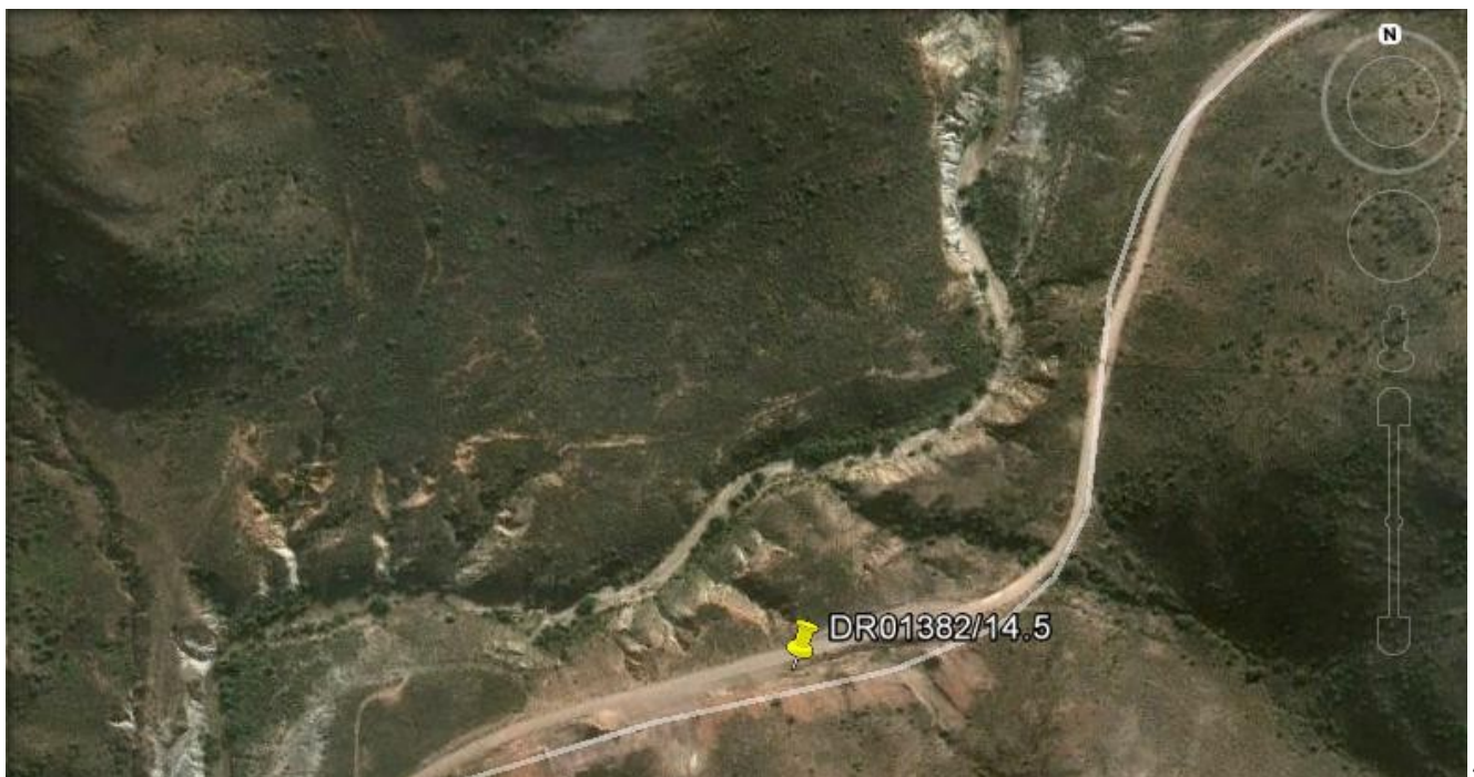
Figure 5: Aerial view of existing borrow pit (Google earth image, August 2012)