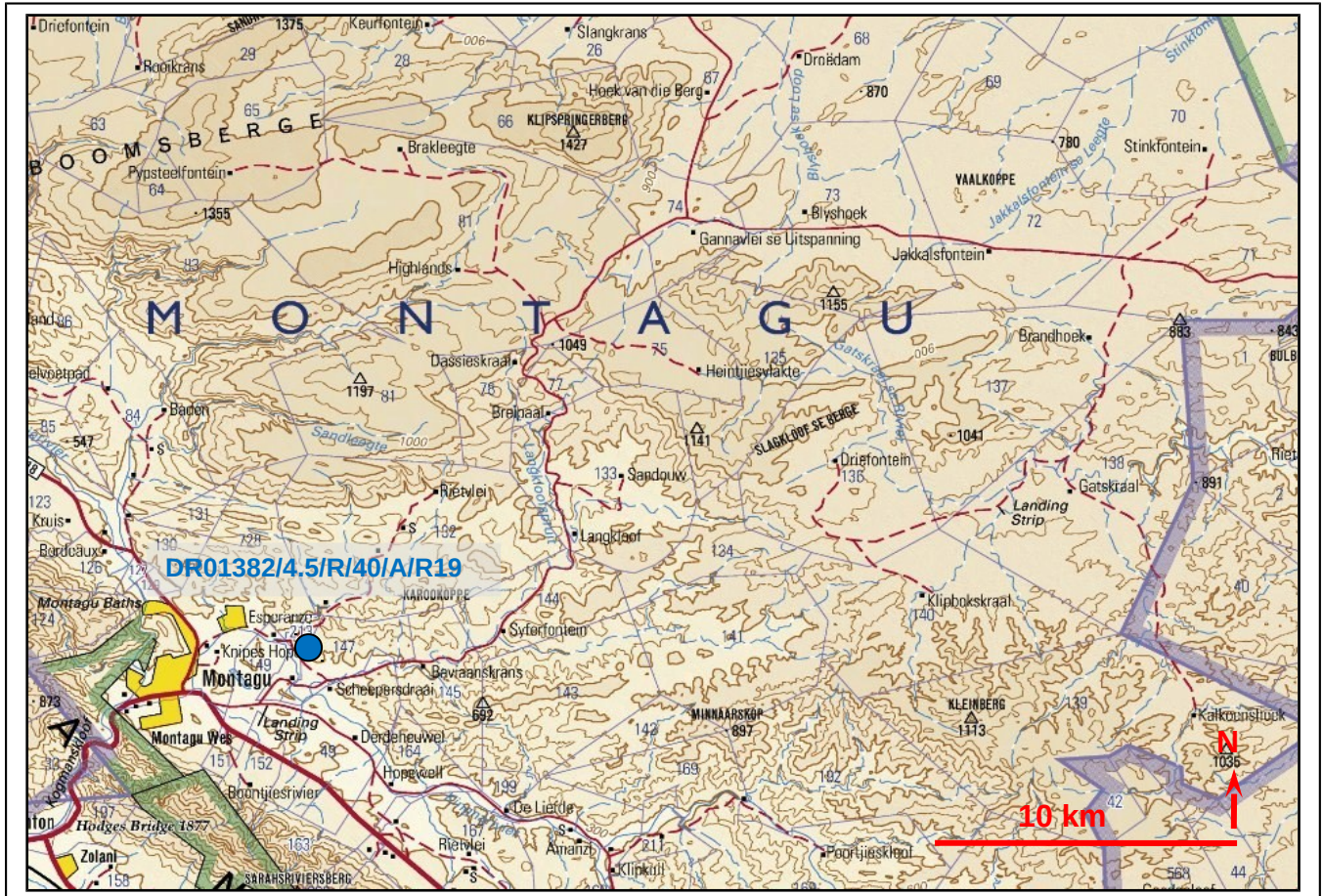
Figure 1: Extract from topographical sheet 3320 Ladismith (extracted Almond 2012: 2)

It is proposed to develop a borrow pit for road material situated 5.5 km northeast of the town of Montagu in the Cape Winelands District Municipality, Western Cape. The existing quarry lies within the road reserve of the DR1382 and is located at the foot of a fairly steep northwest and west-facing slope. Beyond the affected area, a small side stream runs down the slope to the south and west of the site and joins the main stream situated on the northern side of the DR1382. The crest of the slope on which the proposed extension is situated lies to the east. It is proposed to extend the pit from the existing face in a southerly and south-easterly direction into the slope. Montagu Farm No. 213 (Helpmekaar) is in private ownership of Nuwedrift Fruit & Wine Eiendoms Ltd. Borrow pit co-ordinates are 33° 46' 06.8" S, 20° 10' 24.4" E