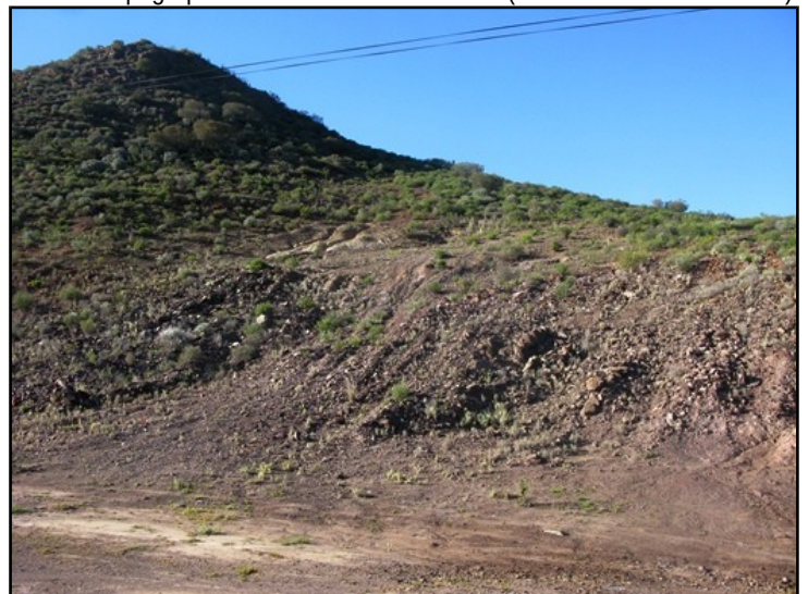
Figure 3: View towards the northwest over most of the proposed extension (Almond 2012: 4)