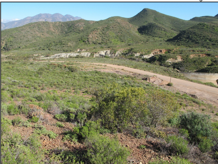
Figure 2: View towards the northwest over most of the proposed extension (Tusenius 2012: 8)