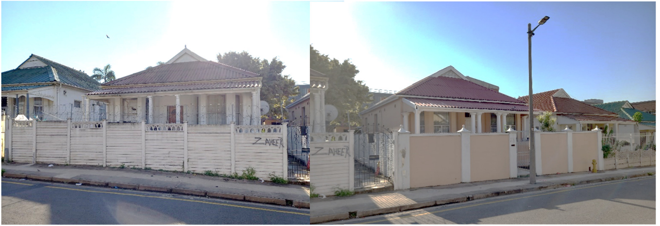
31 and 32 Chestnut Road - Listed