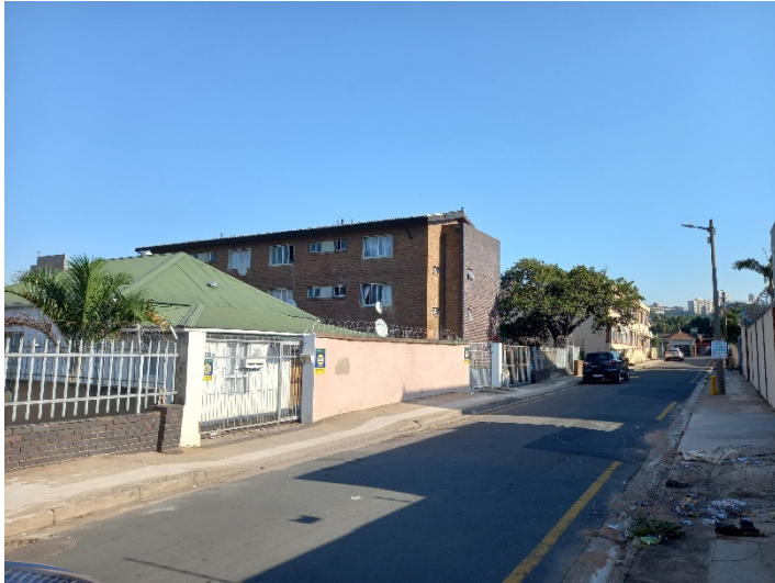
View towards Umbilo Rd (North East side)