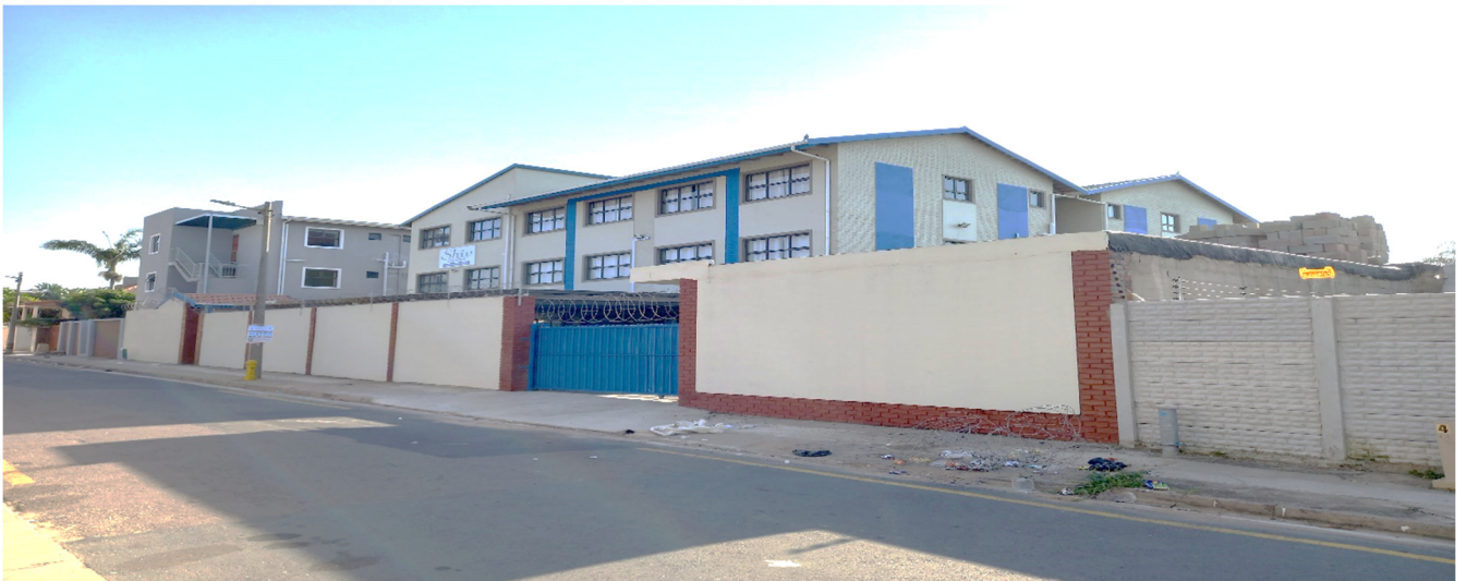
Panaramic view of 23 and 17 Chestnut Rd (upper Chestnut Rd NE side)