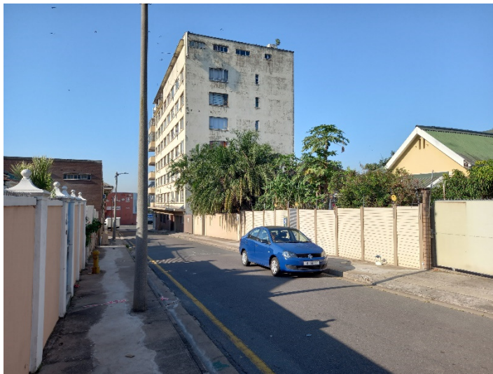
South West side of Chestnut Road looking towards Umbilo Rd.