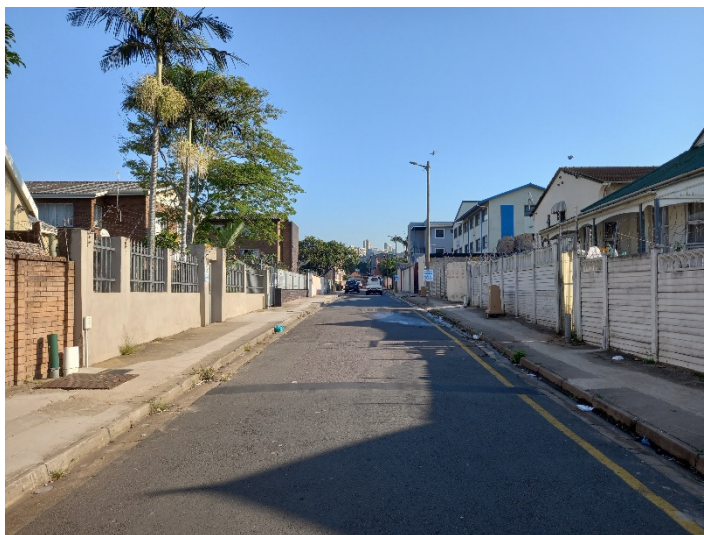
View up Chestnut Road towards Esther Roberts Road (from no. 28 on the RHS upwards)