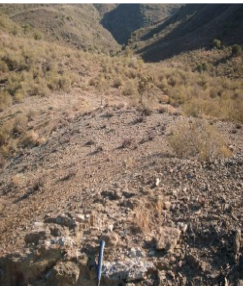
Figure 3: At km 6.8 area that can be utilised for borrow Pit.(July 2011)