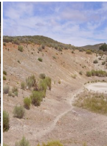
Figure 4: At km 29.55 Overview of Borrow Pit 24 in a westerly direction (July 2011)