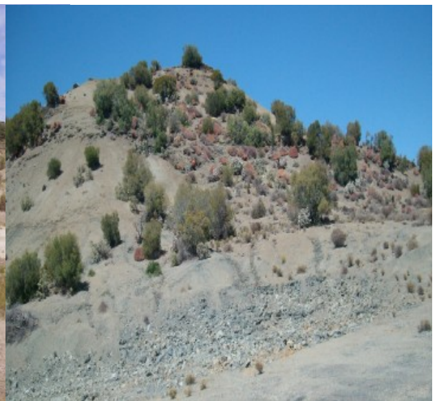
Figure 5: At km 44.75 Overview of borrow Pit in south westerly direction (July 2011)