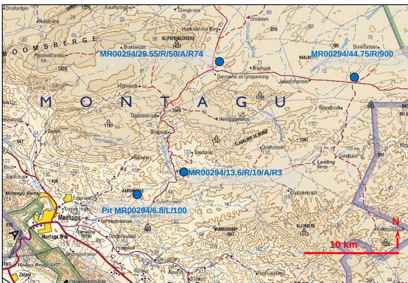
Figure 1: Extract from topographical sheet 3320 Ladismith (extracted Almond 2012: 2)

At km 44.75 expansion site is located approximately 35 km north east of Montagu on farm Ratelfontein No. 71 owned by Sanbona Wildlife Reserve. Source of wearing course gravel is located in an existing borrow pit. The borrow pit is directly behind a portion of the Sanbona Wildlife Reserve. Grass, shrubs and some small trees surrounds the Borrow Pit. At km 44.75 borrow pit co-ordinates are 33°40'15.96"S, 20°26'56.40"E