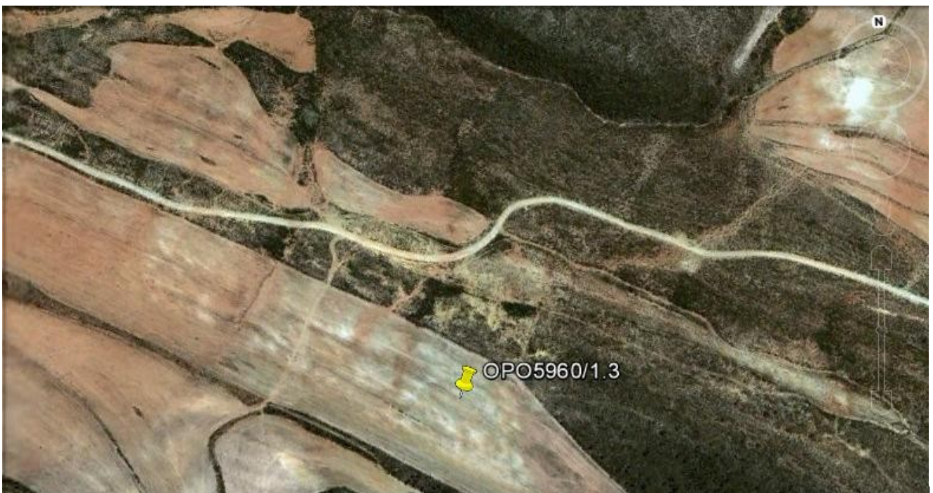
Figure 5: Aerial view of existing borrow pit (Google earth image, August 2012)