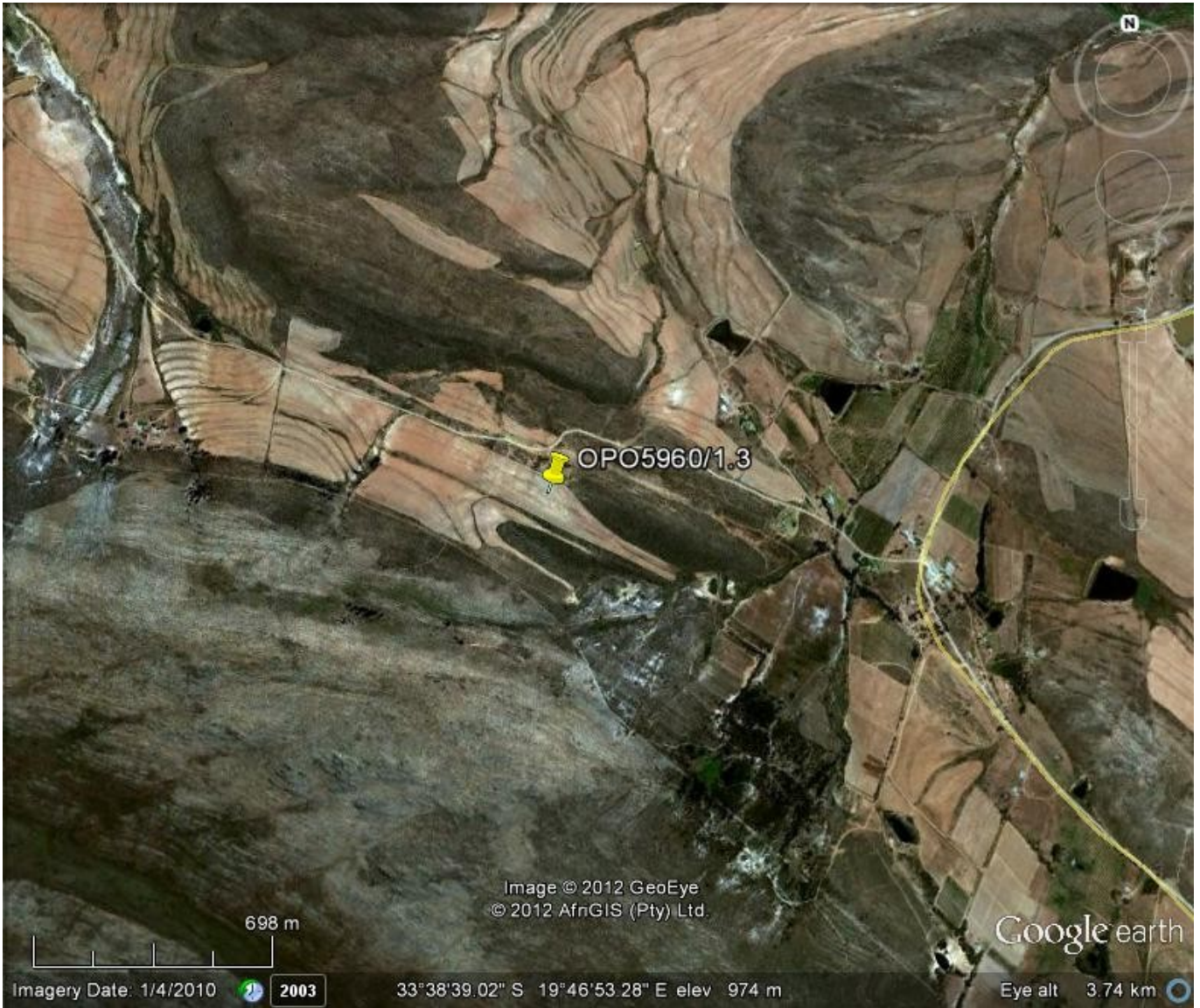
Figure 4: Aerial view of existing borrow pit location