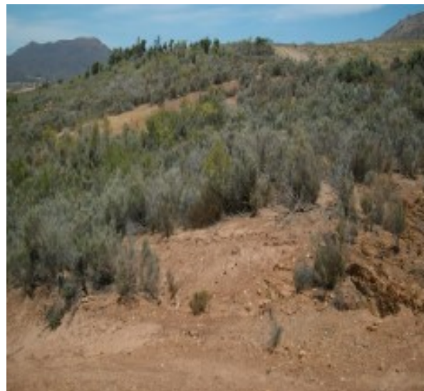
Figure 3: Overview from a south easterly direction (July, 2011)