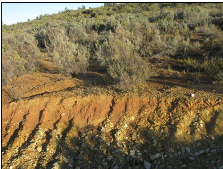
Figure 2: Deposits with fine surface gravels mantling the Bokkeveld Group mudrocks along the southern edge of the pit (Almond 2012: 5)