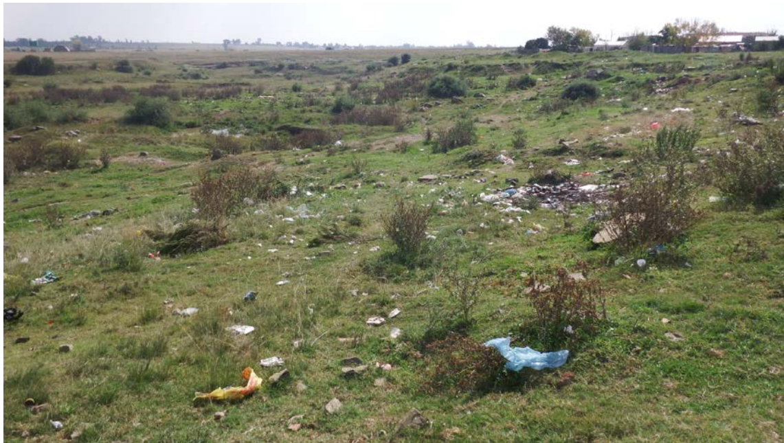
Figure 10. Severely degraded part of the footprint Matwabeng consisting of alluvial Quaternary alluvial deposits.