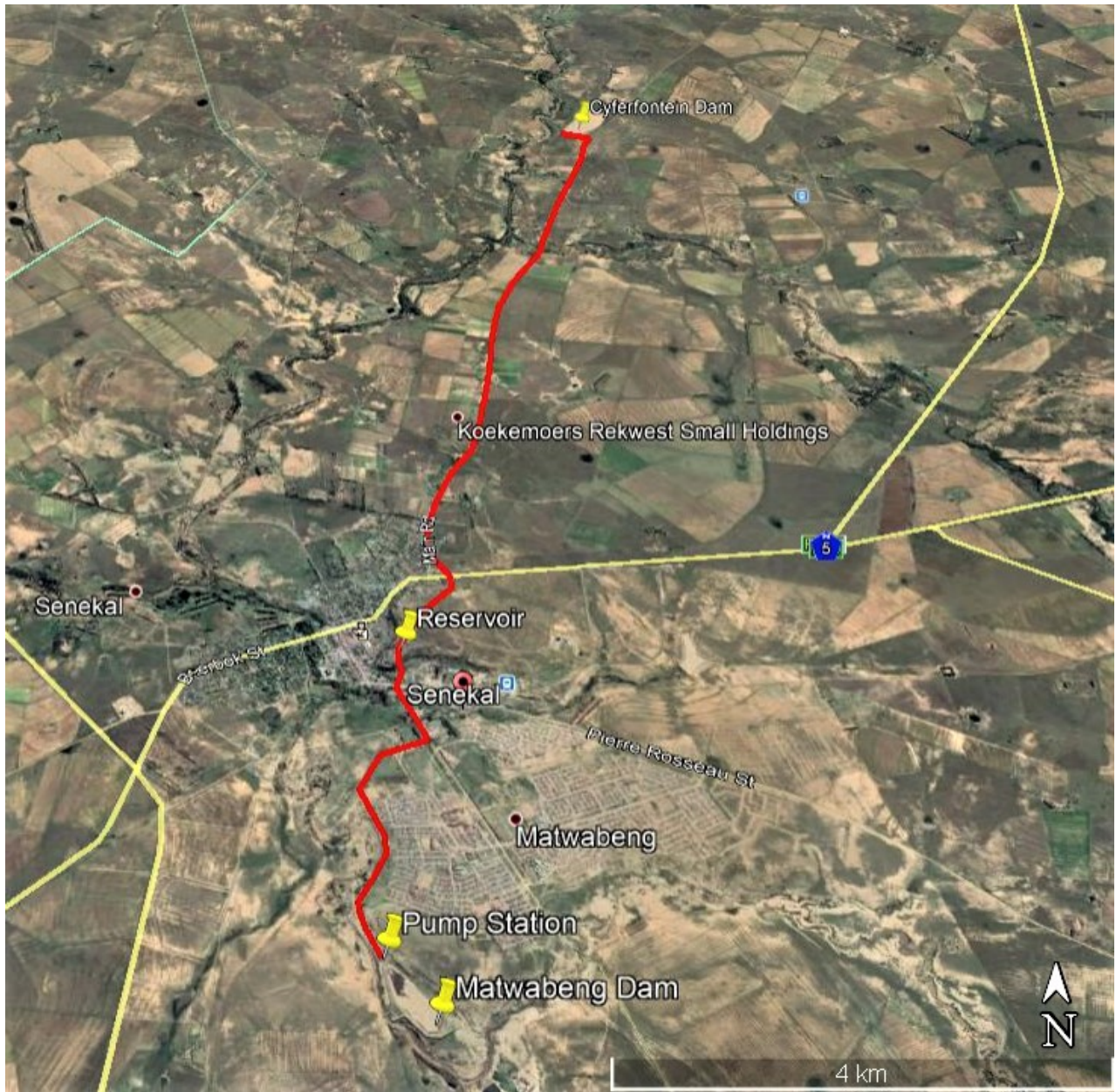
Figure 1. Aerial view of the proposed water pipeline footprint between the Cyferfontein Dam and the Matabeng Dam pump station.