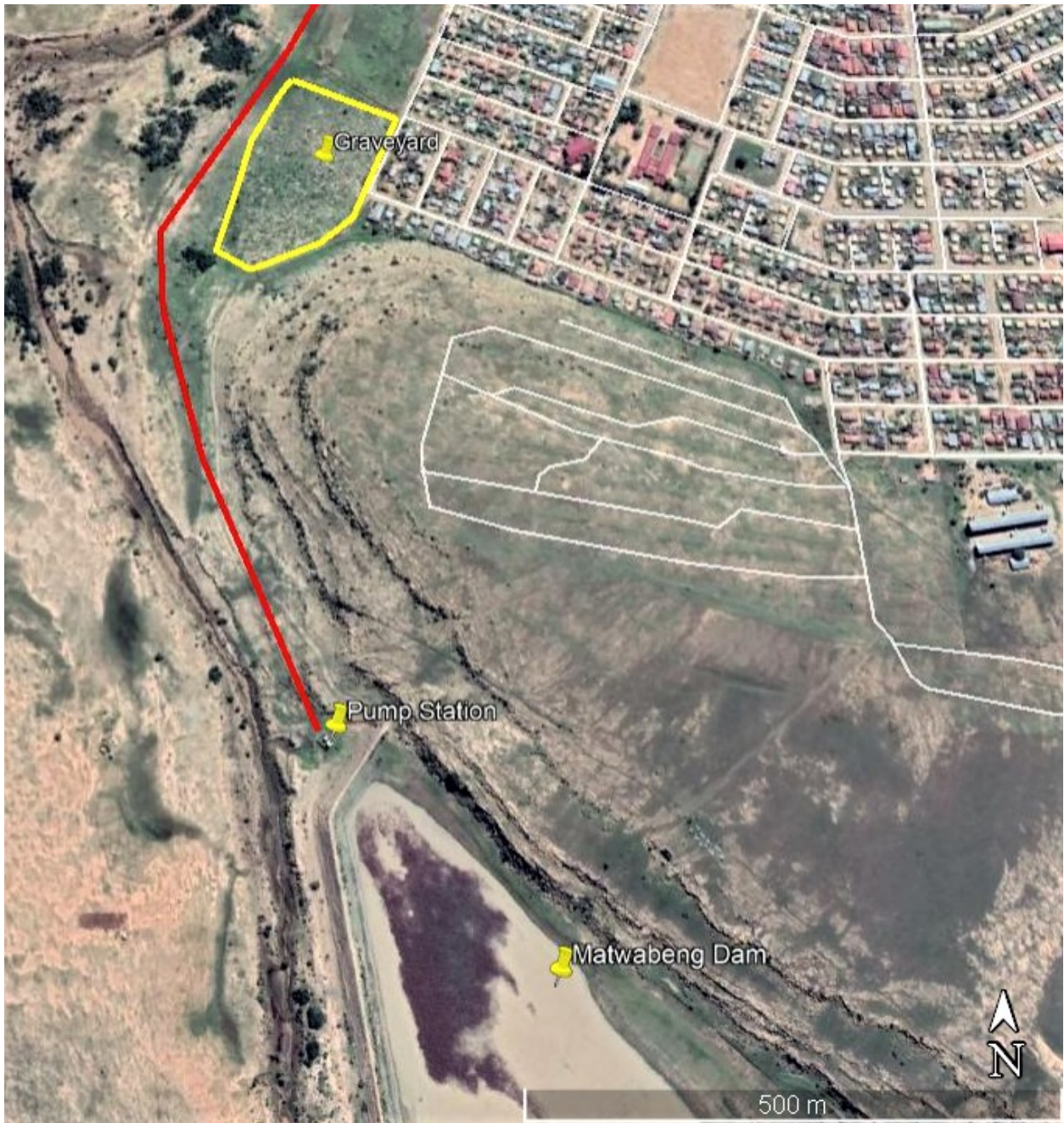
Figure 12. Aerial view of the cemetery at Matwabeng.