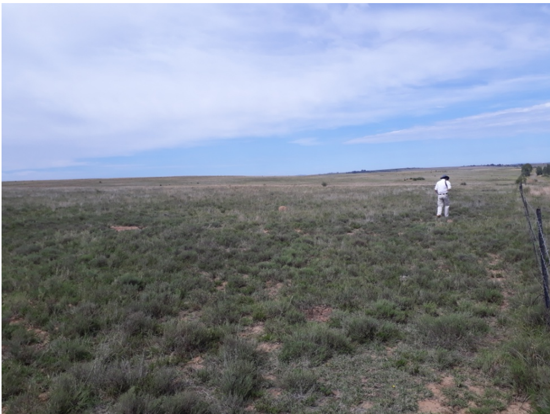
Figure 4. General view of the pipeline footprint on agricultural land near the Cyferfontein Dam.