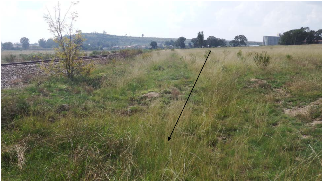
Figure 9. General view of the pipeline footprint south of the Senekal reservoir (above) and near the railway tracks (below).