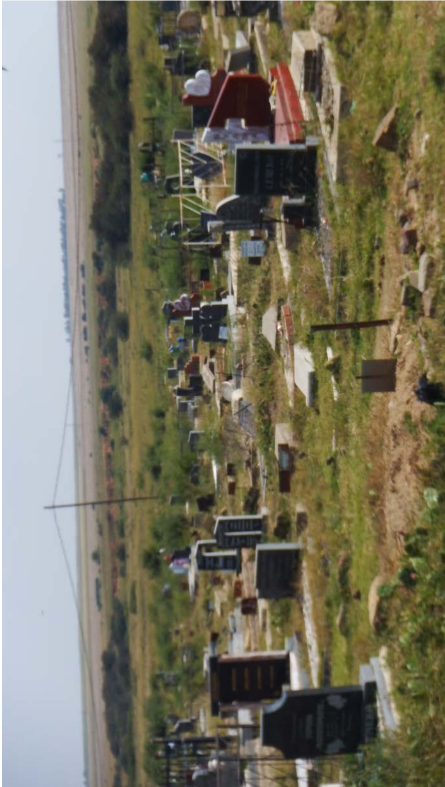
Figure 11. Modern cemetery at Matwabeng.