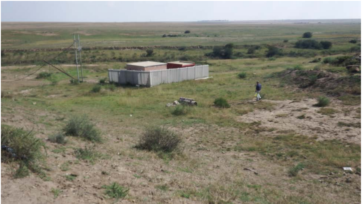
Figure 13. Quaternary alluvial overbank sediments eroding out to the south of Matwabeng (above) and north of the pump station at the Matwabeng Dam (below).