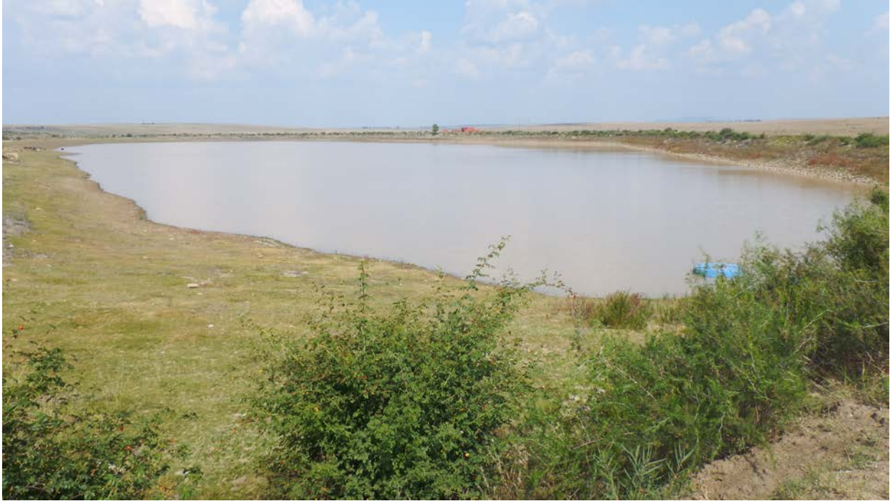
Figure 14. General view of the Matwabeng Dam, looking southeast.