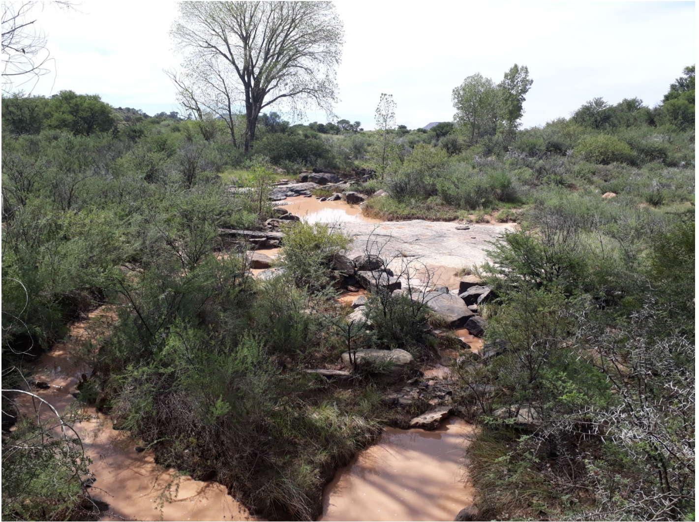
Figure 6. Exposed Adelaide Subgroup sedimentary strata and geologically recent alluvium flanking the river crossing at the Senator Lamprecht Bridge, located 2.6 km south of the Cyferfontein Dam (GPS coordinates 28°15'51.82"S 27°39'3.37"E).