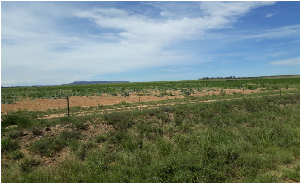
Figure 7. General view of agricultural land between the Cyferfontein Dam and the Koekemoers Rekwest Small Holdings, which will be impacted by the development.