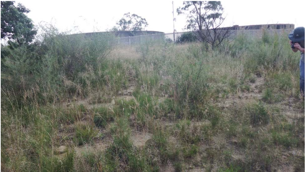
Figure 8. Course – grained Adelaide Subgroup sandstones (above) outcropping near the Senekal Reservoir (below).