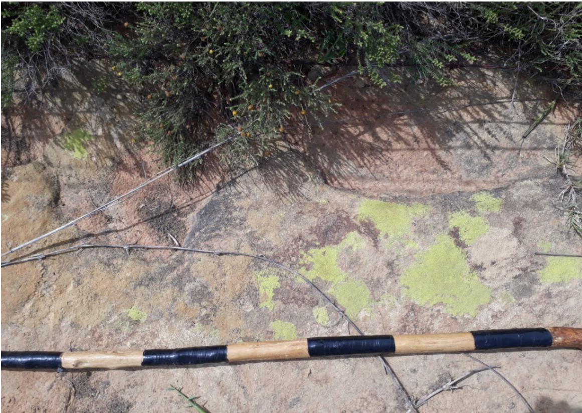
Figure 5. Adelaide Subgroup outcrop consisting of medium to coarse-grained sandstones.