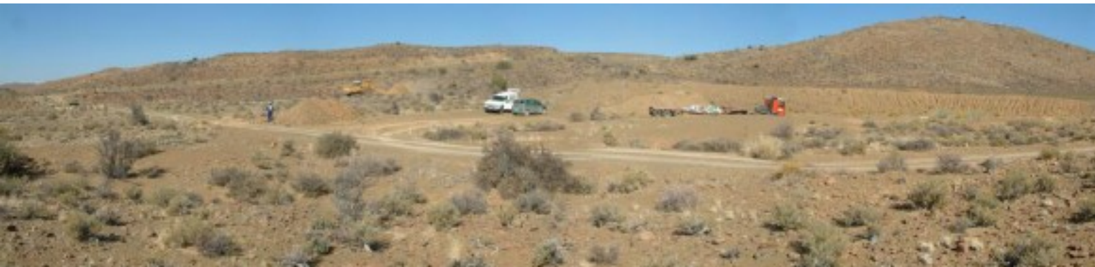
Figure 2: Panorama of entire pit area (2011)