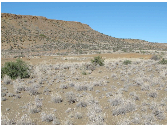
Figure 2: At km 29.9 view towards the south-east over the alluvium of the southern half of the affected area (Tusenius 2012: 10)