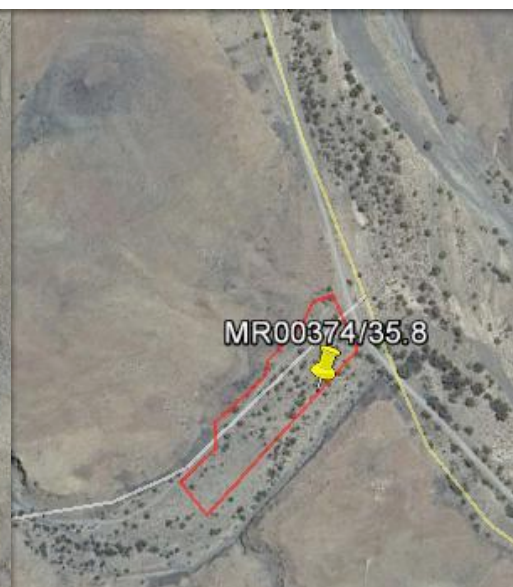
Figure 7: At km 35.8 Aerial view of proposed borrow pit and expropriation area (Google earth image, June 2012)