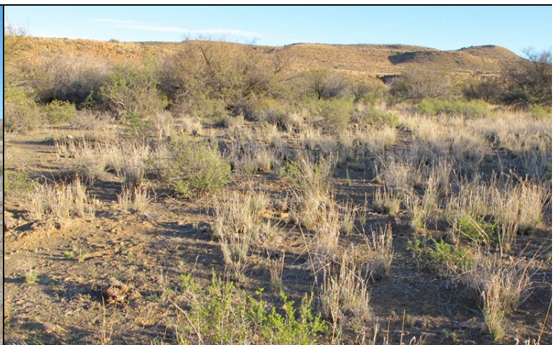
Figure 3: At km 35.8 view towards the south-west of the affected area. The central area has denser vegetation (Tusenius 2012: 13)