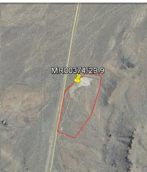
Figure 6: At km 29.9 Aerial view of proposed borrow pit and expropriation area (Google earth image, June 2012)