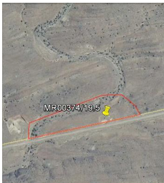
Figure 5: At km 19.5 Aerial view of proposed borrow pit and expropriation area (Google earth image, June 2012)