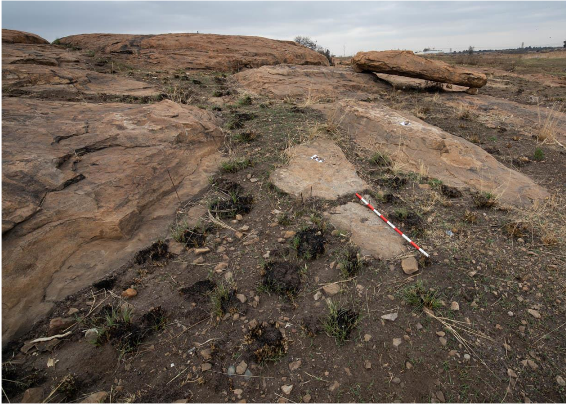
Figure 27. Rock H