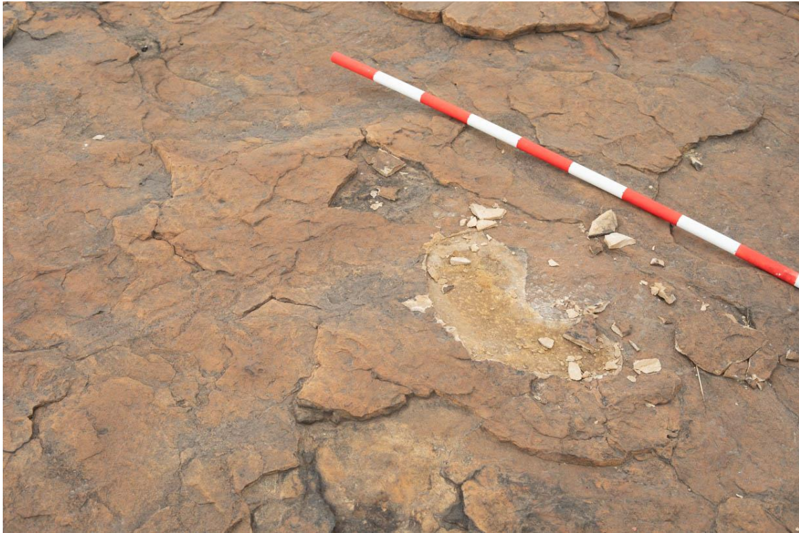
Figure 16. Another example of natural weathering on an engraved surface. Notice the engravings immediately to the left of the damaged surface. Rock Q