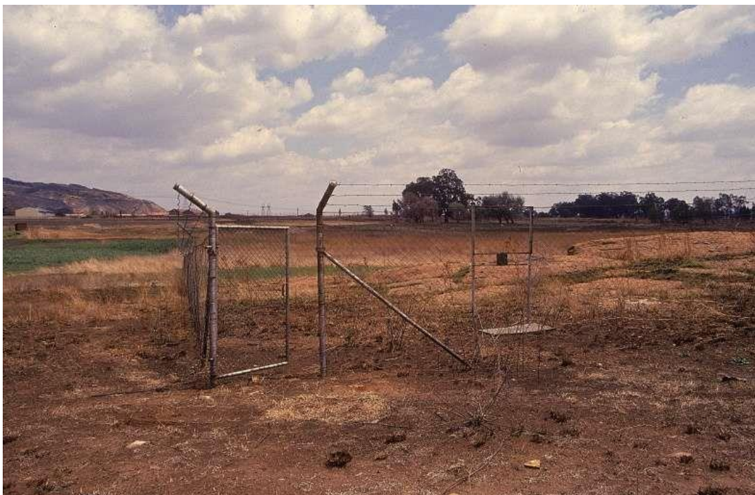
Figure 11. The Redan engraving site was fenced around the time that it was declared a National Monument in 1971. The fence was subsequently torn down by vandals.

In the 1950s, probably in response to fears that the site would be damaged (Prins 2007: 45), Cecil Van Riet Lowe of the Historic Monuments Commission ordered the removal of the largest of the geometric motifs from the Redan engraving site. The engraving was taken to the University of the Witwatersrand in Johannesburg and it is displayed in the Origins Centre Museum.