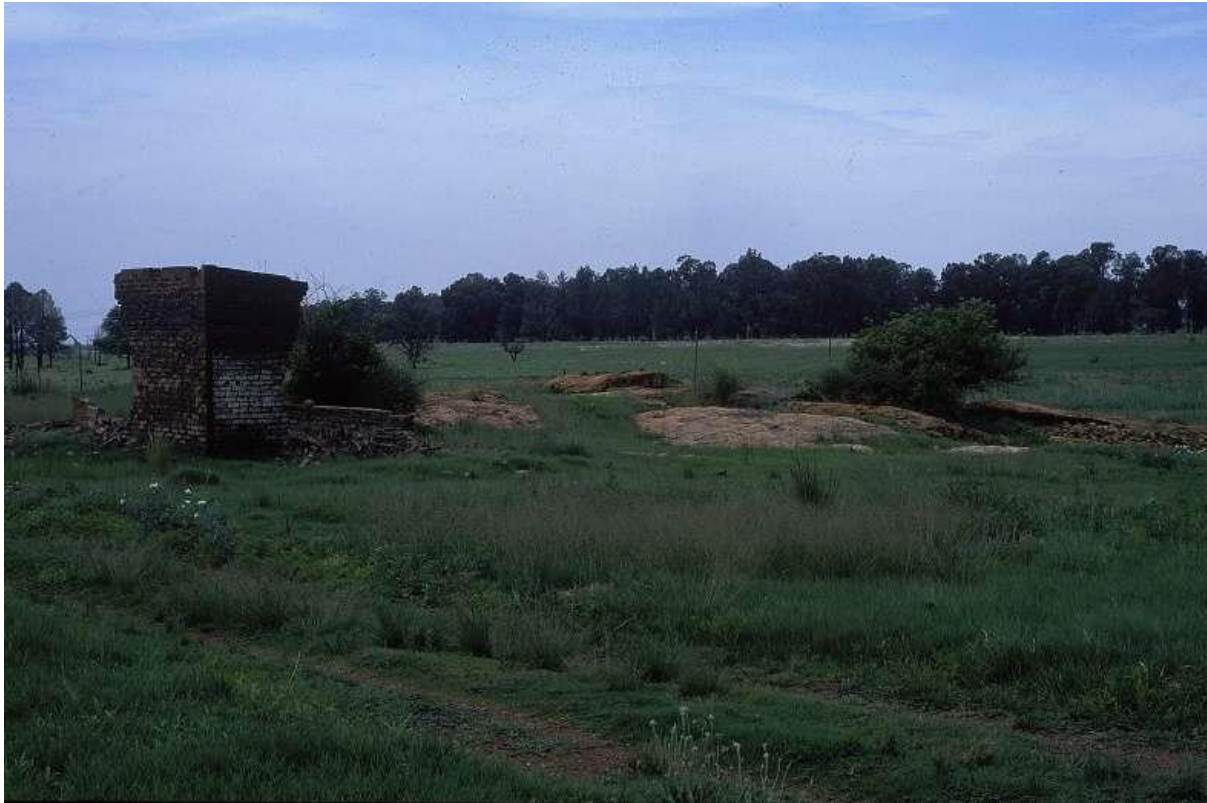
Figure 6. Ruin next to the Redan engraving site (subsequently destroyed). The engravings are on the sandstone rock outcrops in the middle of the picture.

The presence of a circular arrangement of stones at the north western end of the outcrop was noted and is mentioned by Prins (2005). There is a sinkhole between 10 and 20 m deep 50 m north west of the outcrop. Around the north west and north east edges of the outcrop are the remains of ash heaps. A photograph from 2000 shows the ruin of a small building on the north east edge of the outcrop but there was no sign of this except for a few bricks on the day of the on-site inspection