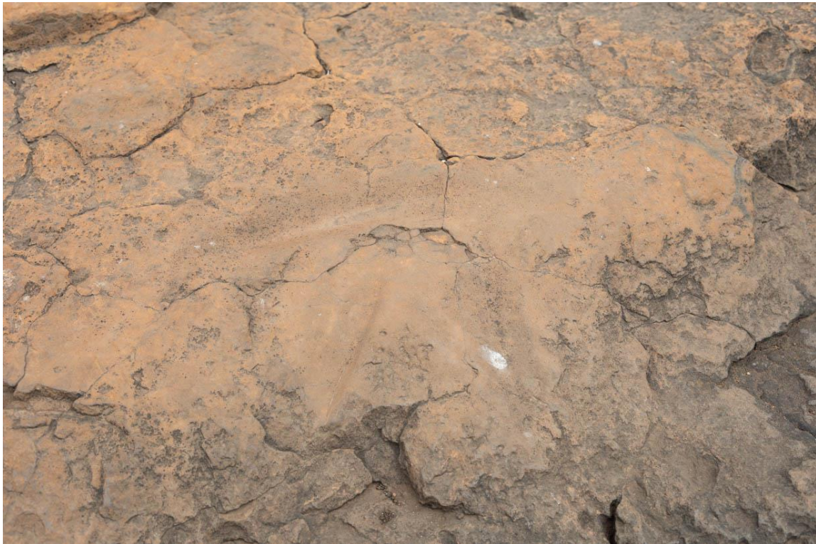
Figure 10. The rock has been smoothed friction caused by people rubbing the rock. Here people made shallow grooves by rubbing the rock with unknown objects (perhaps stone). Rock K

in the rock where water accumulates after good rains (Willcox & Pager 19767: 492). The cupules are stained black and the water that overflows from the cupules and the natural depression and trickles down the rock also leaves a black stain. The presence of these cupules is an important archaeological feature at Redan site because such arrangements of cupules around water are not common. There are also smaller areas of smoothed rock (ca. 200 x 200 mm) and seven grooves also that were made around the largest of the natural depressions (Willcox & Pager 1967: 492; Prins 2005: 245).