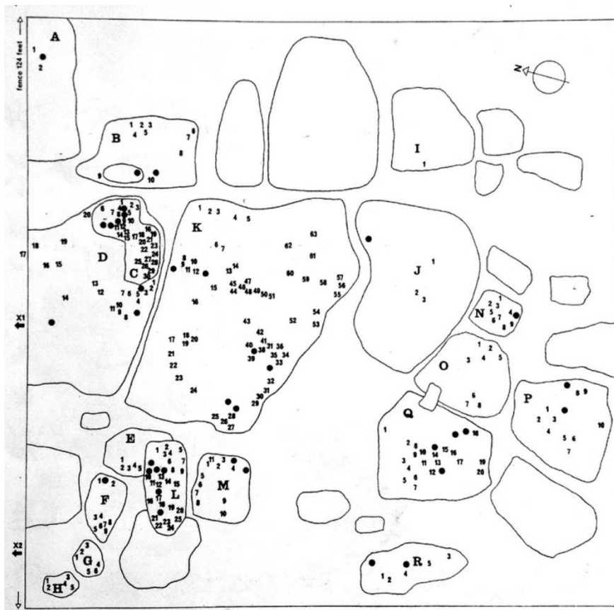
Figure 5. Diagram of the position and number of engravings recorded on the rocks at Redan by Harald Pager in the 1960s (Willcox & Pager 1967)