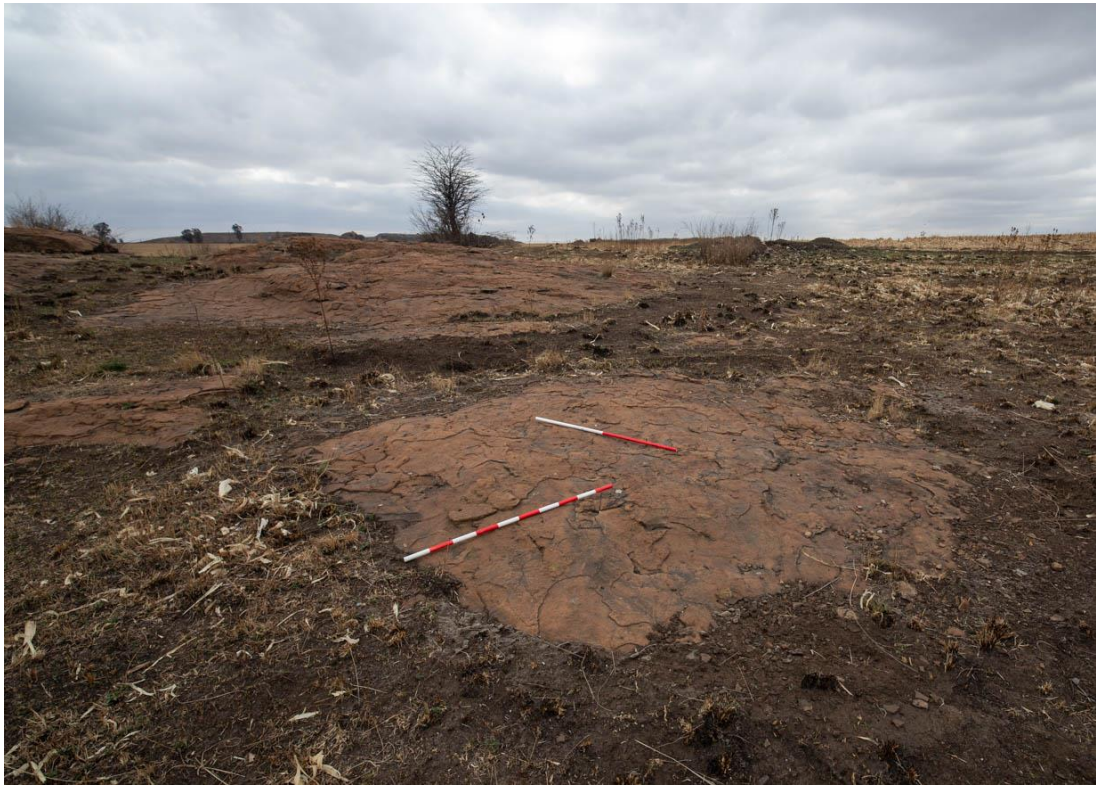
Figure 28. Rock I