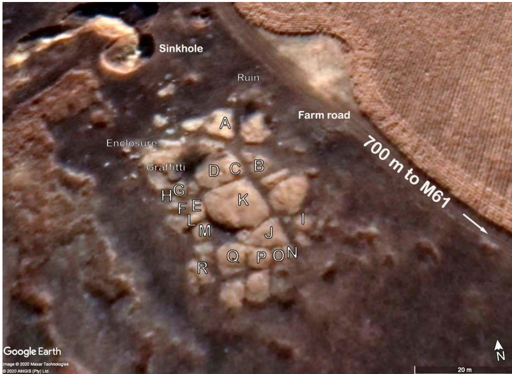
Figure 4. Overview of the Redan engraving site with each of the engraved outcrops labelled according to the survey carried out by Willcox & Pager (1967) (Google Earth 2020)