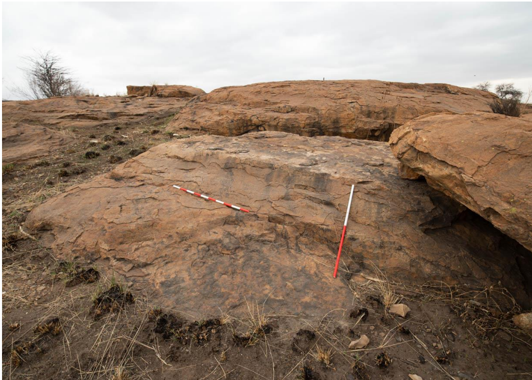
Figure 24. Rock E