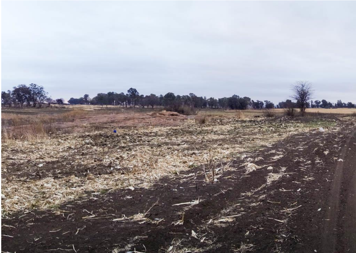
Figure 19. View of the outcrops of sandstone that comprise the Redan engraving site and the farm road that passes within a few metres of the site

There is currently no access control to the engraving site. There is a dirt track off the M61 immediately south of the Springfield Junior Secondary School that passes west of the agricultural field and within a few metres east of the engraving site. A farm road passes a few metres from the site, so it is very easy to access. The site is therefore very vulnerable to theft, vandalism and any other damage.