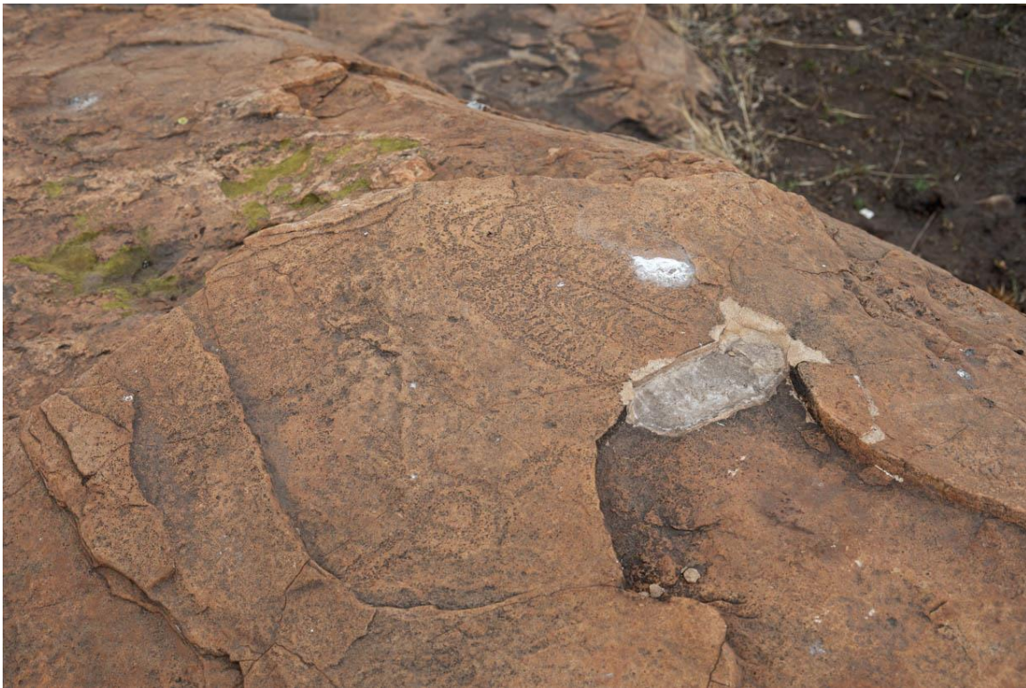
Figure 15. Natural weathering is a severe threat to the Redan engravings. It has caused part of this engraving to crack and crumble. This process is occurring on many of the rocks on the outcrop. Rock L

Chan (2017: 2) raises concerns about the damage caused by “acid rain” as a result of industrial activity in the surrounding area but does not supply any direct evidence.