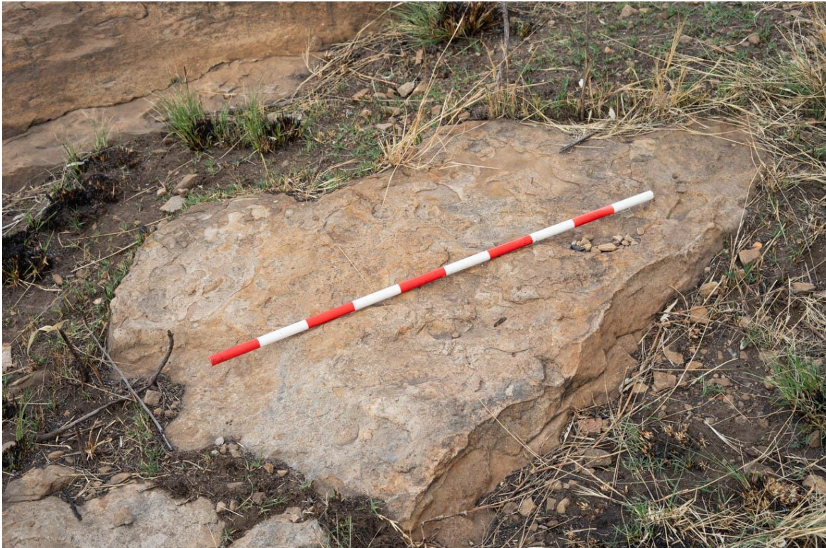
Figure 17. Rock G appears to have flaked extensively, most likely because the heat of fires has caused the surfaces to flake off