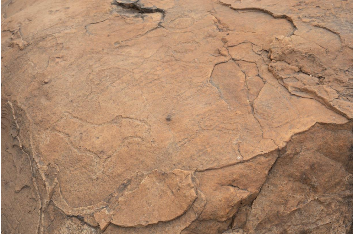
Figure 8. Possible engraving of a lion (bottom left of picture) alongside geometric designs. Rock C