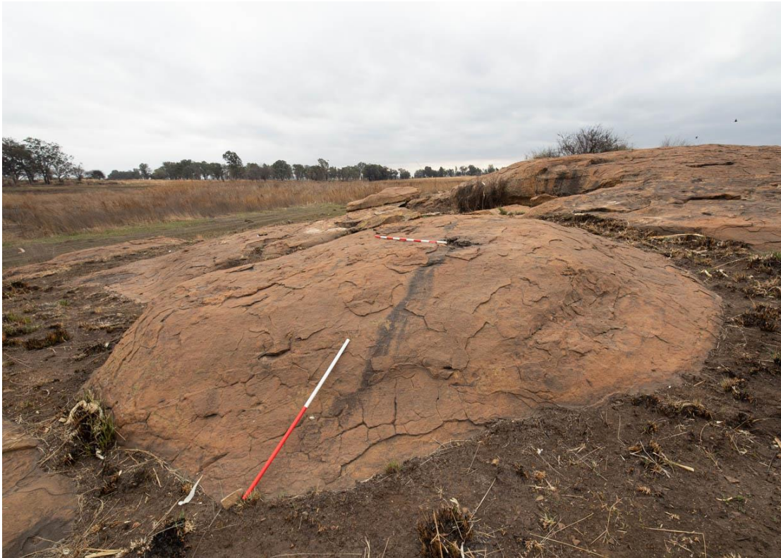
Figure 34. Rock O