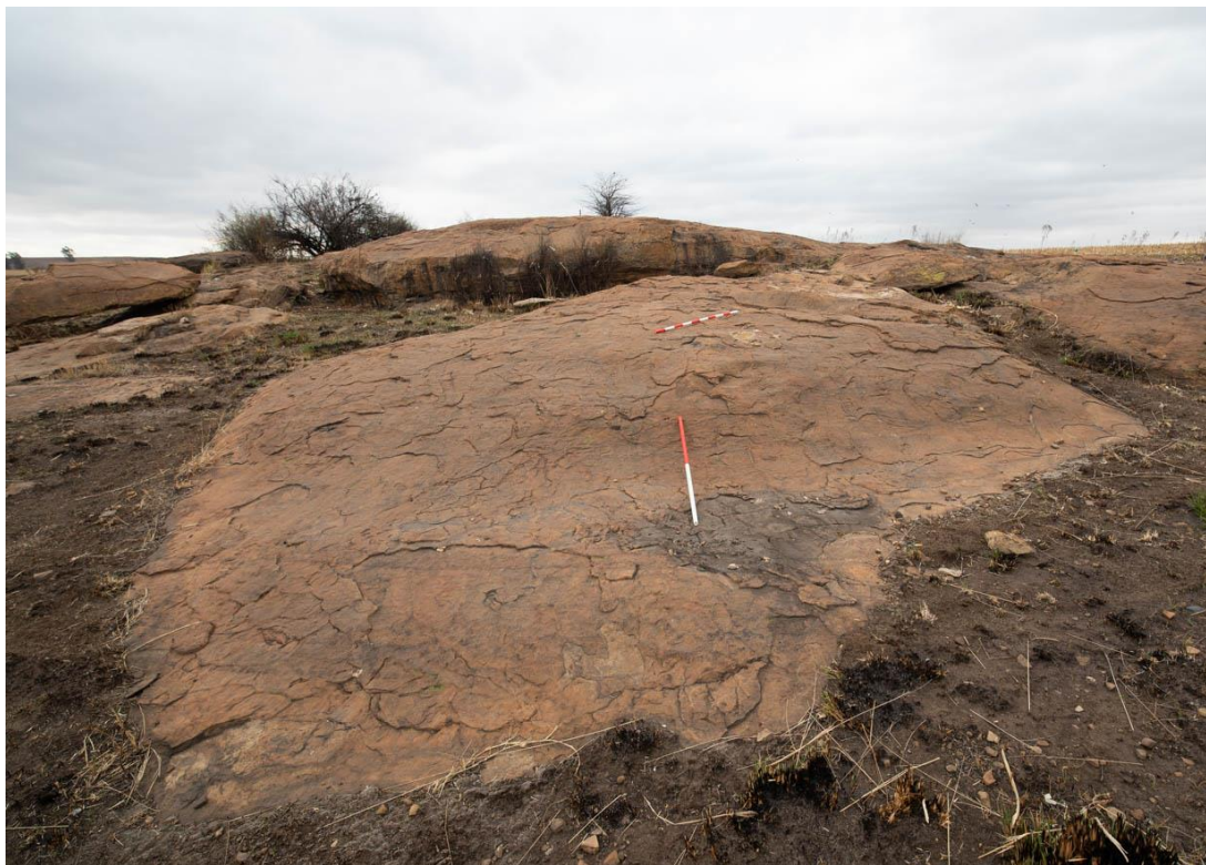
Figure 36. Rock Q