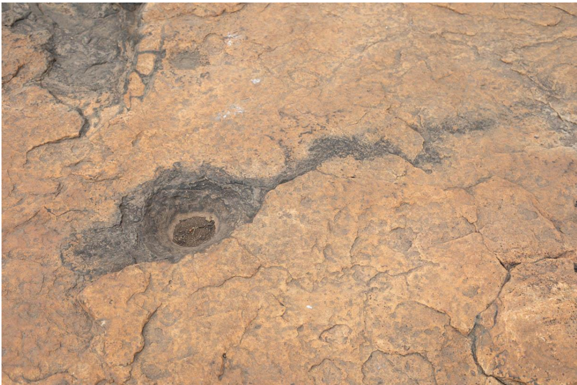
Figure 9. One of the cupules (small cavities) hollowed out by people. The dark colour of the cupule and the water trail could be staining from mineral deposits. Rock K

In addition, there are several areas of rock where people scoured out existing hollows and also created their own cupules (small cavities). All but one of these cupules are located next to natural depressions