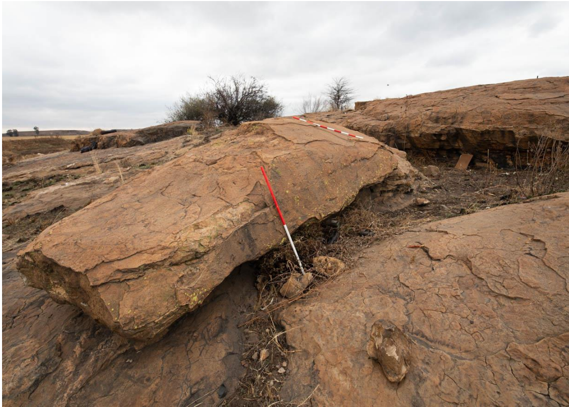
Figure 31. Rock L