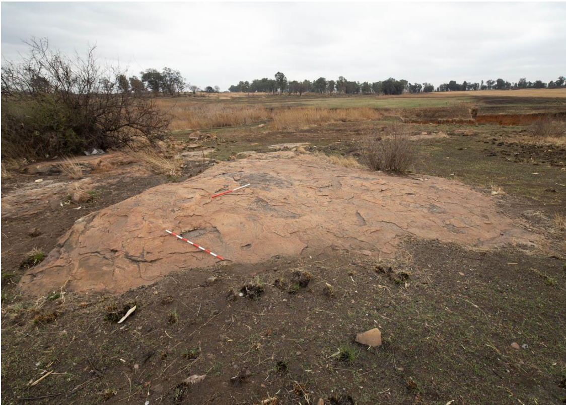
Figure 21. Rock A