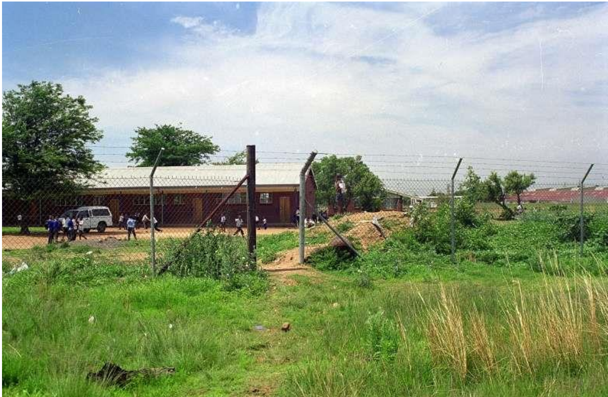
Figure 12. This gateway at the Springfield Junior Secondary School was used to access the site in the past.

Around the time that it was declared a National Monument the site was enclosed by a 2 m high diamond mesh fence with angled steel poles, barbed wire and a gate, together with a National Monuments Commission plaque. Despite these measures the Redan engraving site remained under threat from human activity. The fence was subsequently torn down and removed by looters and the site became degraded by litter and a small amount of graffiti. There was unsupervised access to the site via a gate at the nearby Springfield Junior Secondary School.