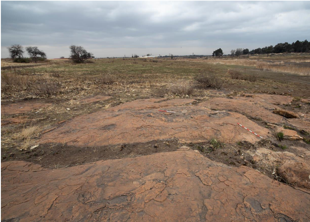
Figure 29. Rock J