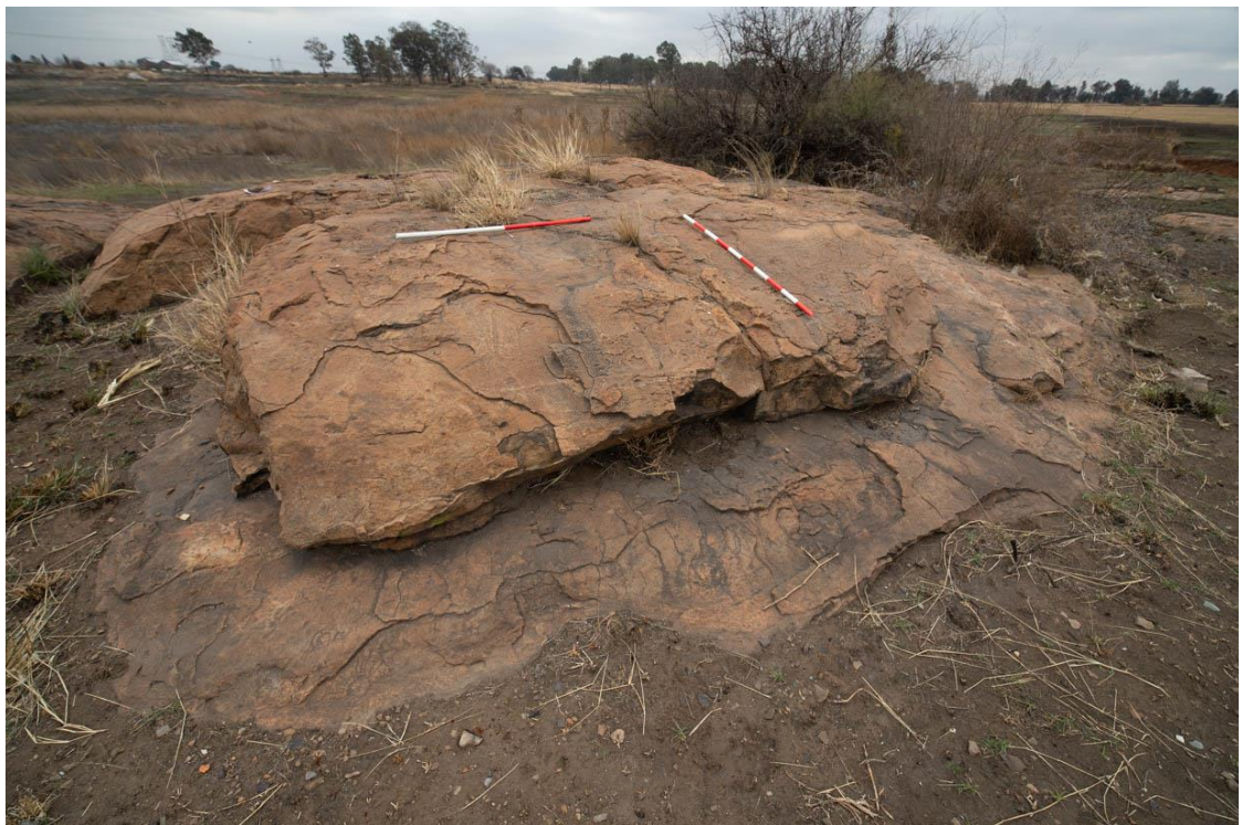
Figure 22. Rock C