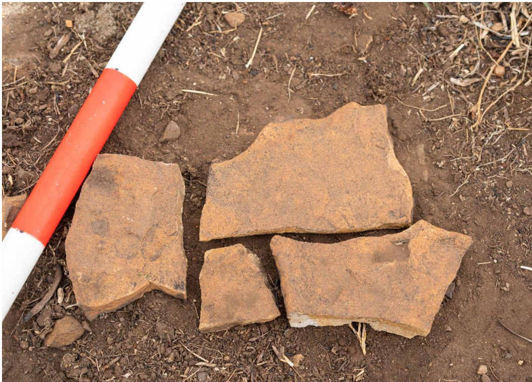
Figure 13. Fragments of engraved rock found at the base of Rock J on 1 September 2020. The rock surface is cracking as a result of natural weathering