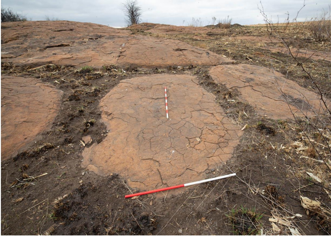
Figure 33. Rock N