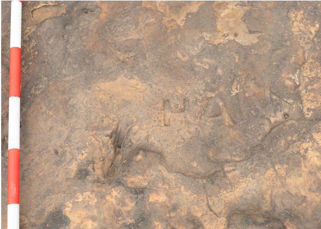
Figure 20. Historic graffiti at Redan engraving site. The initials 'HAW' have been carved into the rock

There is litter in and around the site, in the form of glass and plastic bottles, plastic bags and the accumulated contents of the ash heaps that are next to the outcrop. Litter may be blown across the veld by the wind and then gets trapped amongst the rocks and bushes. People might also litter when they visit the site.