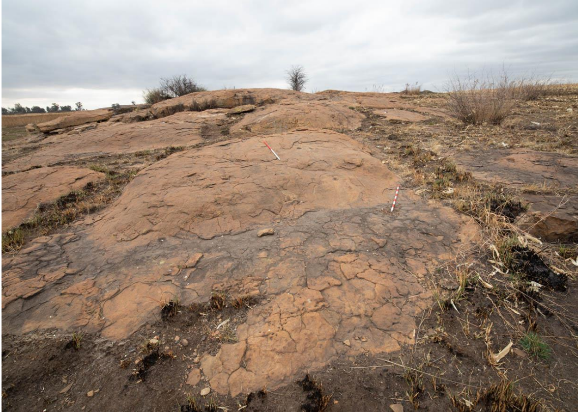
Figure 35. Rock P