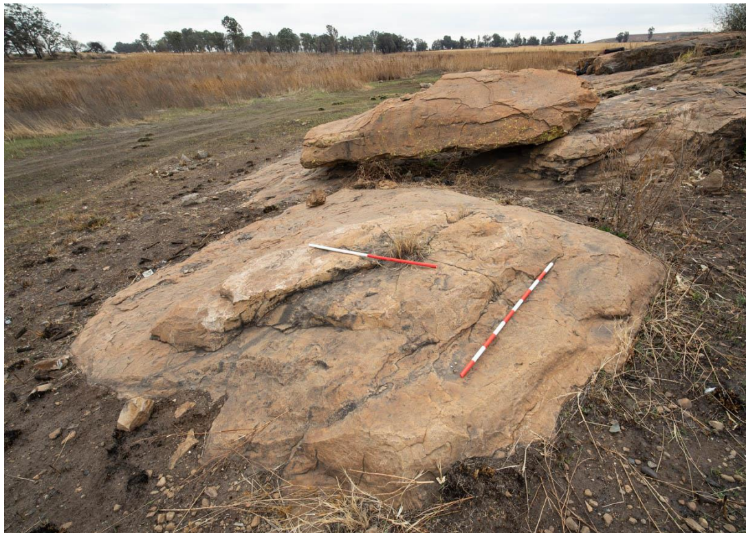
Figure 32. Rock M