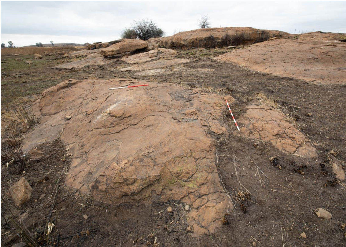
Figure 37. Rock R