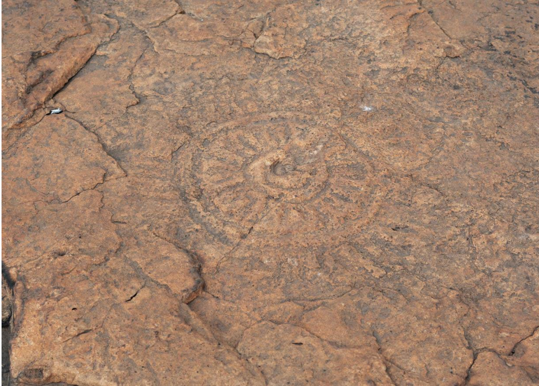
Figure 7. Every engraving a Redan is unique, but most of them are geometric designs such as this one, which has concentric circles and 'rays'. Rock K