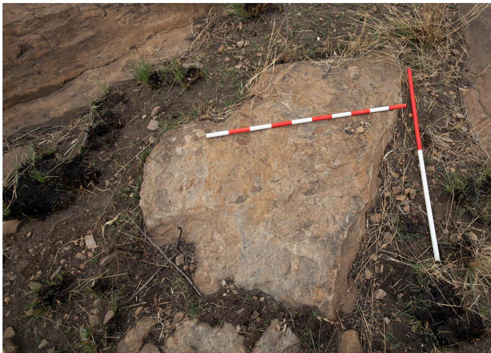
Figure 26. Rock G