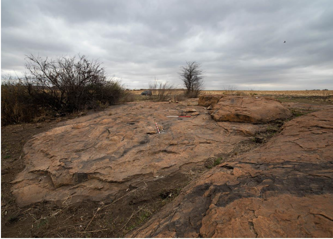
Figure 23. Rock D