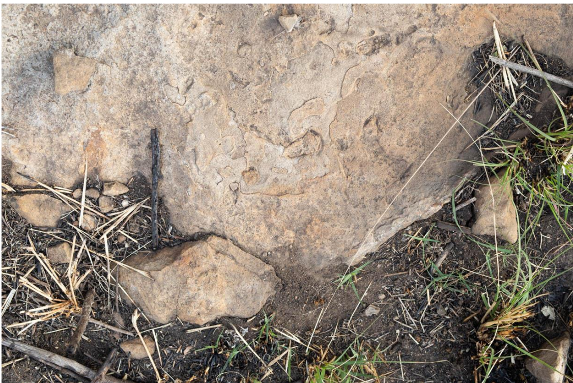
Figure 18. Close up photograph of the damage caused to the engraved rock by the heat of fires. Rock G