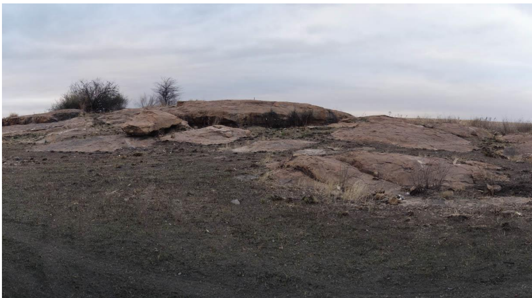
Figure 3. View of the Redan engraving site looking to the east. Behind the sandstone outcrops are agricultural fields

The Redan engraving site comprises an isolated cluster of Ecca sandstone outcrops about 0.1957 ha in area, approximately 55 m along a NW to SE axis and 45 m (at its widest) along a NE to SW axis. Although it is not more than 2 m above ground level the outcrop stands out in contrast to the surrounding flat terrain. Before 20th century industrialisation the outcrop would have been a local landmark.