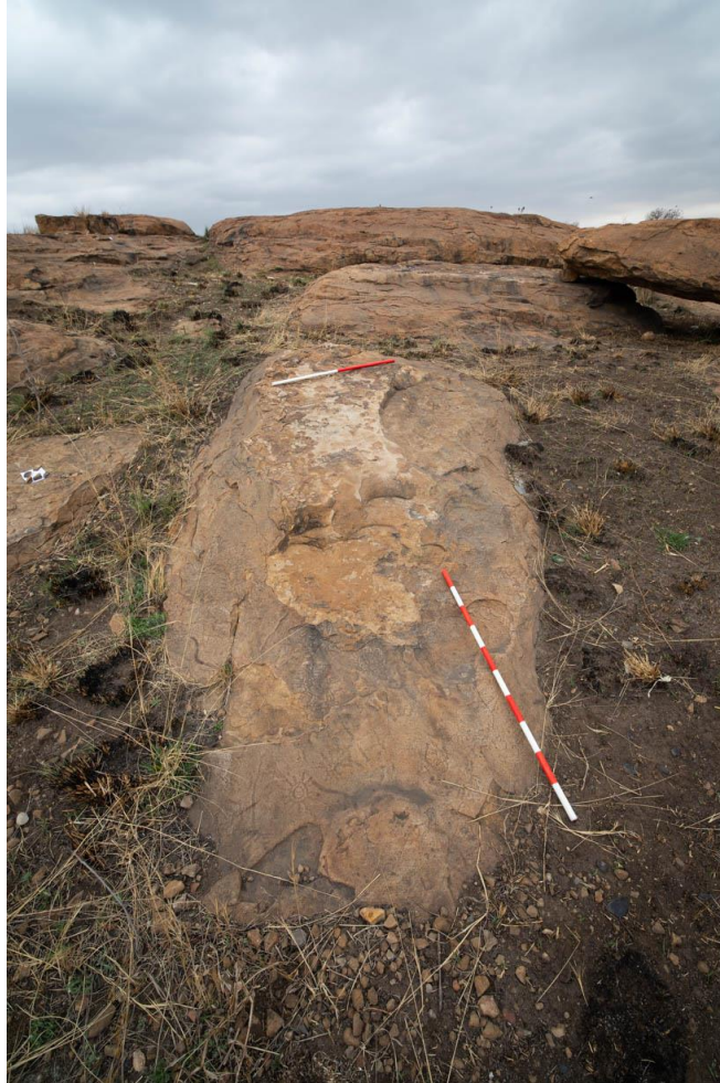
Figure 25. Rock F