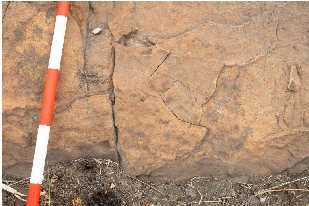
Figure 14. The fragments could be refitted onto the part of the rock from which they originated