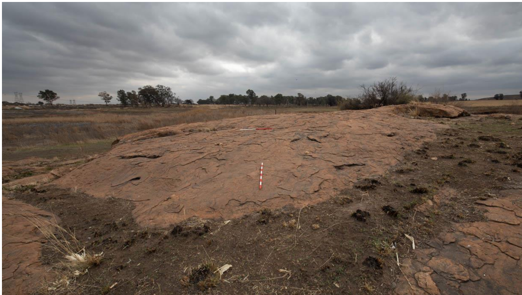
Figure 30. Rock K