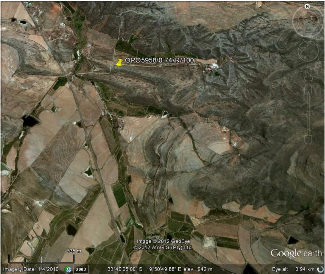
Figure 4: Aerial view of existing borrow pit location