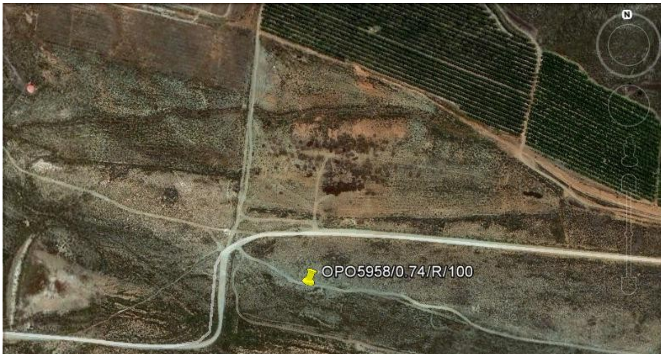
Figure 5: Aerial view of existing borrow pit (Google earth image, August 2012)