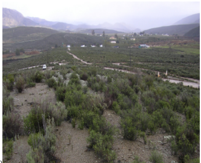
Figure 3: View northeast (July, 2011)