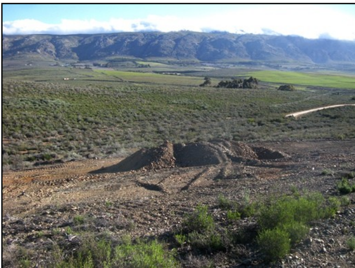
Figure 2: View southwest across borrow pit area (Almond 2012: 5)