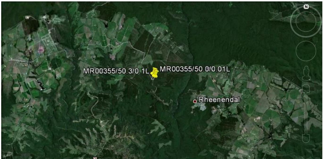
Figure 4: Aerial view of borrow pit locations (Google earth image, October 2012)