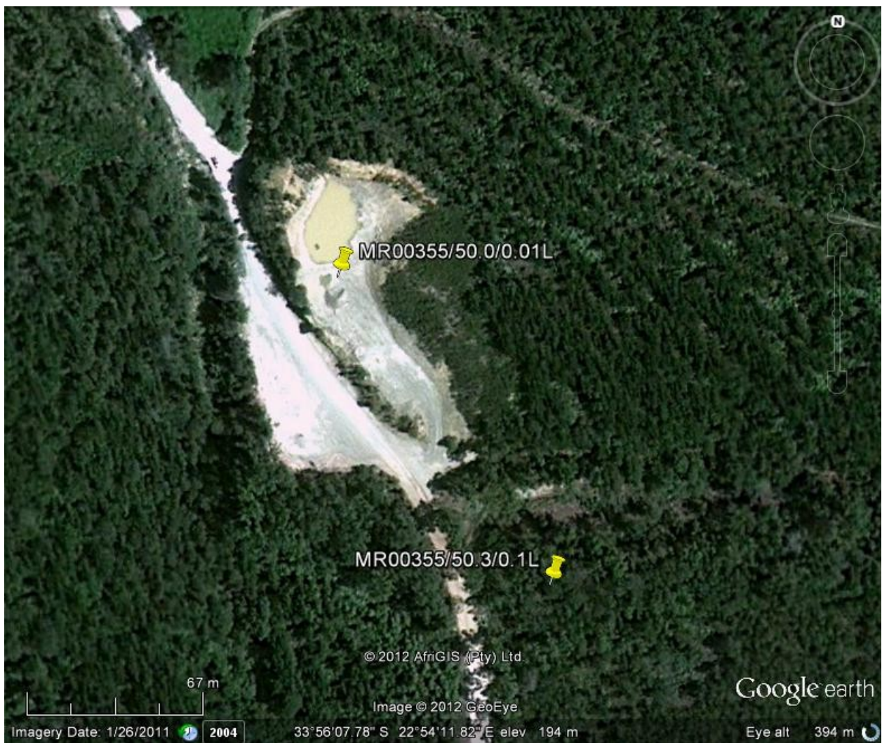
Figure 5: At km 37.2 aerial view of existing borrow pit and proposed pit (Google earth image, October 2012)