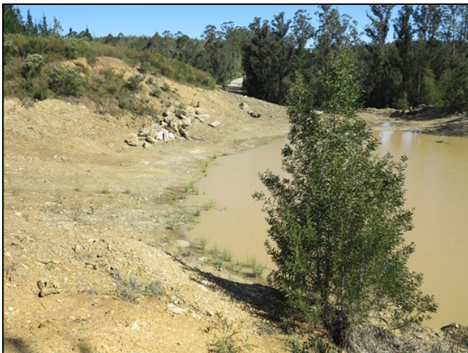
Figure 2: At km 50.0 view towards the south showing the water-filled pit (Tusenius 2012: 7)