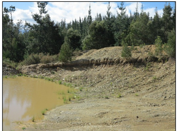
Figure 3: At km 50.3 view towards the north showing part of the water-filled pit and the heaps of soil on top of the original land surface on the northern edge of the pit (Tusenius 2012: 8)