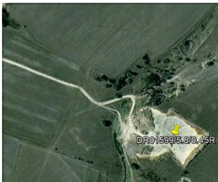
Figure 4: Aerial view of existing borrow pit and expropriation area to south (October 2012)