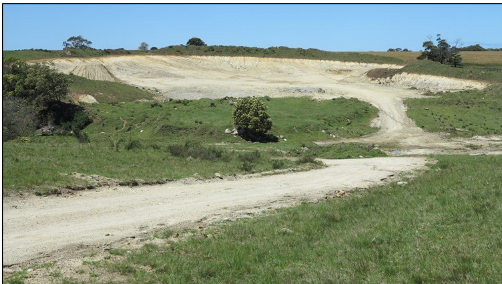
Figure 2: View towards the east showing the existing pit and part of the proposed southern extension (Tusenius 2012: 7)