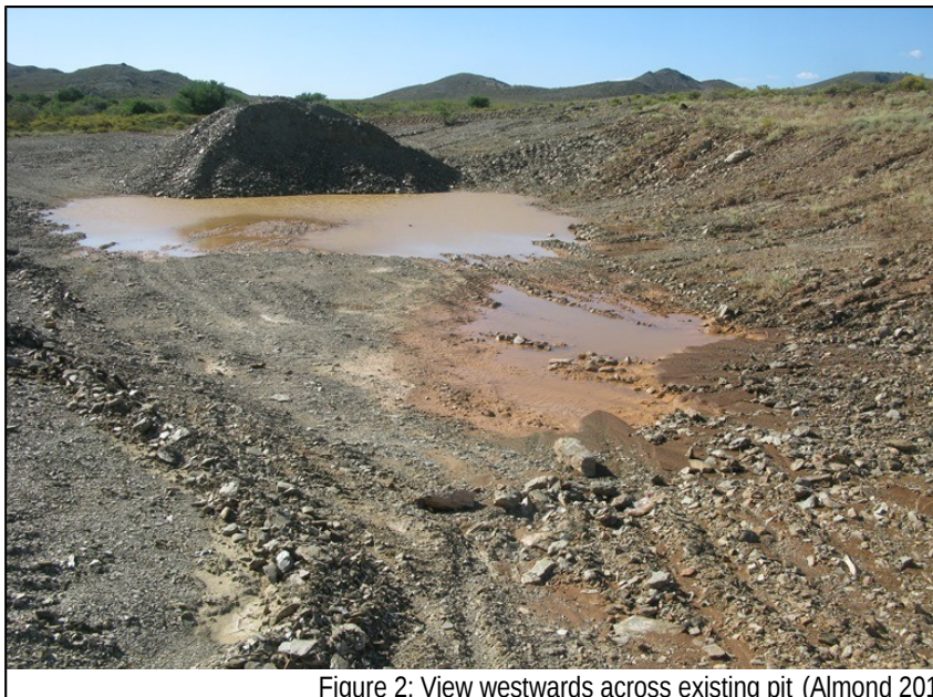
Figure 2: View westwards across existing pit (Almond 2013: 4)