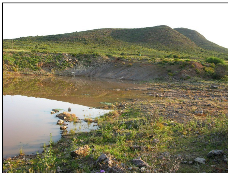
Figure 3: View southwestwards across the existing water-filled pit showing steep cut face in the SW with the low hill Skuilkop in the background (Almind 2013:5)