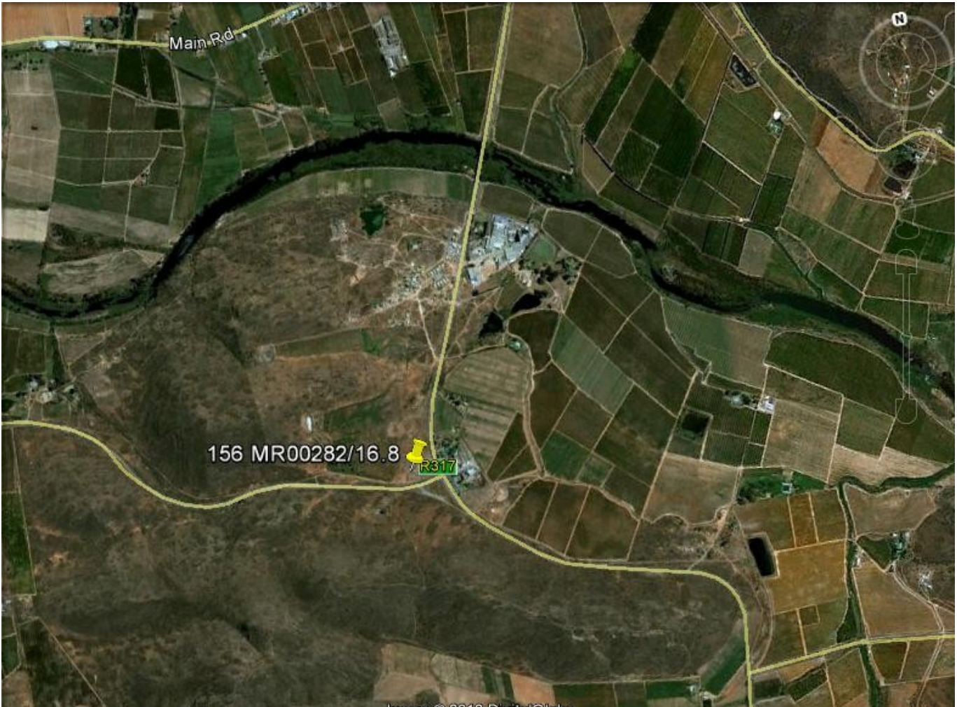
Figure 3: Aerial view of existing borrow pit location (Google earth image, February 2013)