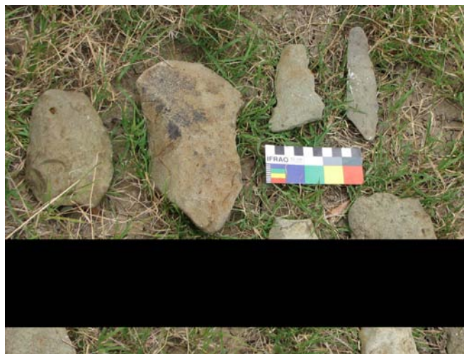
Acheulean cleavers, broken handaxe and flakes.