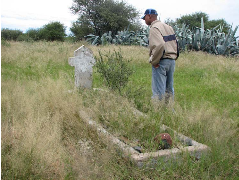
Graves in the adjacent cemetery