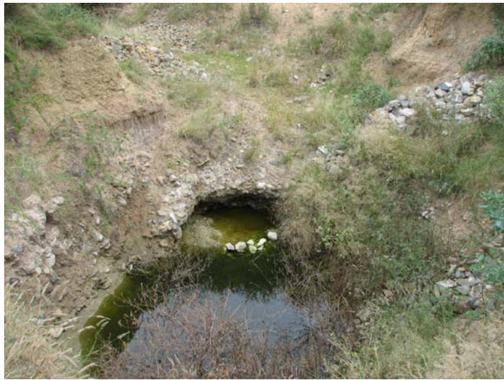
Older diggers' pit showing Younger Gravels overlain by silt.