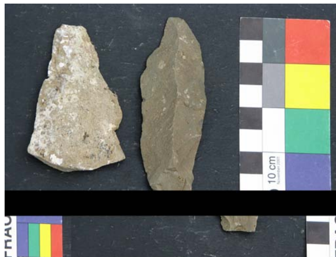
MSA or Fauresmith artefacts