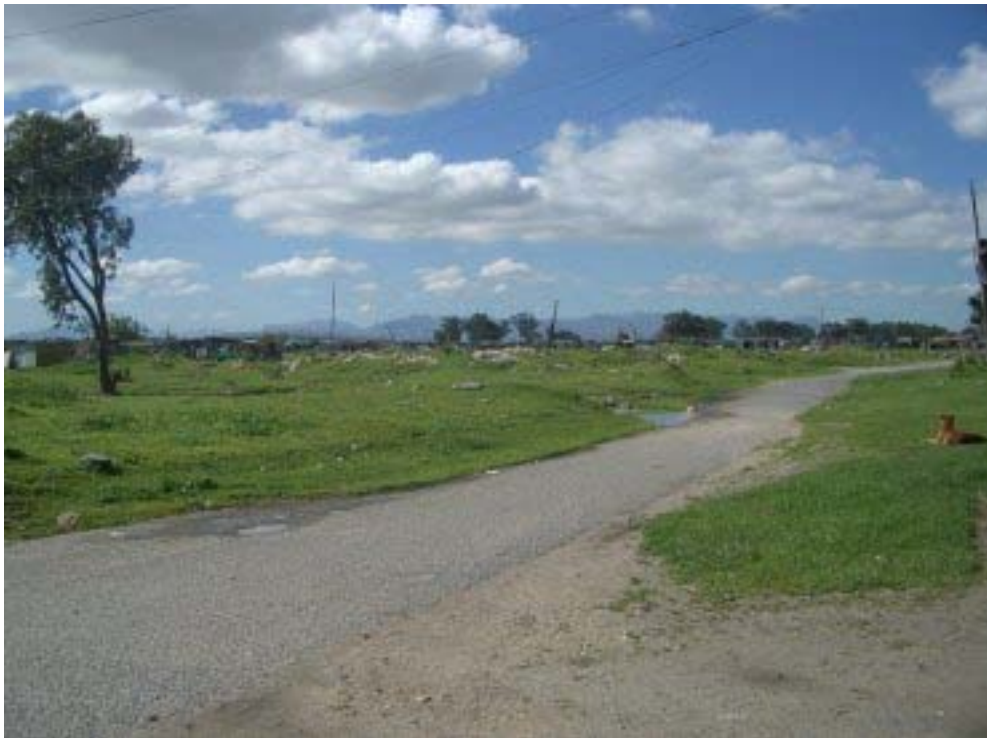
Figure 4. The site facing north east.