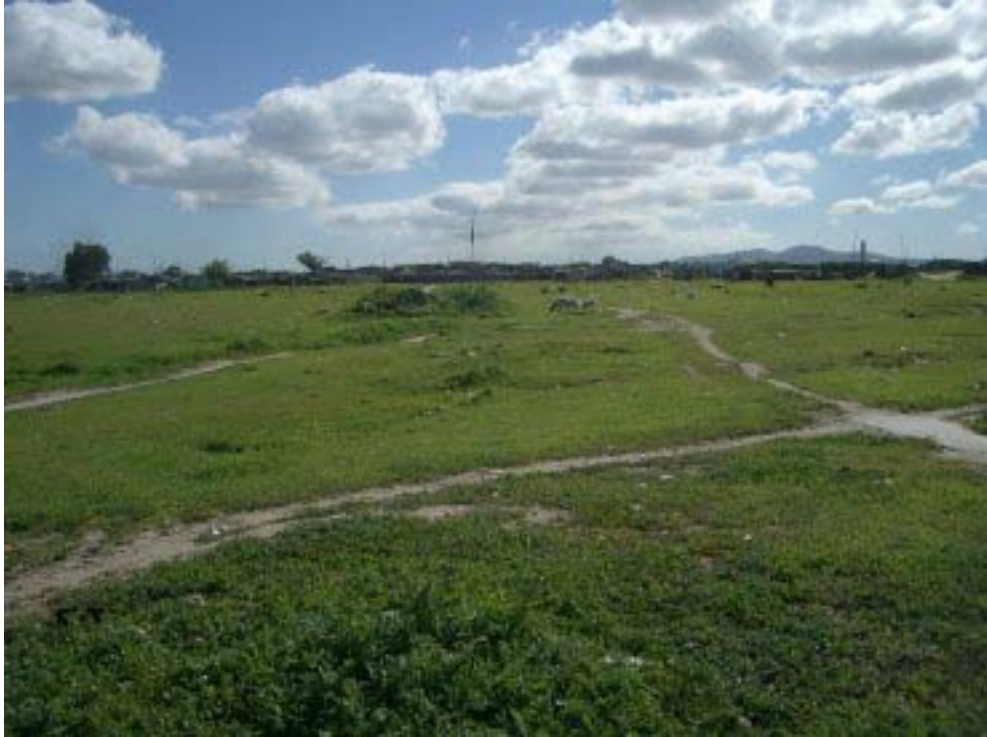
Figure 3. The site facing north west.