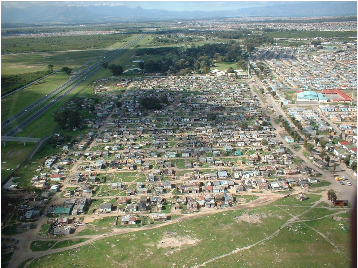
Figure 2. Aerial photograph of the site located between the N2 and Old Klipfontein Road.