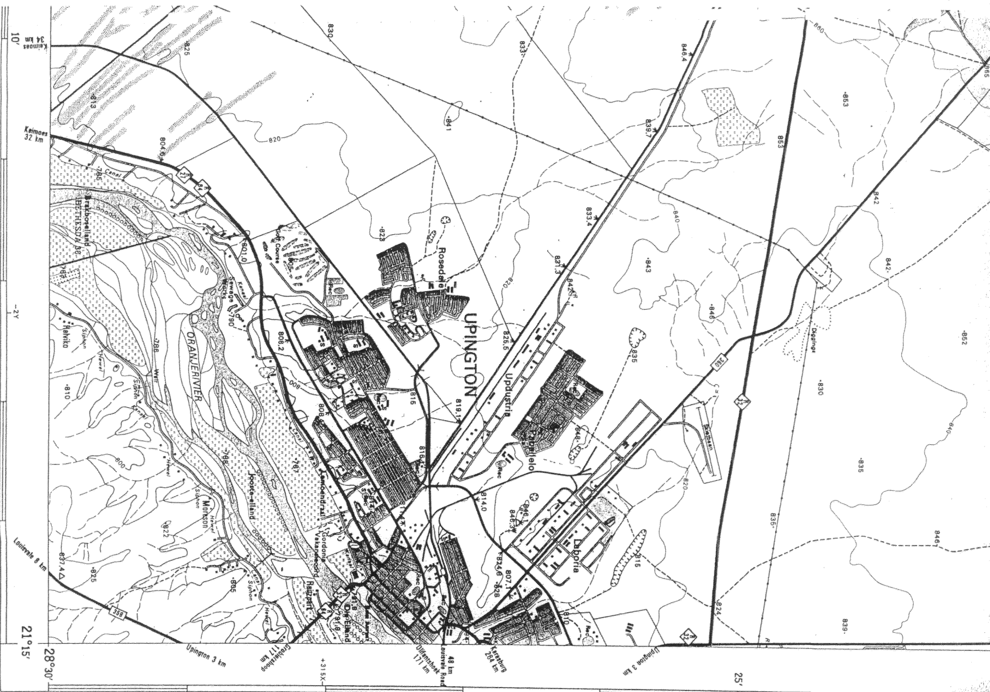
FIG. 1. 2821 AC UPINGTON

Printed by the Government Printer, Private Bag X86, Pretoria Gedruk deur die Staatsdrukker, Private Bag X86, Pretoria