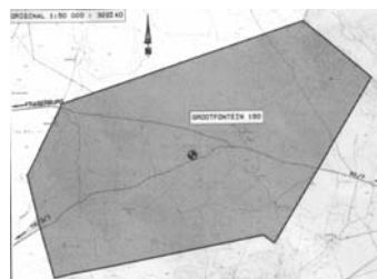
Figure 2. Farm boundary as shown on 1: 50 000 3222 AD. Borrow pit marked close to road junction