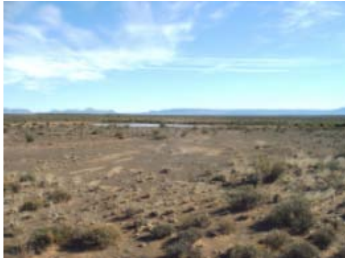
Figure 3. View of the area