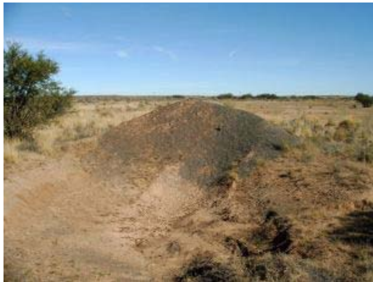
Figure 3. View of the property from a test pit.