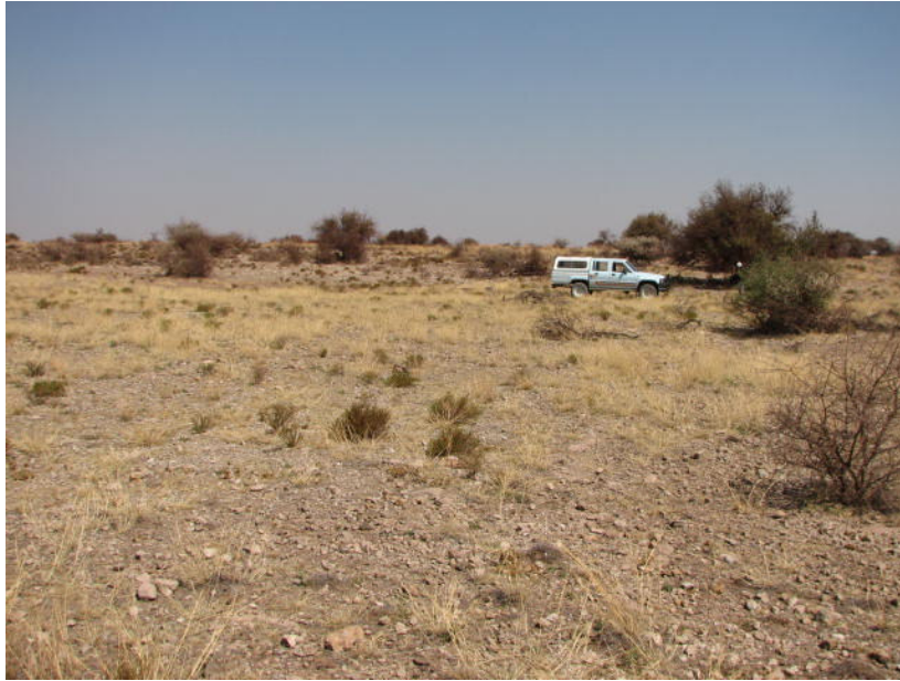
Small pan site on Leeuwfontein