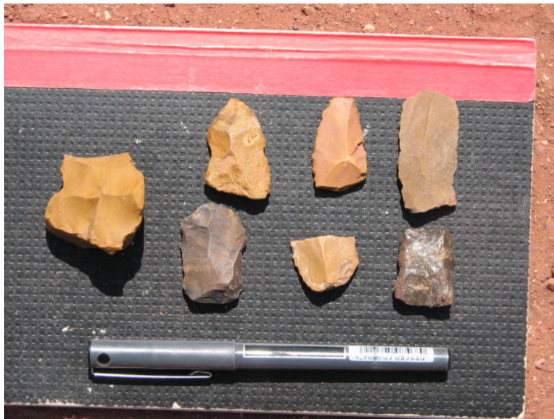
Artefacts from small pan site, Leeuwfontein