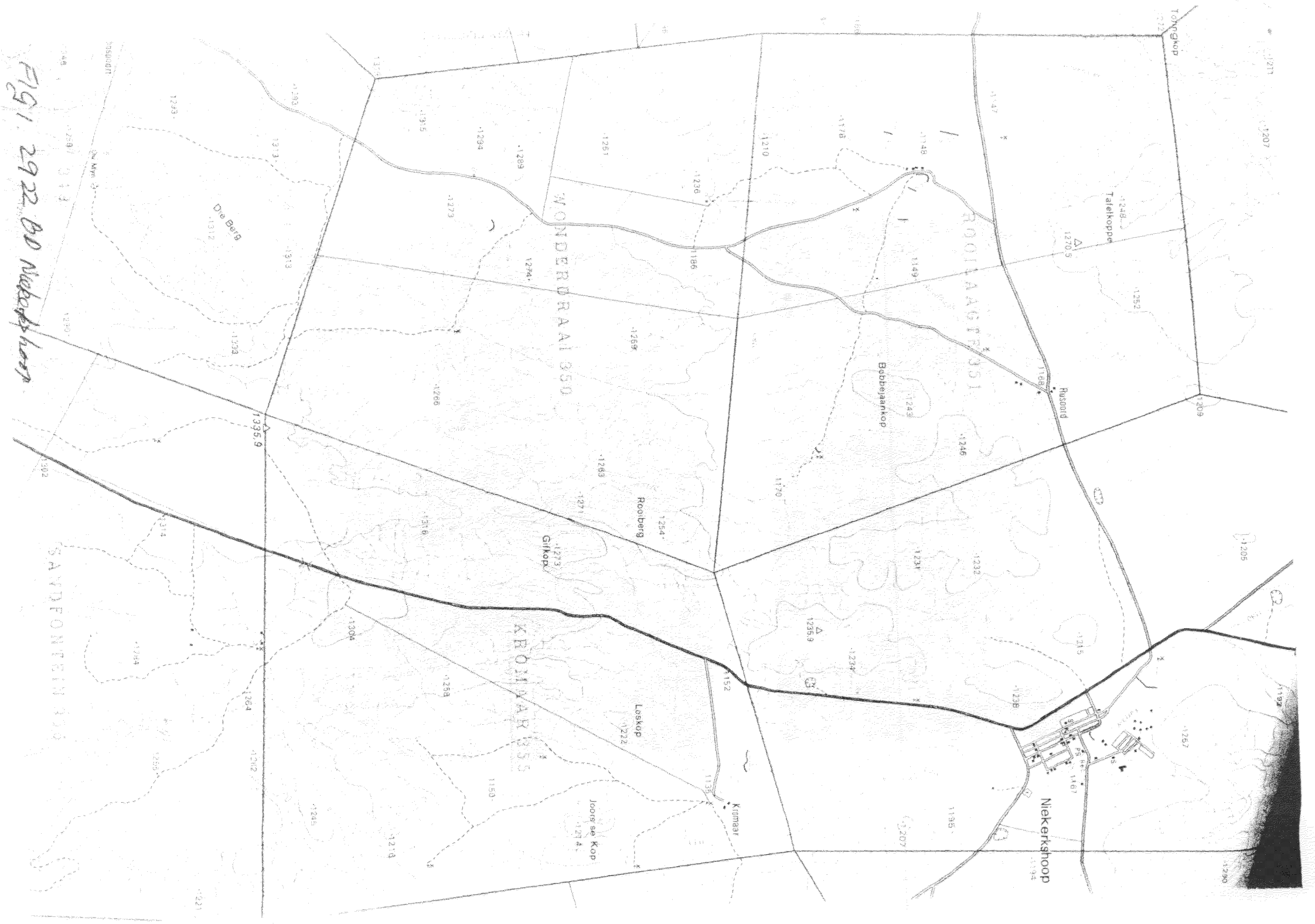
Fig. 1 2922 BD Nickerhoop