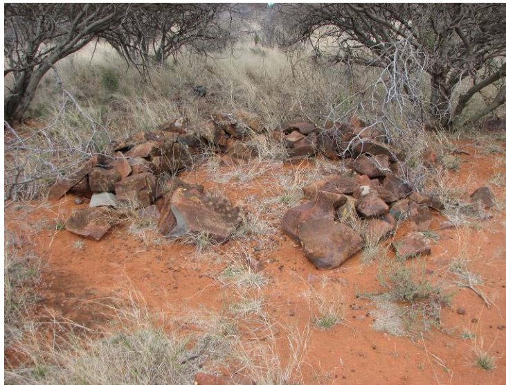
Stone walled features and artefacts relating to twentieth century small-scale mining