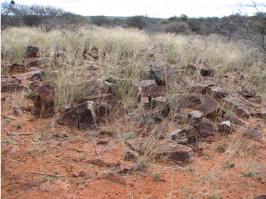
The setting of the claim with outcropping andesite (above), and old digger pits and heaps of gravel (below).