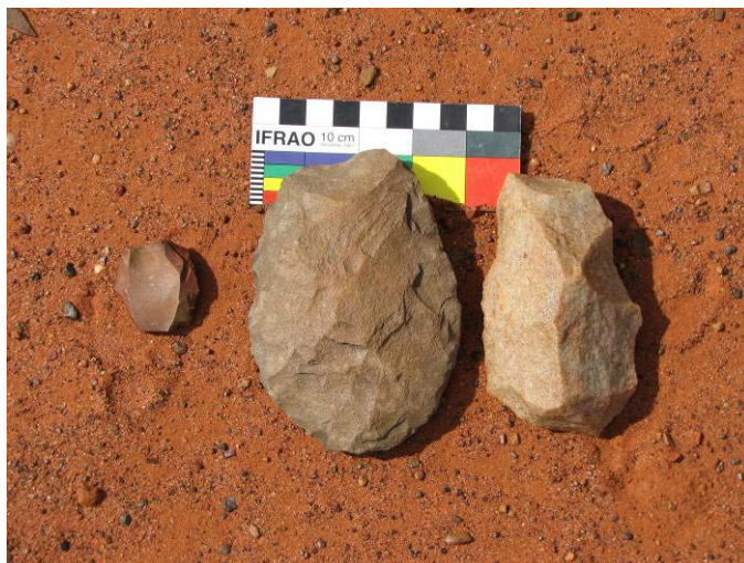
Artefacts based on quartzite and chert