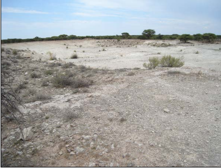
Fig.6 BP 4.