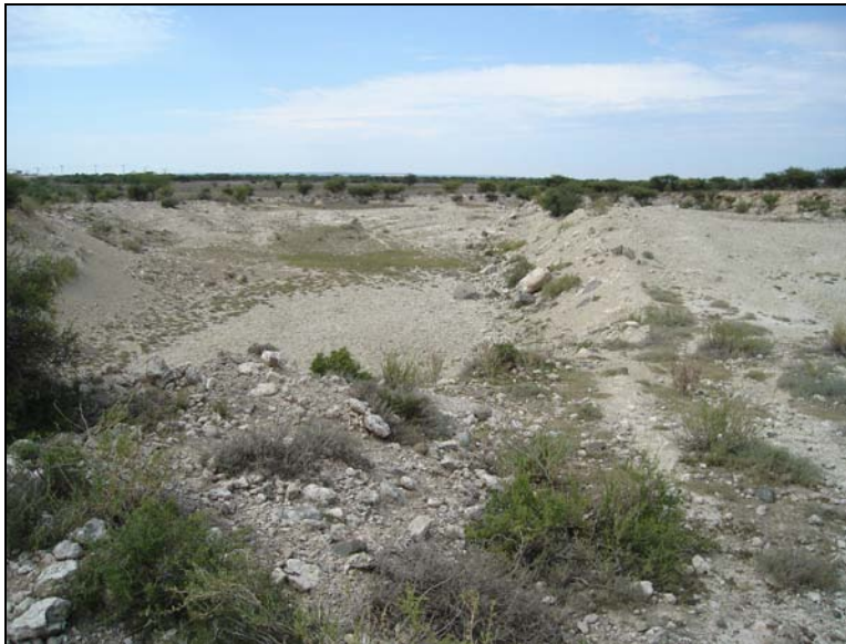
Fig.1 BP 1 Existing borrow pit at Km 78,0 on the R385 road.