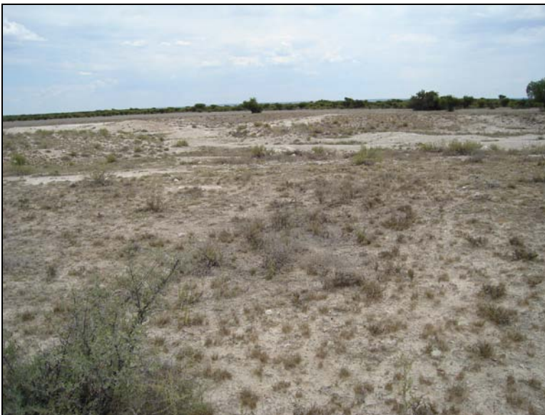
Fig.3 BP 2.