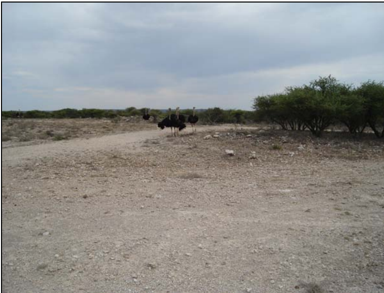
Fig.7 BP 4.