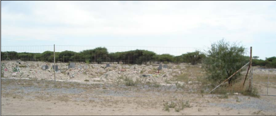
Fig.10 Cemetery 1.