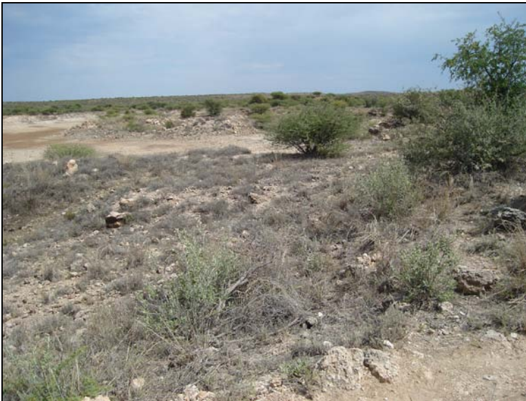
Fig.5 BP 3.