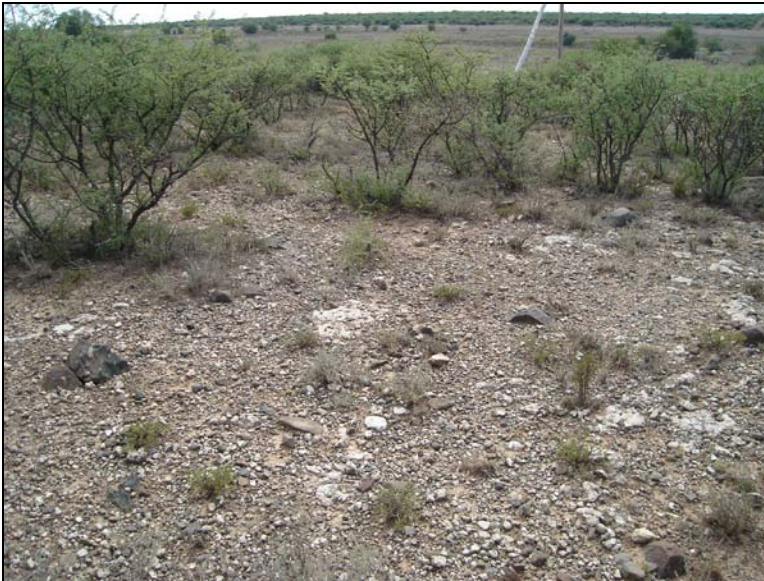
Fig.2 BP 1 Showing stone and bush cover on surface.