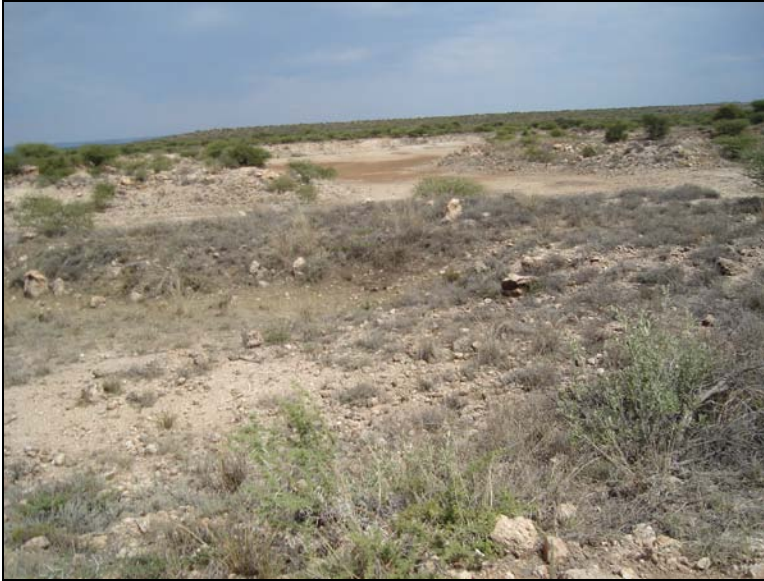
Fig.4 BP 3.