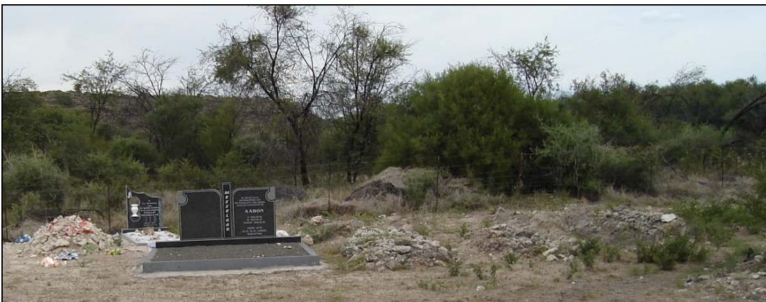
Fig.11 Cemetery 2.