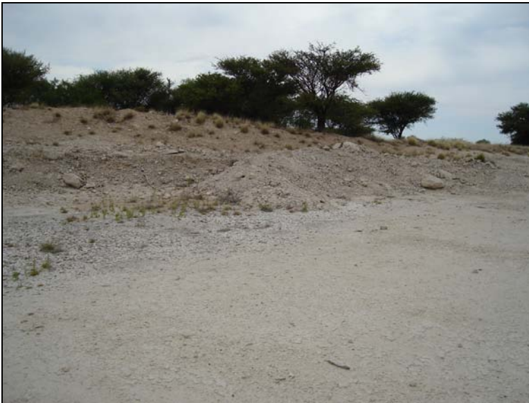
Fig.9 BP 5.