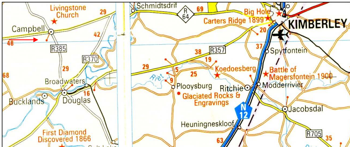
Map 1 The R385 road between Douglas & Campbell, Northern Cape.