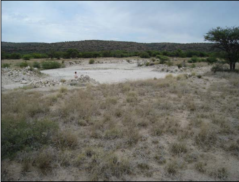
Fig.8 BP 5.