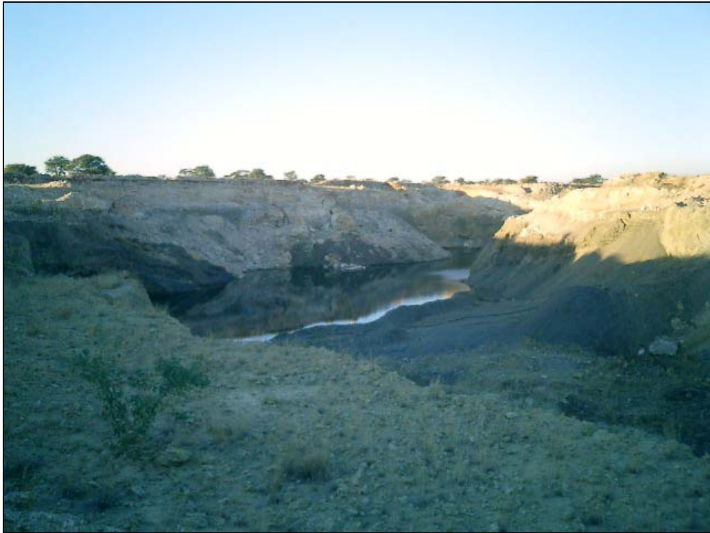
IMAGE 1: PK 1 – The proposed (un-rehabilitated former) mining area