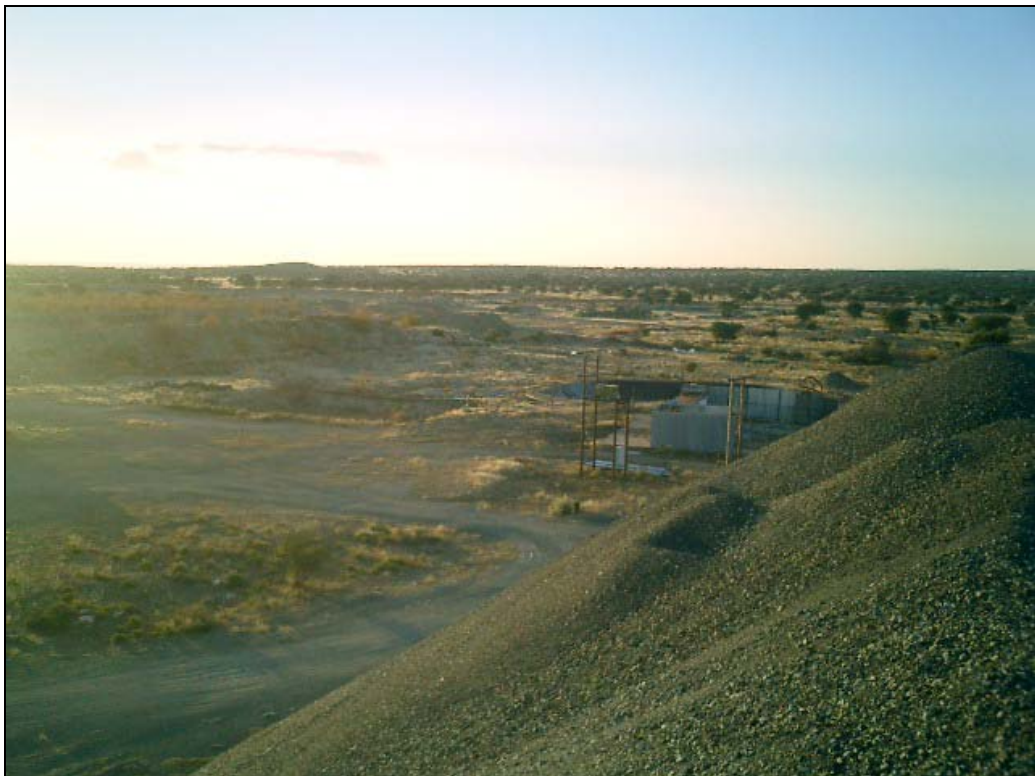
IMAGE 2: Disturbed (smaller dumps) surface toward the PK 1 mining area seen from the proposed processing plant.