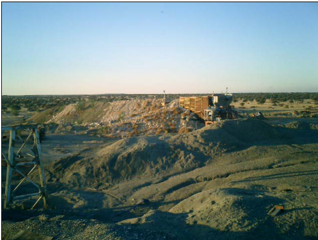
IMAGE 4: The proposed processing plant (ramp seen from adjacent dump)